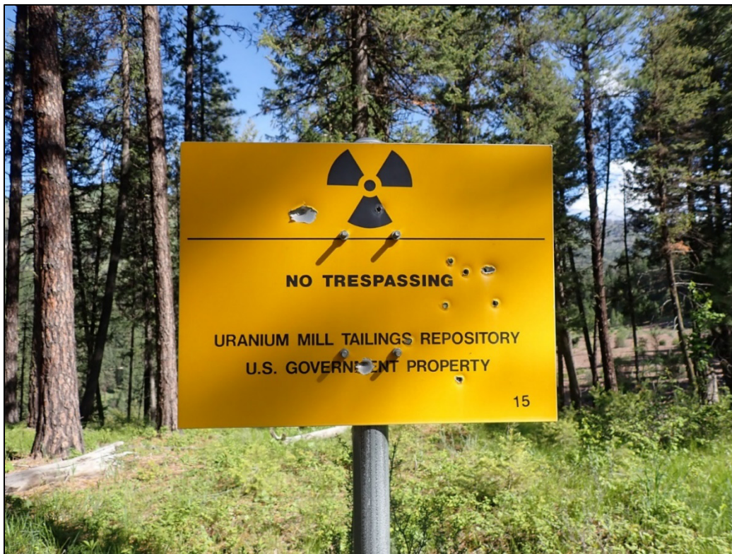
PL-2. Perimeter Sign P15 with Bullet Damage