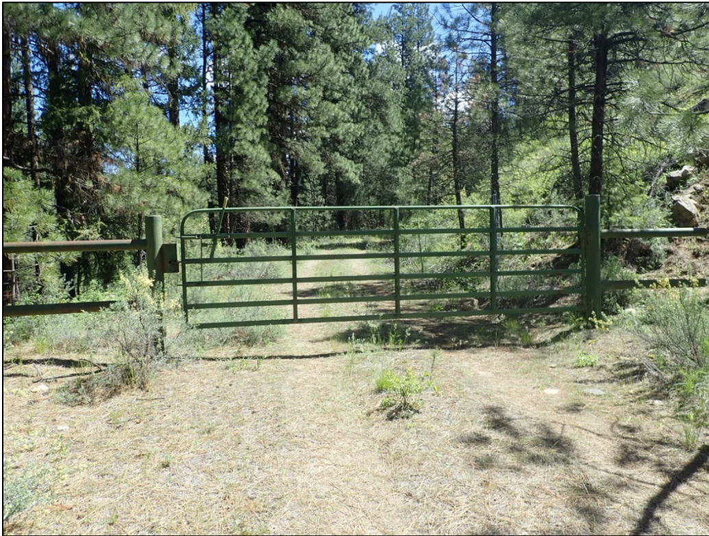
PL-1. Site Entrance Gate