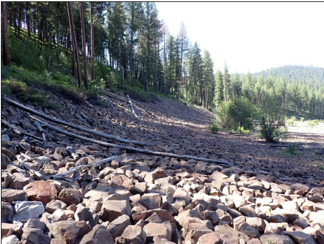
PL-6. Disposal Cell Apron on Eastern Side