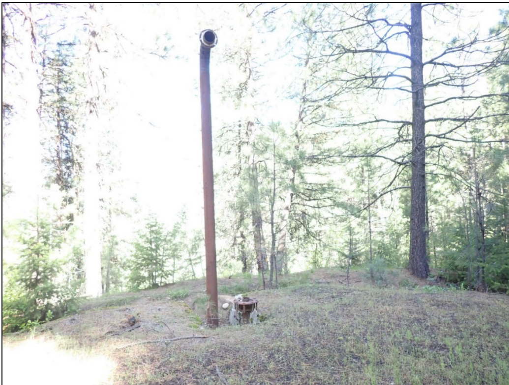
PL-8. Piping from Former Mill