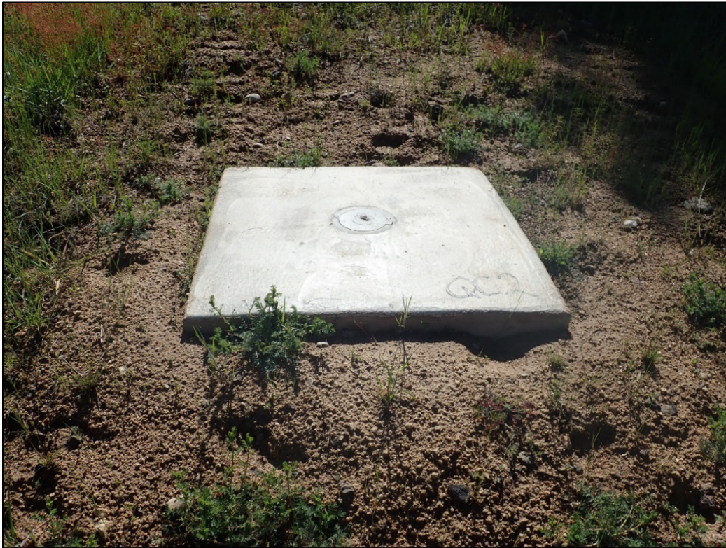
PL-5. Quality Control Monument QC-2