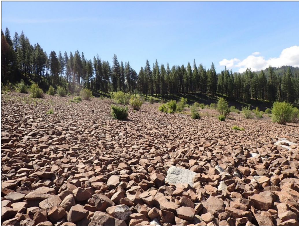
PL-7. Disposal Cell Top Slope