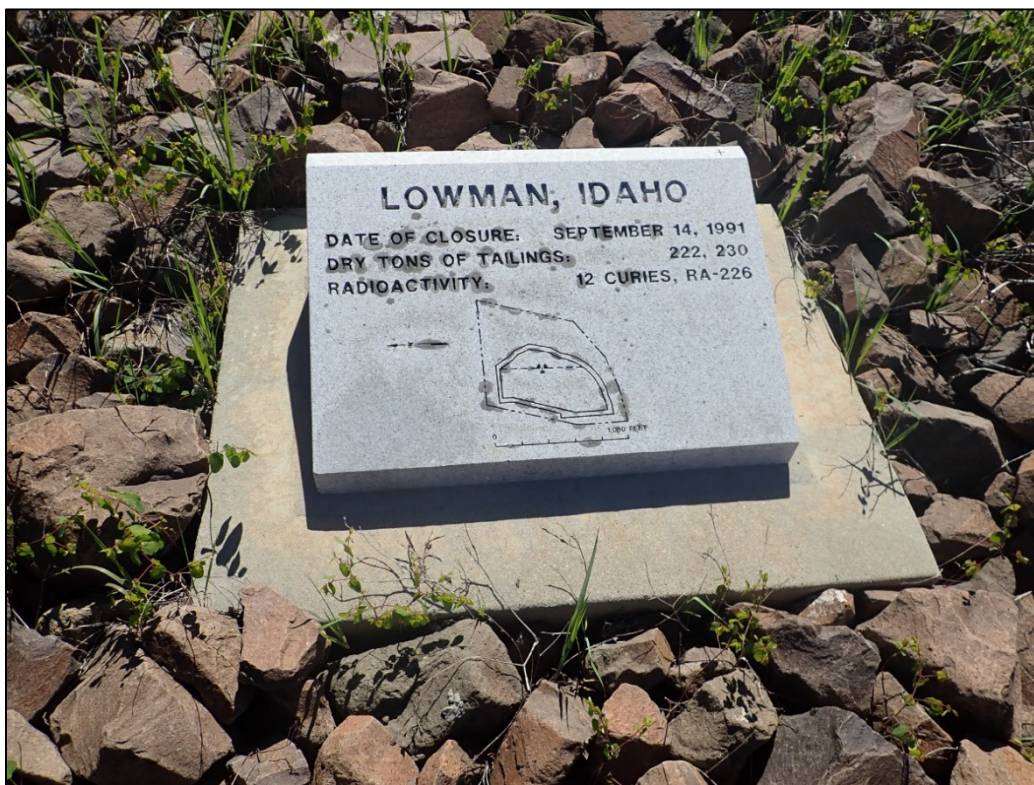
PL-3. Site Marker SMK-2