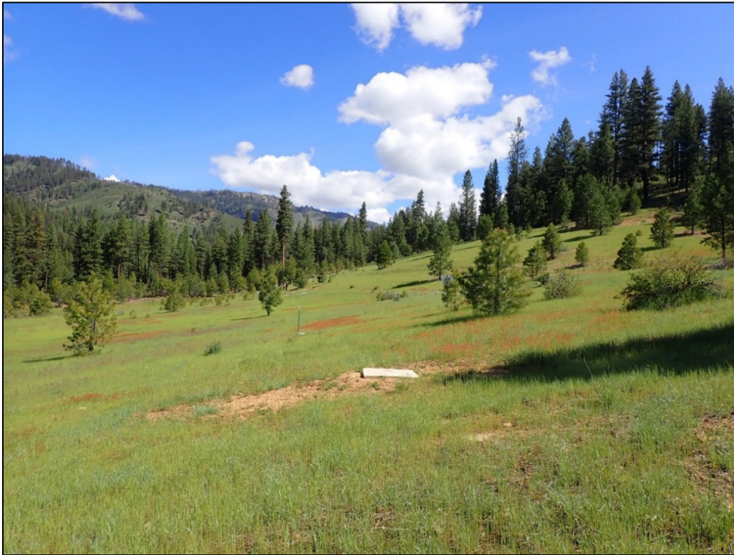
PL-9. Interceptor Benches with Quality Control Monument QC-2 in Foreground