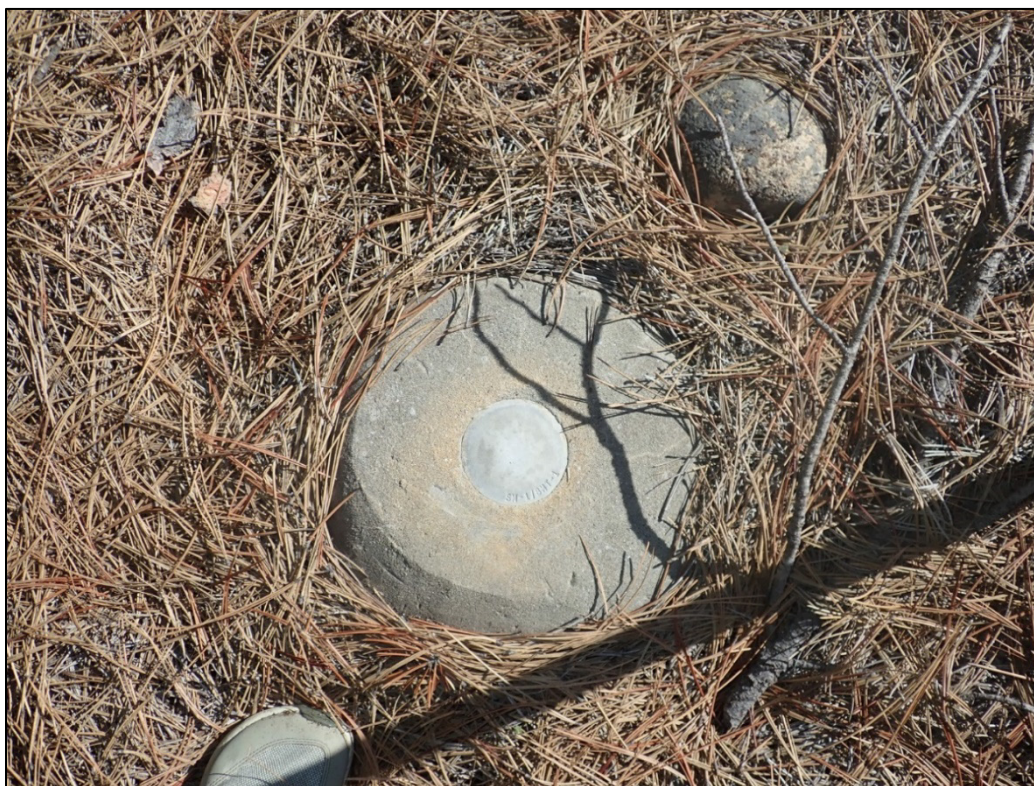
PL-4. Combined Survey and Boundary Monument 1