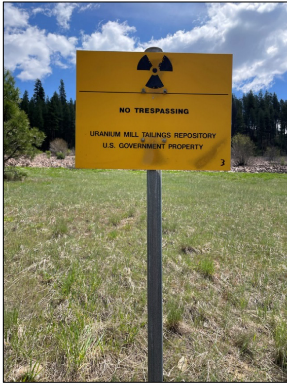
PL-1. Replaced Perimeter Sign P3