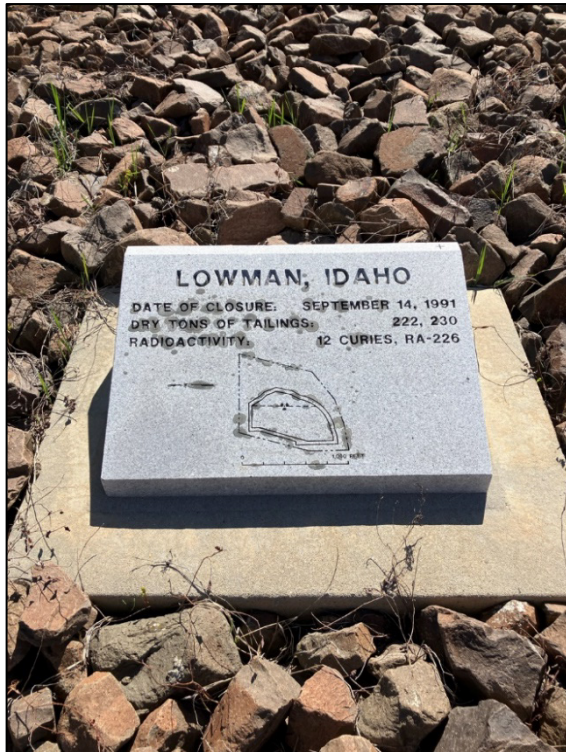
PL-2. Site Marker SMK-2