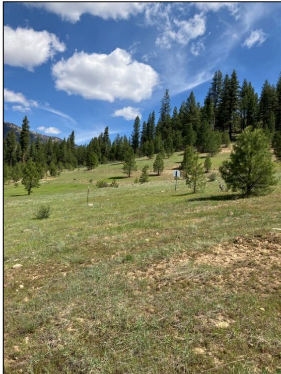
PL-6. Interceptor Benches