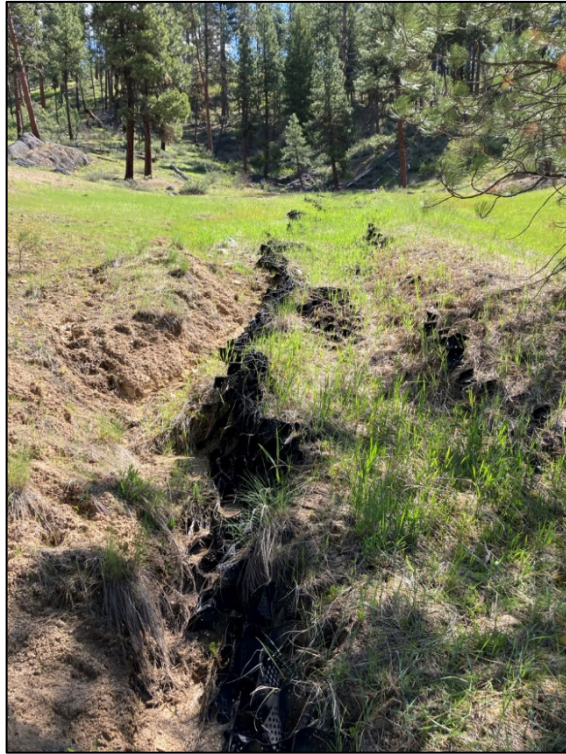
PL-7. Erosion on North Interceptor Bench