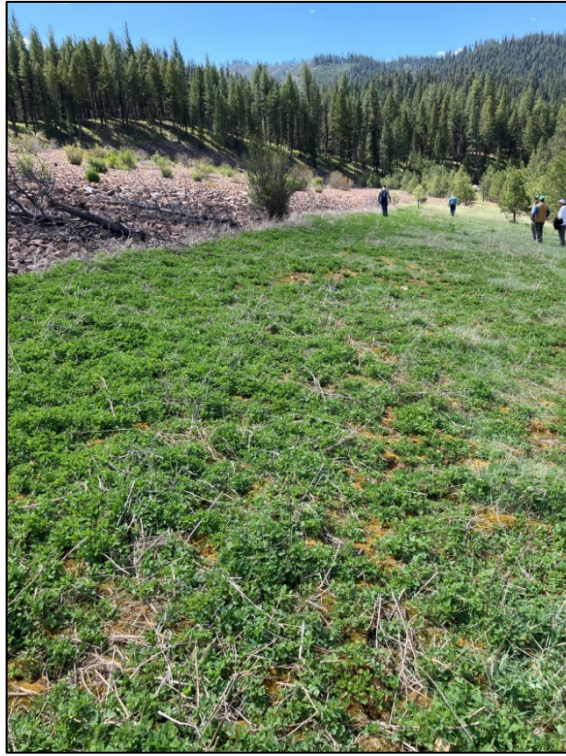
PL-5. Vegetation Growing in Saturated Soil Area