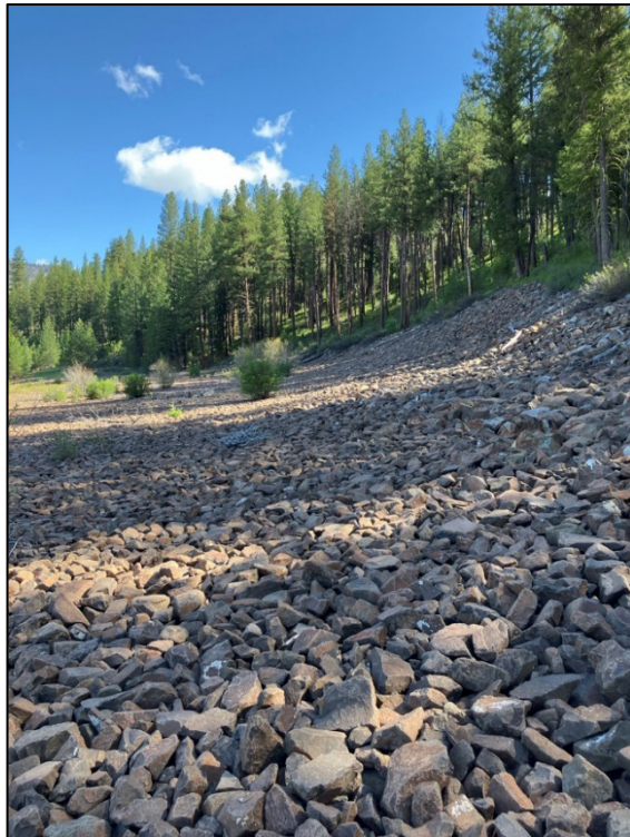
PL-4. Eastern Side of Disposal Cell