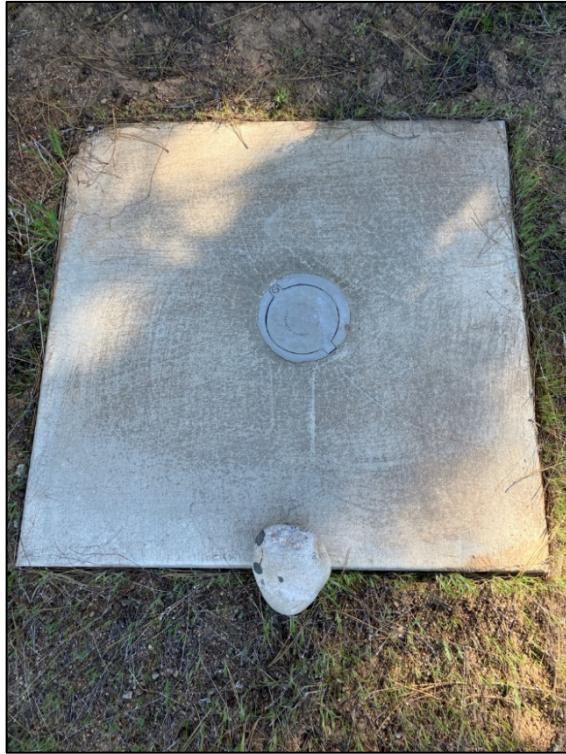
PL-3. Quality Control Monument QC-1