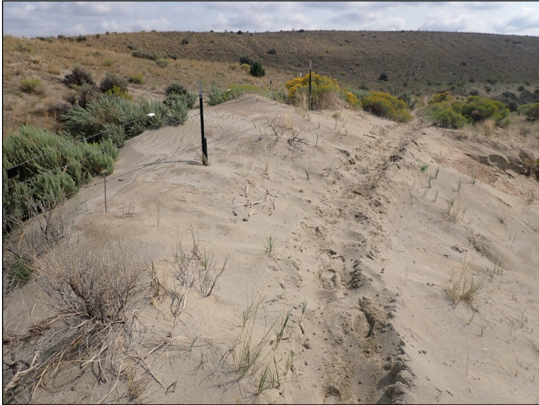
PL-15. Sand Accumulation Along Southern Fence Line Near Johnson Pit