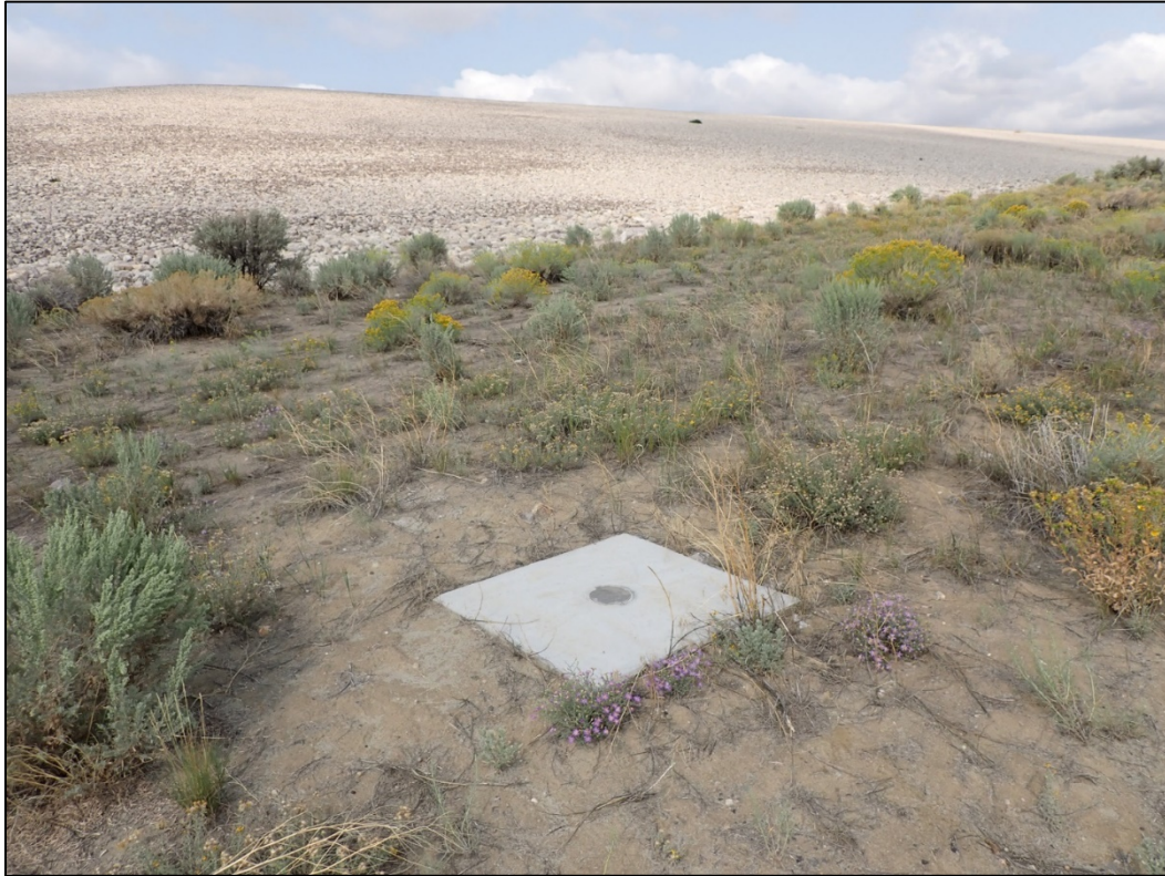
PL-7. Quality Control Monument QC-4