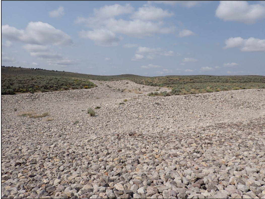
PL-11. View Southwest of Diversion Channel No. 2