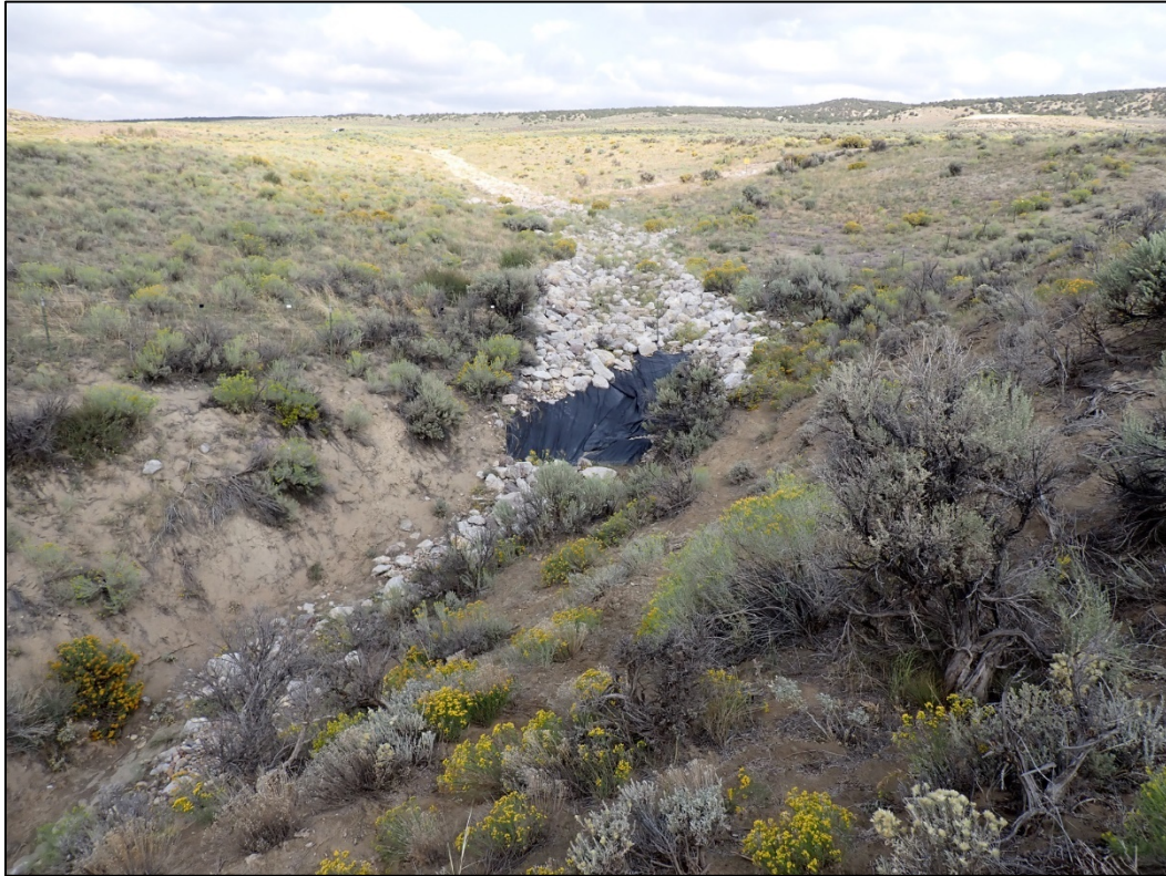
PL-13. Exposed Geofabric in Swale No. 1 Outlet