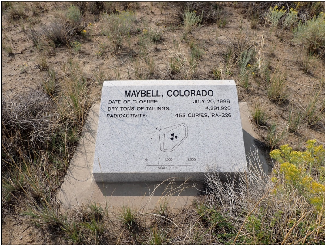
PL-5. Granite Site Marker SMK-1