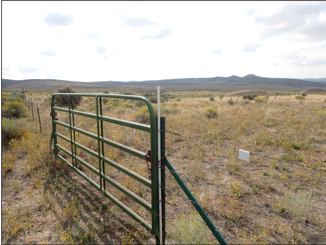
PL-1. Entrance Gate