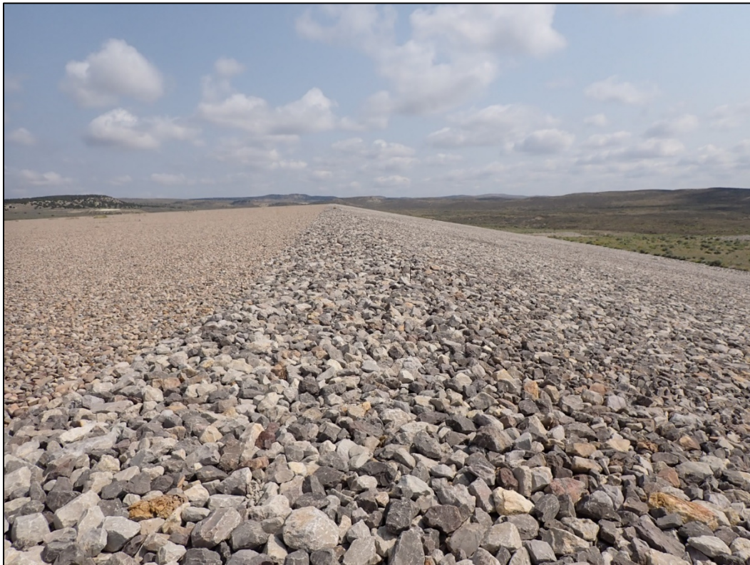
PL-8. Disposal Cell Top Slope and Southeastern Side Slope Interface