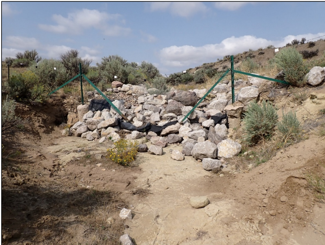
PL-12. Exposed Geofabric in Diversion Channel No. 1 Outlet