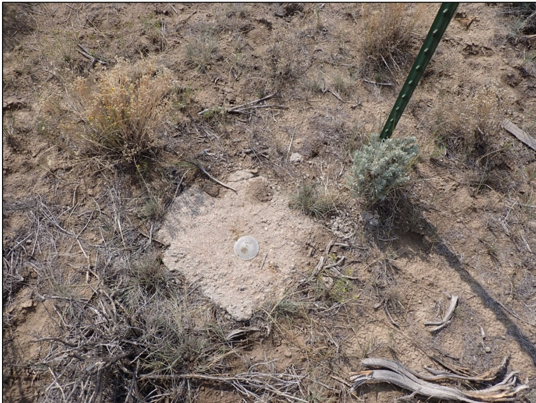
PL-6. Boundary Monument BM-12