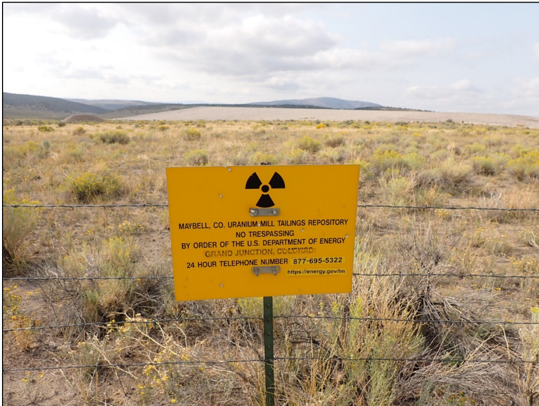
PL-2. Entrance Sign