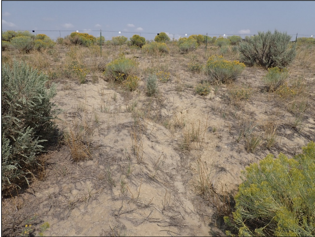
PL-3. Perimeter Fence Line