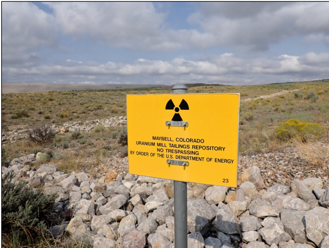
PL-4. Perimeter Sign P23