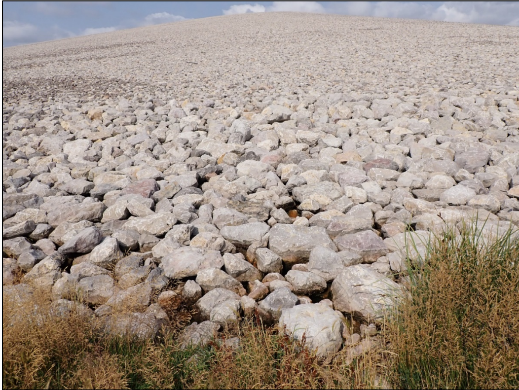
PL-9. Standing Water in Side Slope Apron