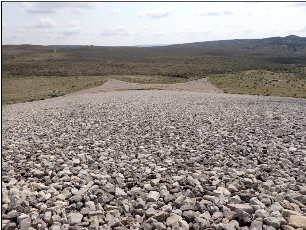
PL-10. Disposal Cell Eastern Side Slope and Cobble Blanket