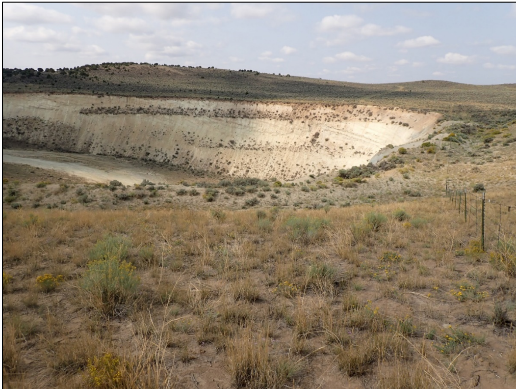
PL-14. Southwest View of Johnson Pit