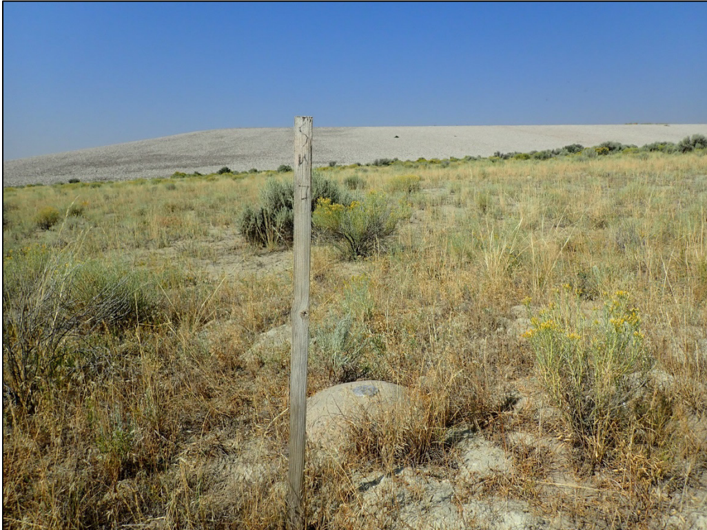
PL-5. Survey Monument SM-7