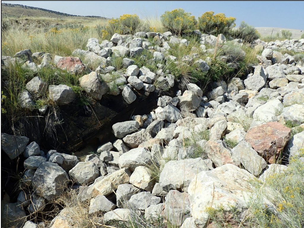
PL-13. Exposed Geofabric in Swale No. 2