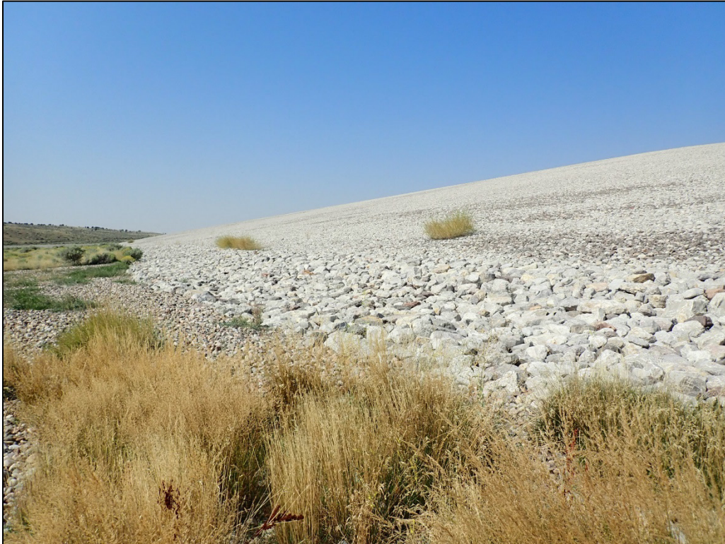
PL-9. Cattails Along Eastern Side Slope Apron