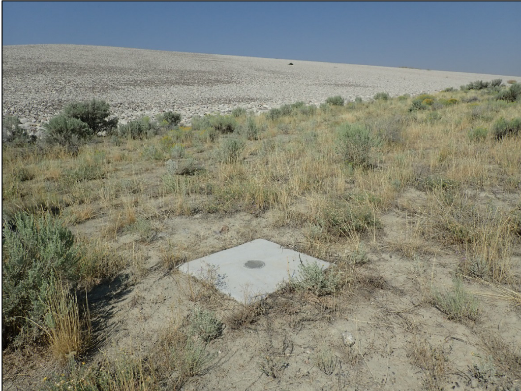
PL-7. Quality Control Monument QC-4