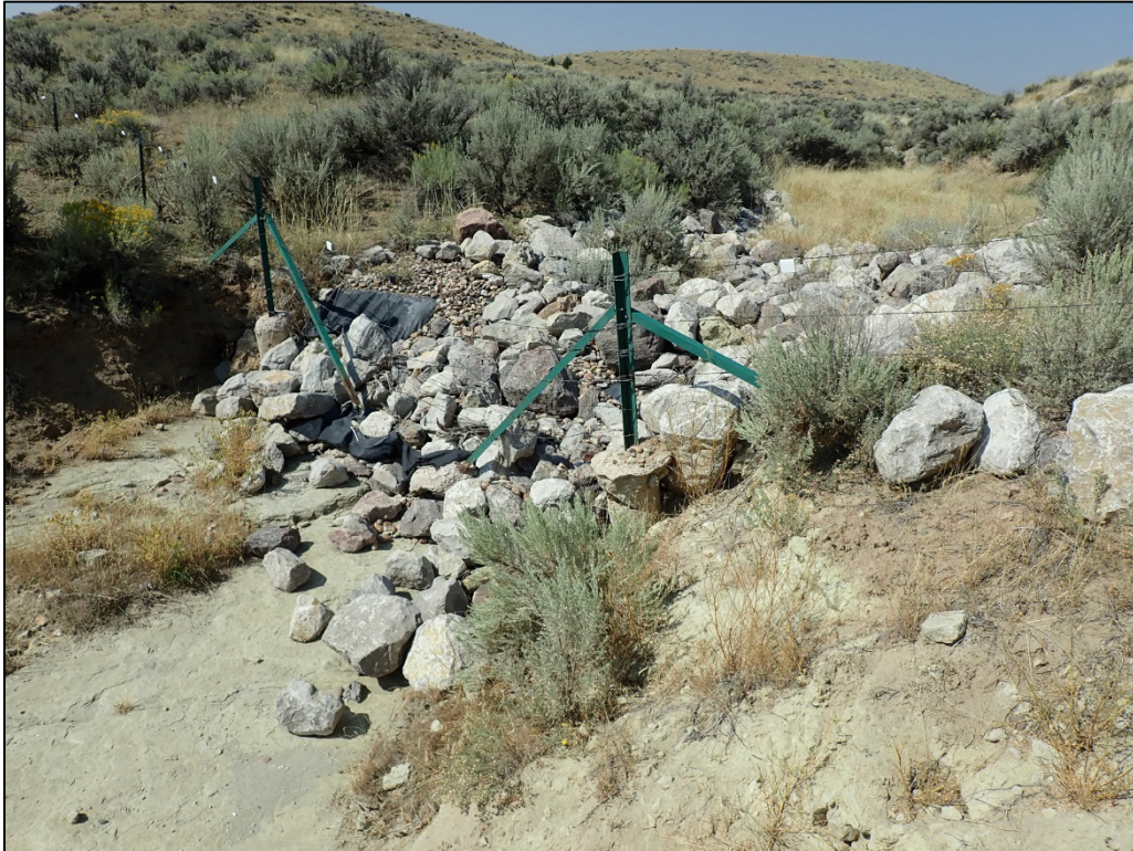
PL-11. Exposed Geofabric in Diversion Channel No. 1