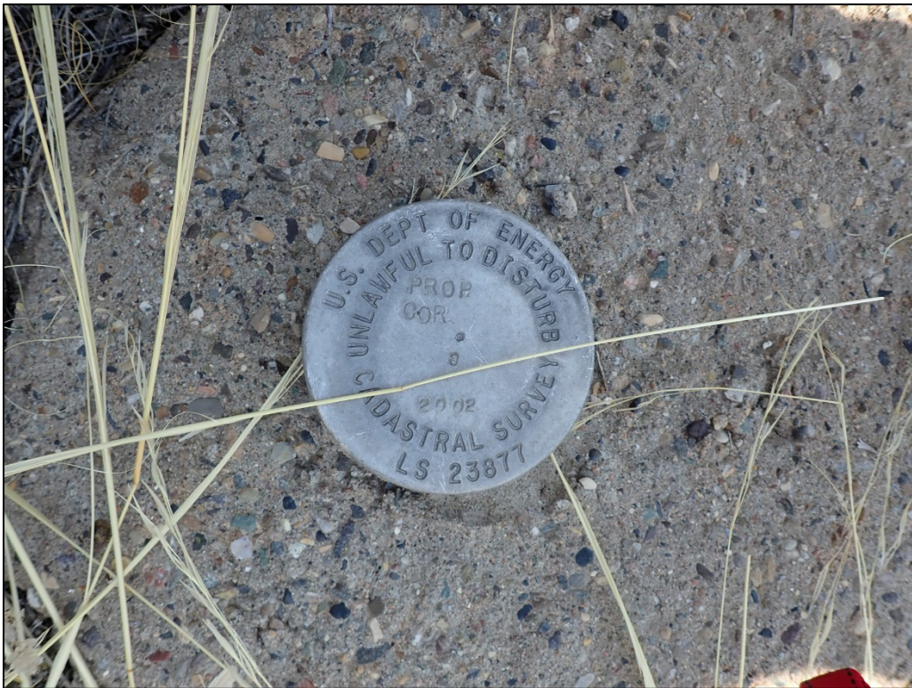
PL-6. Boundary Monument BM-8