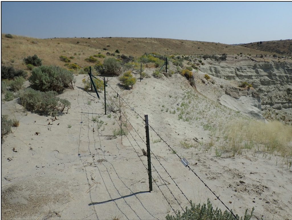
PL-14. Encroachment of Johnson Pit