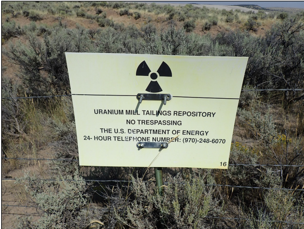
PL-3. Faded Perimeter Sign P16 to Be Replaced