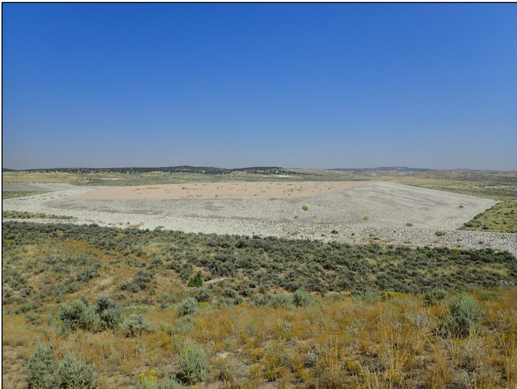
PL-8. Disposal Cell Overview