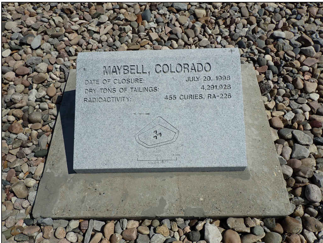
PL-4. Site Marker SMK-2 on Disposal Cell