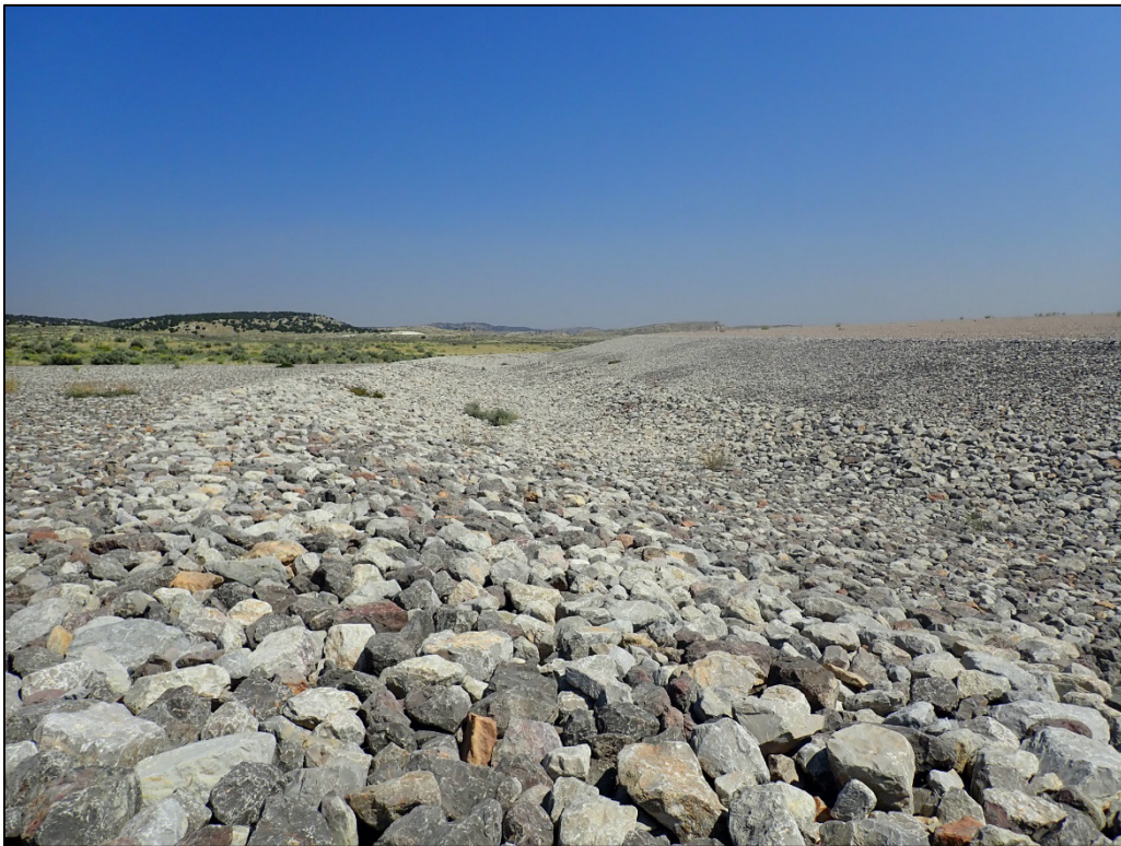
PL-10. Diversion Channel No. 1