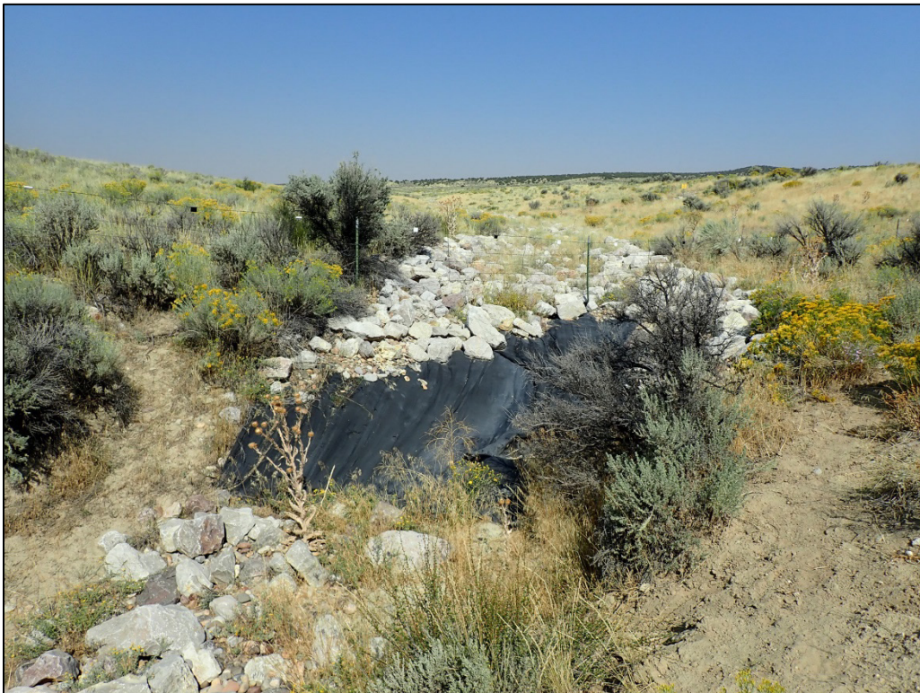
PL-12. Exposed Geofabric in Swale No. 1