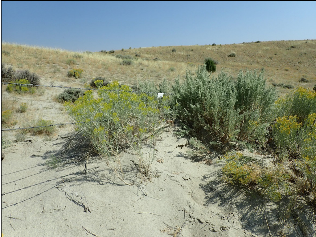
PL-15. Sand Buildup Along Fence near Johnson Pit