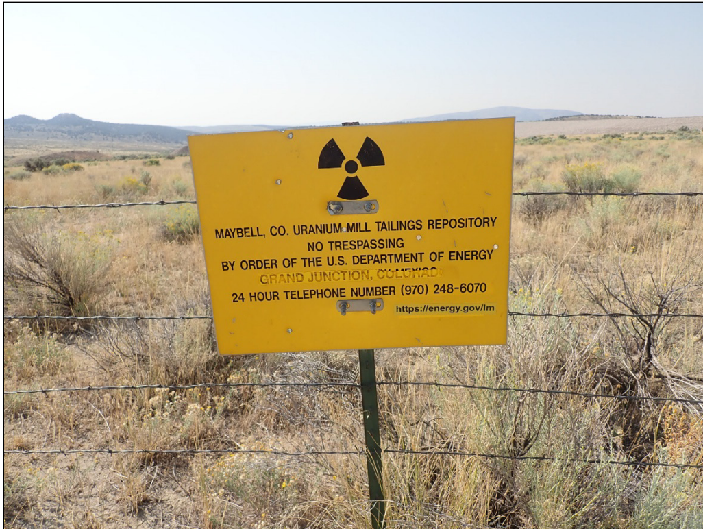
PL-1. Entrance Sign