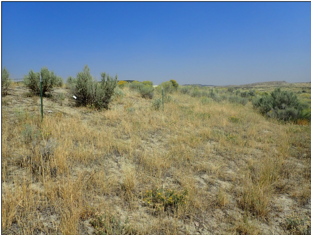
PL-2. Damaged Fence near Perimeter Sign P1