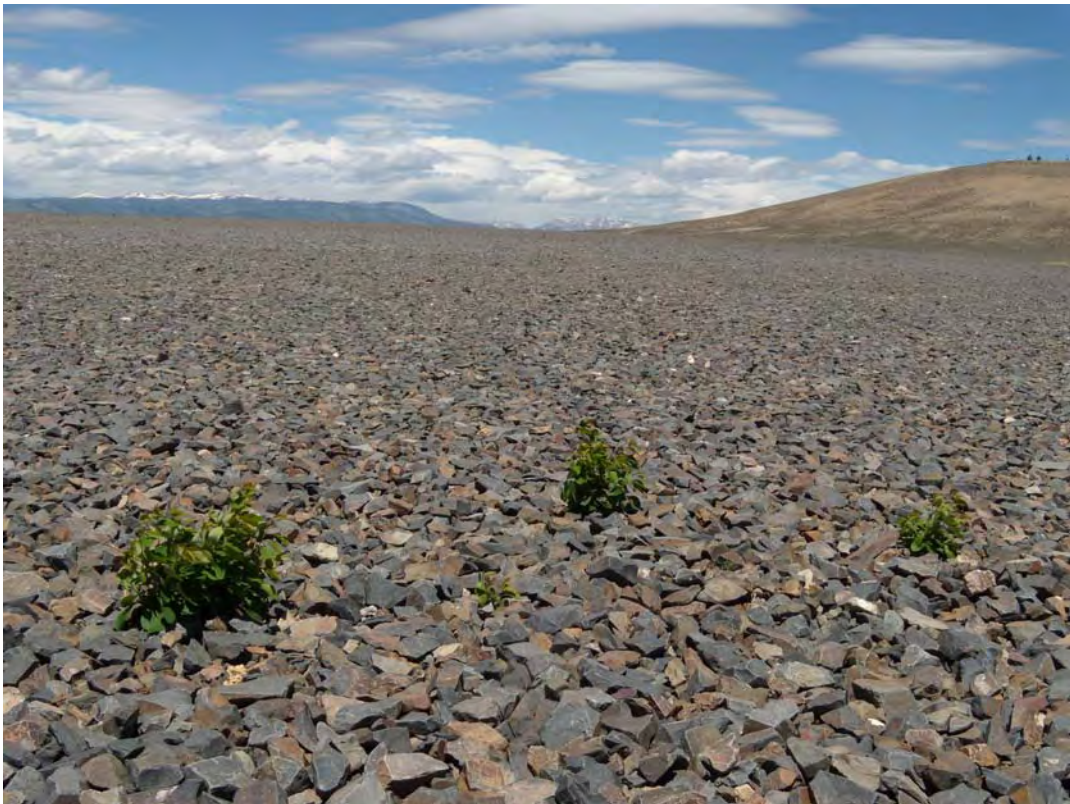
GUN 6/2010. PL-2. Cottonwood tree saplings prior to removal.