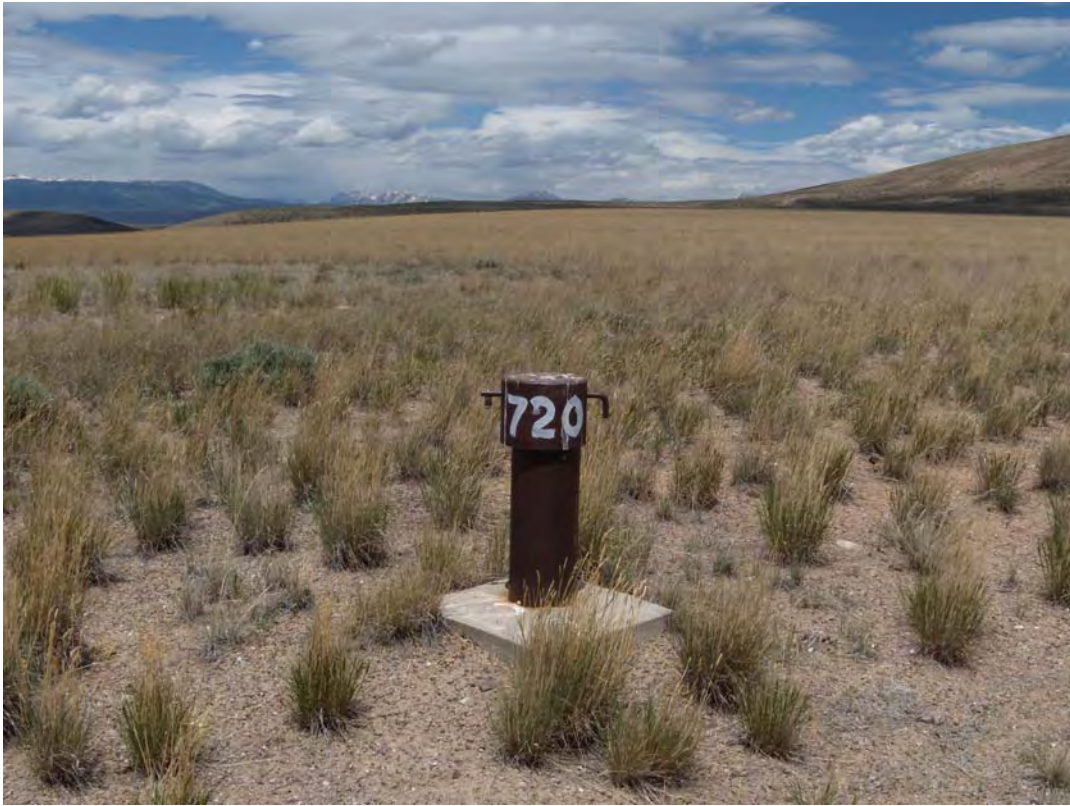
GUN 6/2010. PL-1. Monitoring well 0720.