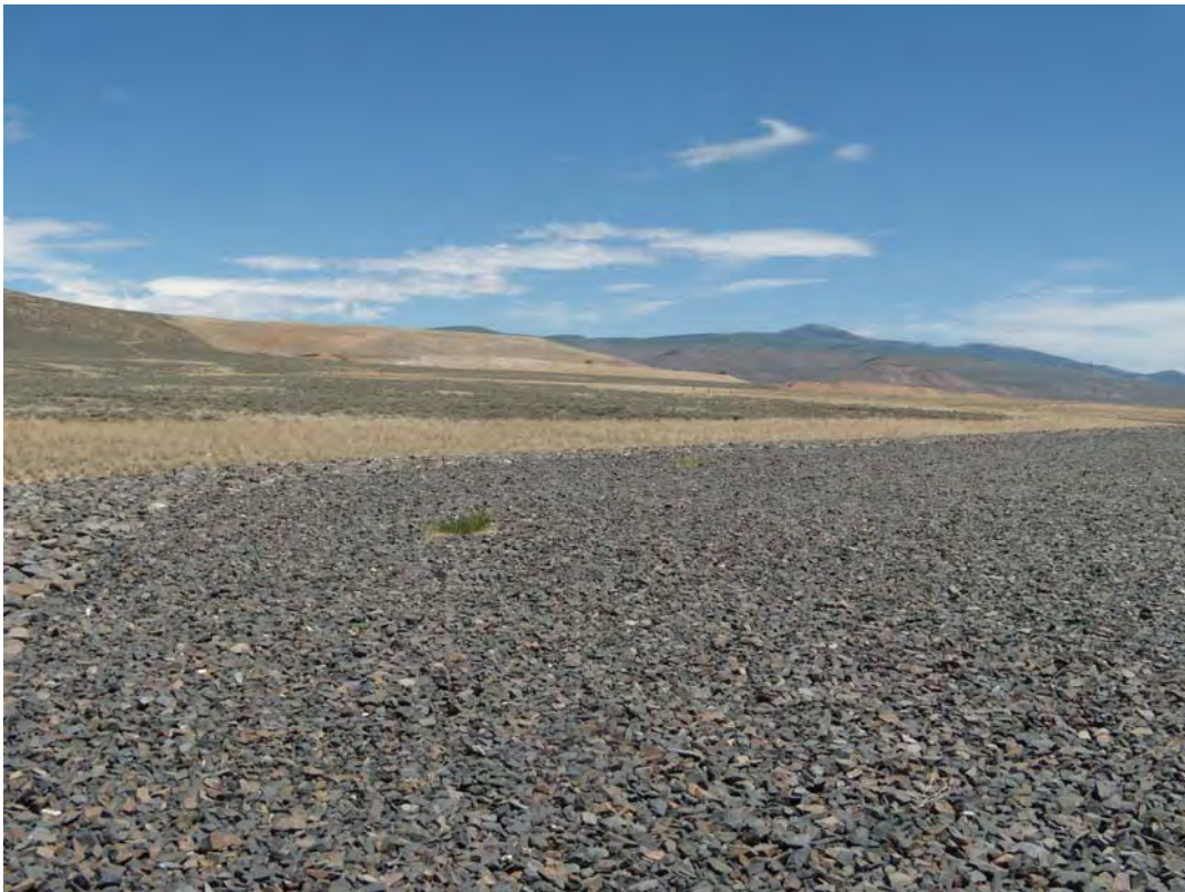
GUN 6/2010. PL-4. County landfill operations viewed from the disposal cell.