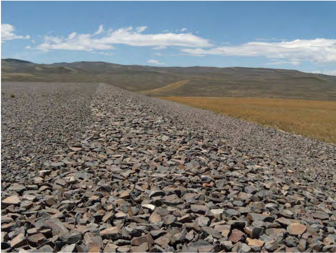
GUN 6/2010. PL-3. Northwest side slope of the disposal cell.