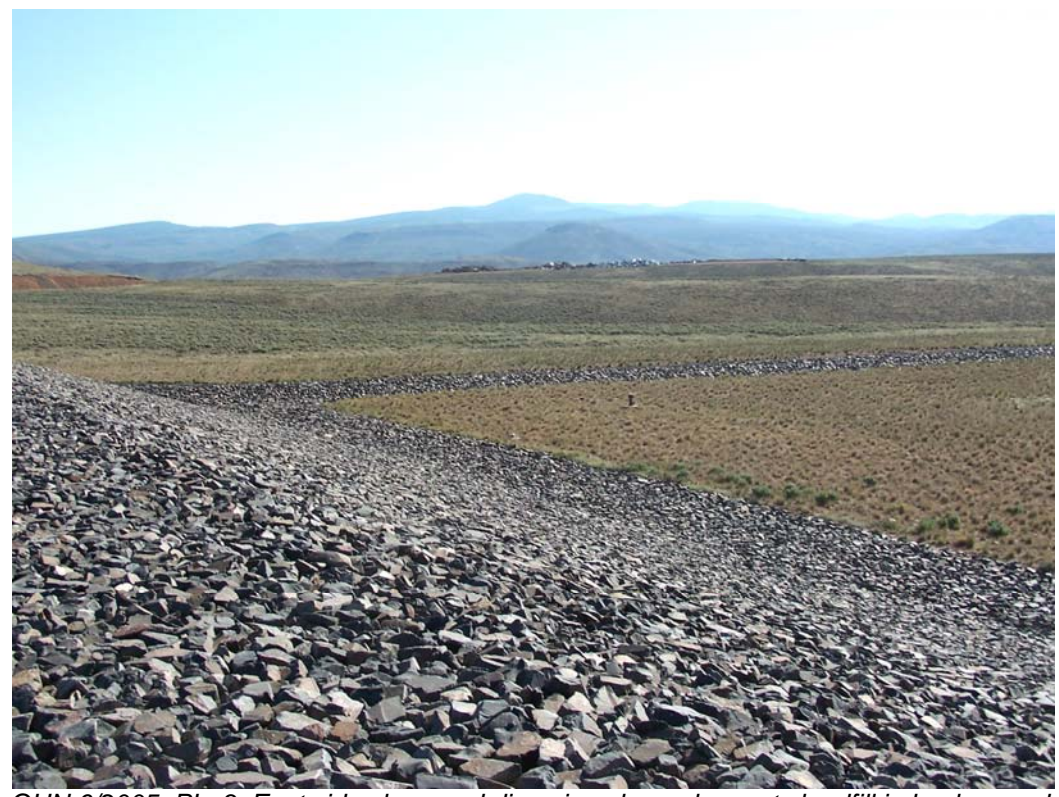
GUN 6/2005. PL-3. East side slope and diversion channel, county landfill in background.