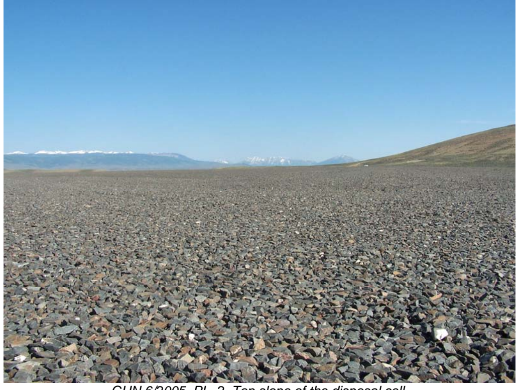
GUN 6/2005. PL-2. Top slope of the disposal cell.