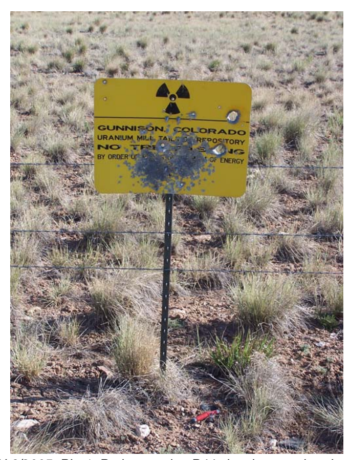
GUN 6/2005. PL-1. Perimeter sign P44 showing gunshot damage.