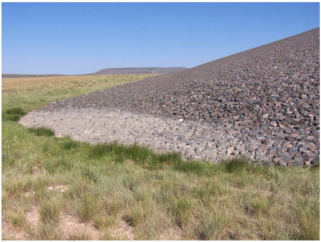
GUN 6/2005. PL-4. Southeast toe of the cell showing high water mark from ponded water.