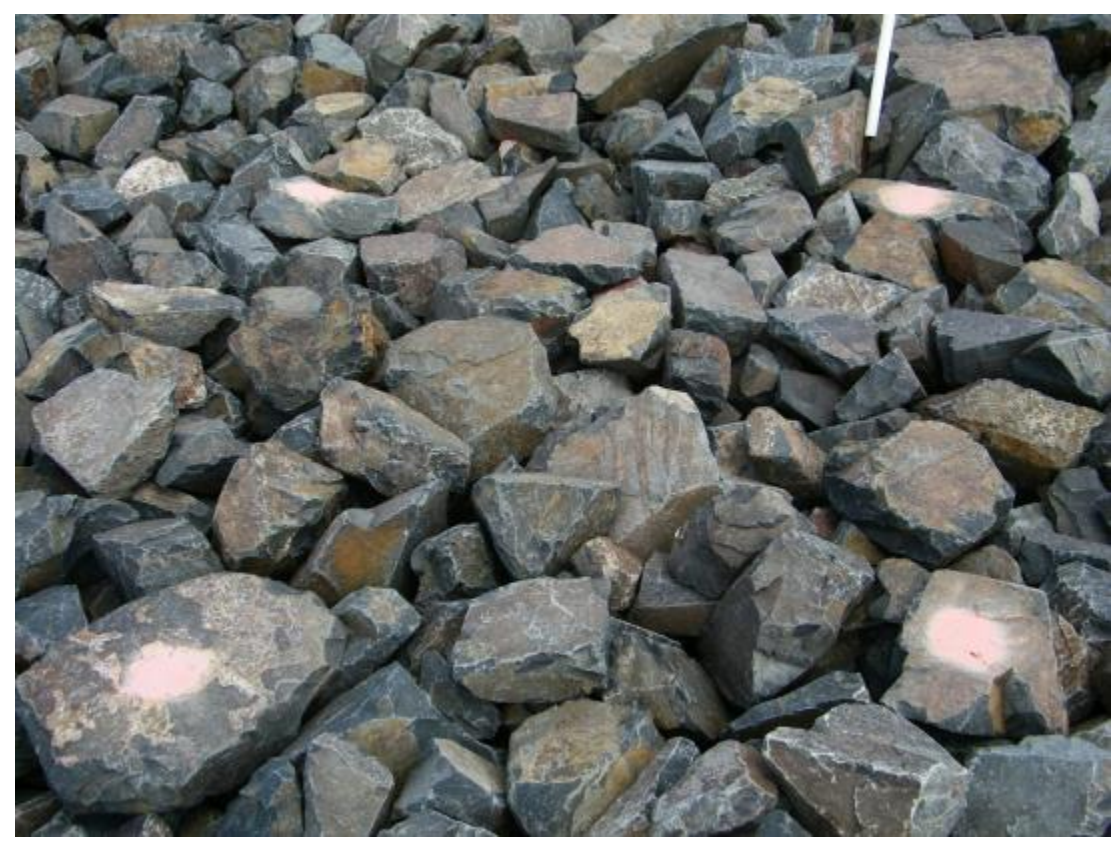
GUD 6/2012. PL-11. Riprap Test Area No. 5 (Type D riprap) at the east diversion channel outlet (June 4, 2012).