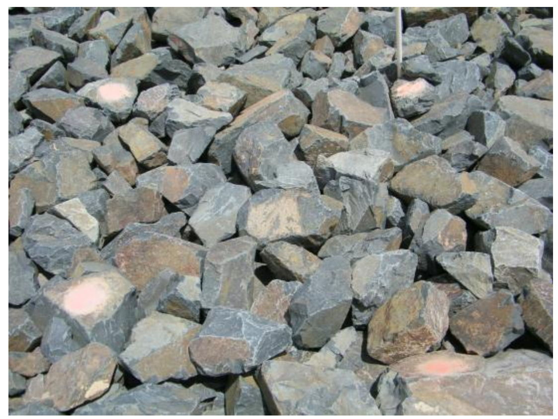
GUD 6/2012. PL-10. Riprap Test Area No. 4 (Type C riprap) in the east diversion channel (June 4, 2012).