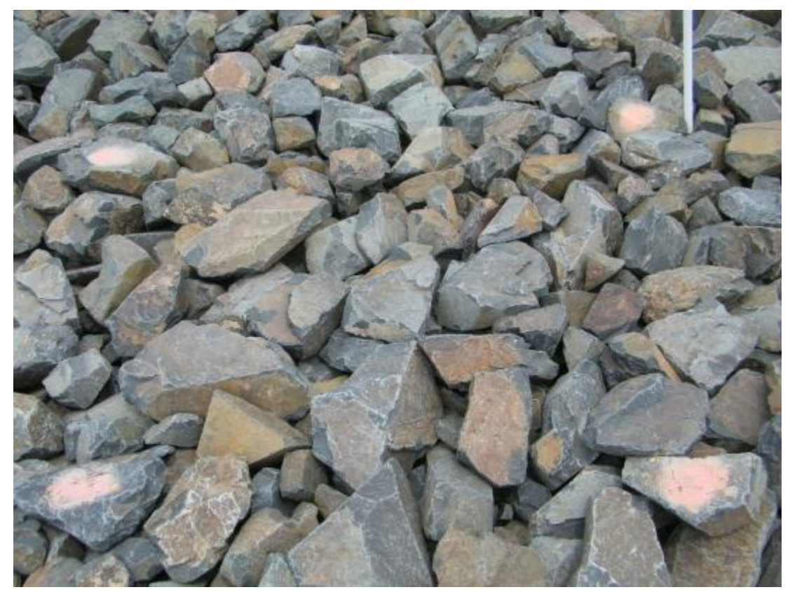
GUD 6/2012. PL-12. Riprap Test Area No. 6 (Type D riprap) at the west diversion channel outlet (June 4, 2012).