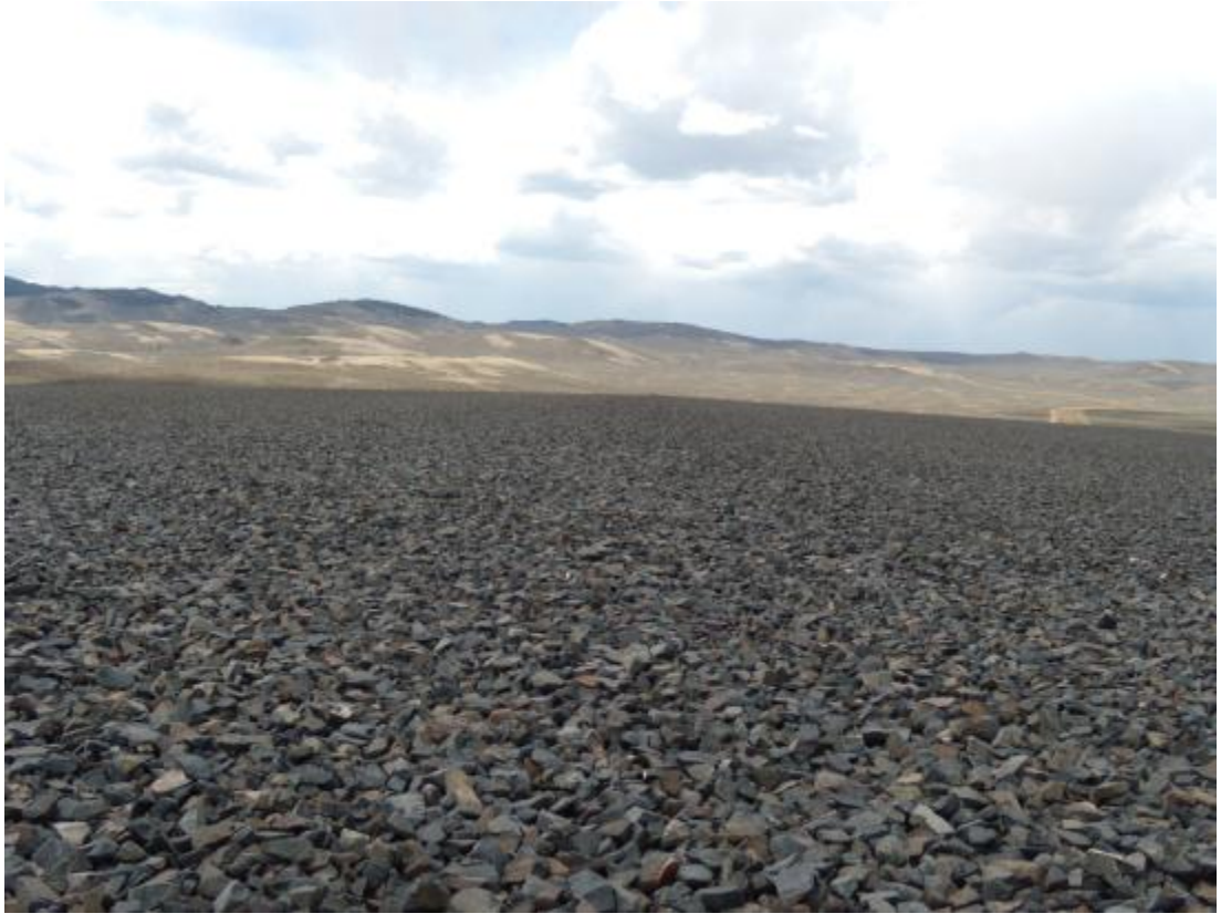
GUD 6/2012. PL-4. View southwest across the top of the disposal cell.