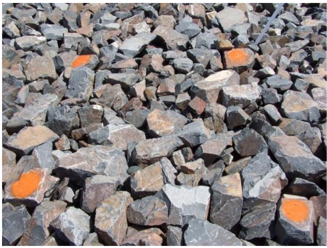
GUN 5/2007. PL-9A. Riprap Test Area No. 3 (Type B riprap) on the cell's northwest apron (May 21, 2007).