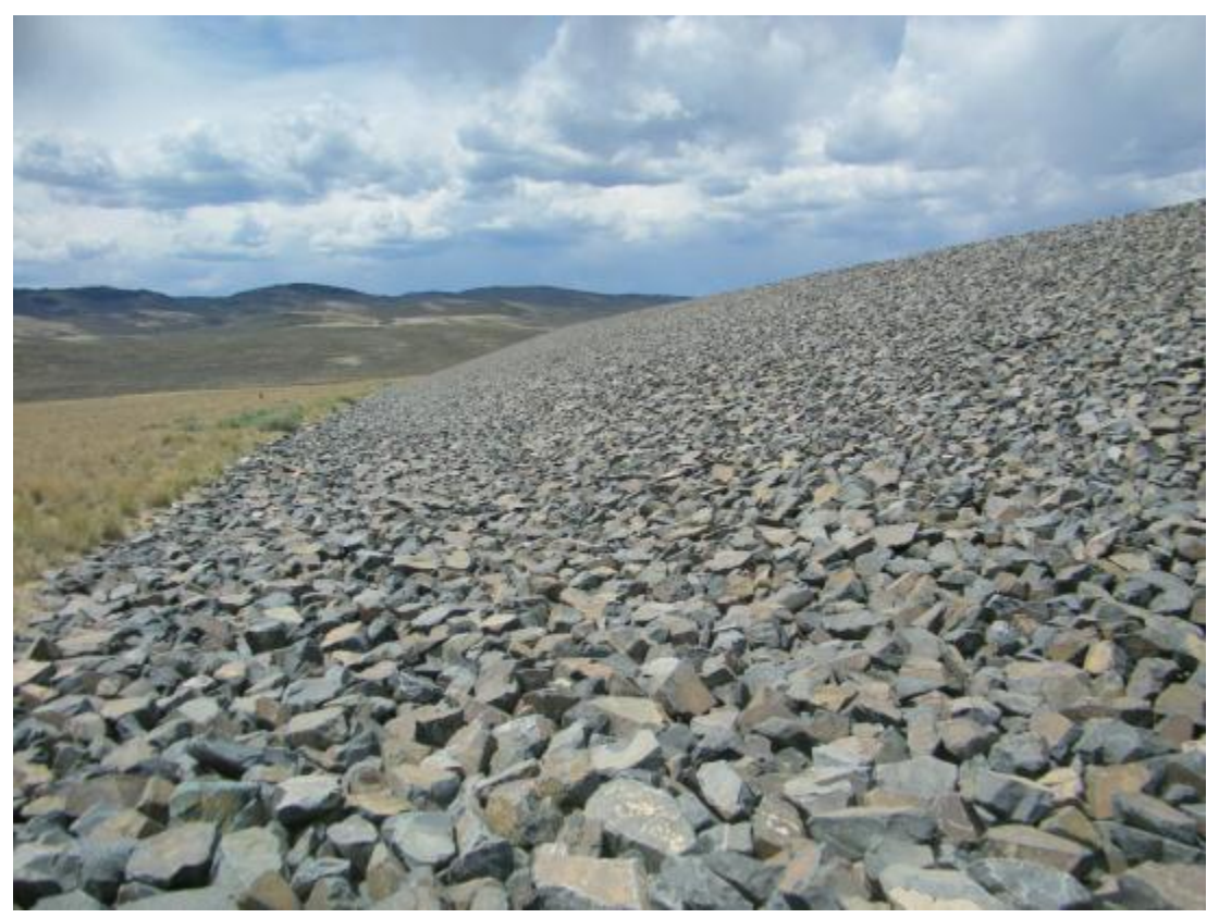
GUD 6/2012. PL-5. East side slope and riprap apron of the disposal cell.