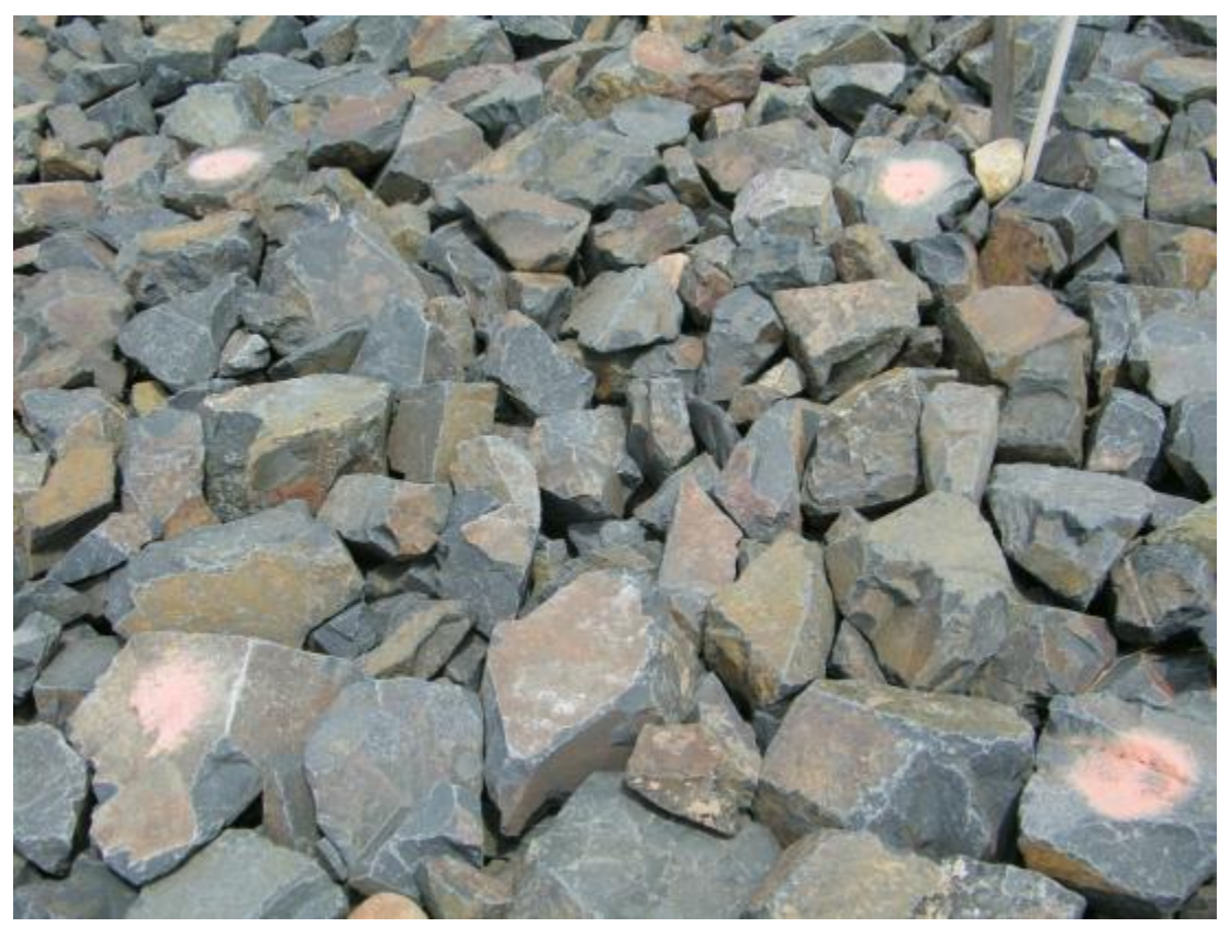
GUD 6/2012. PL-8. Riprap Test Area No. 2 (Type B riprap) on the cell's south apron (June 4, 2012).