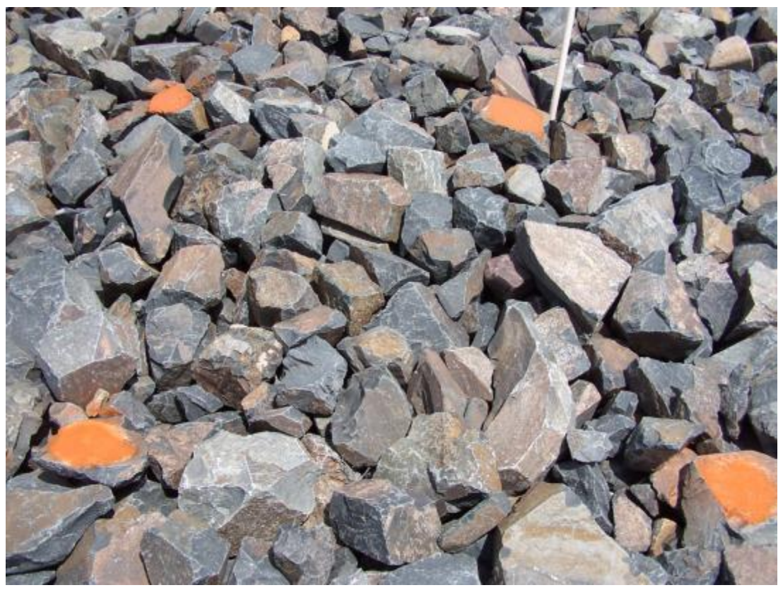
GUN 5/2007. PL-7A. Riprap Test Area No. 1 (Type B riprap) on the cell's east apron (May 21, 2007).