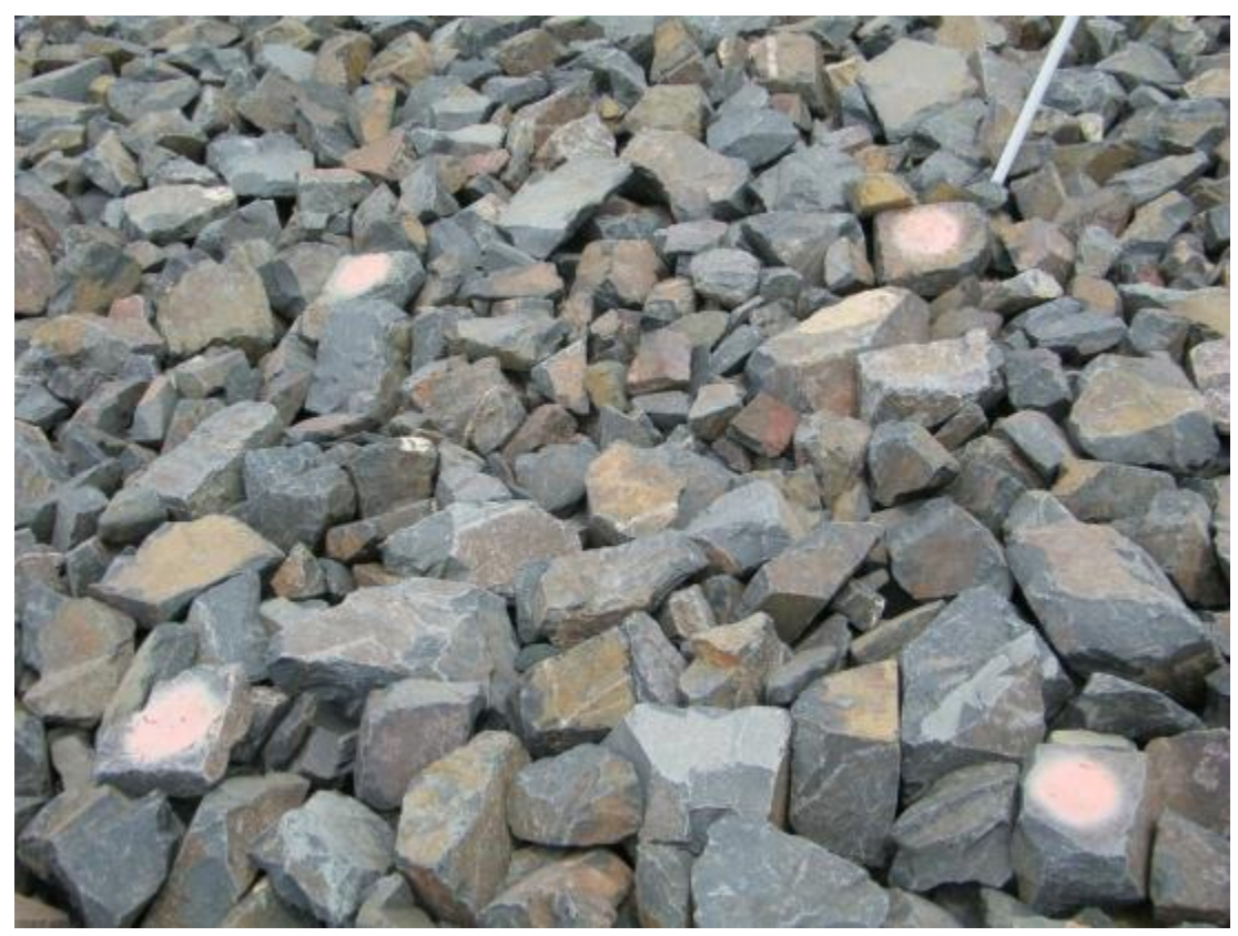
GUD 6/2012. PL-9. Riprap Test Area No. 3 (Type B riprap) on the cell's northwest apron (June 4, 2012).