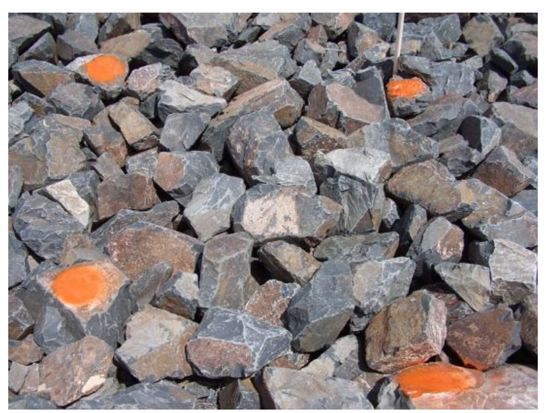
GUN 5/2007. PL-10A. Riprap Test Area No. 4 (Type C riprap) in the east diversion channel (May 21, 2007).