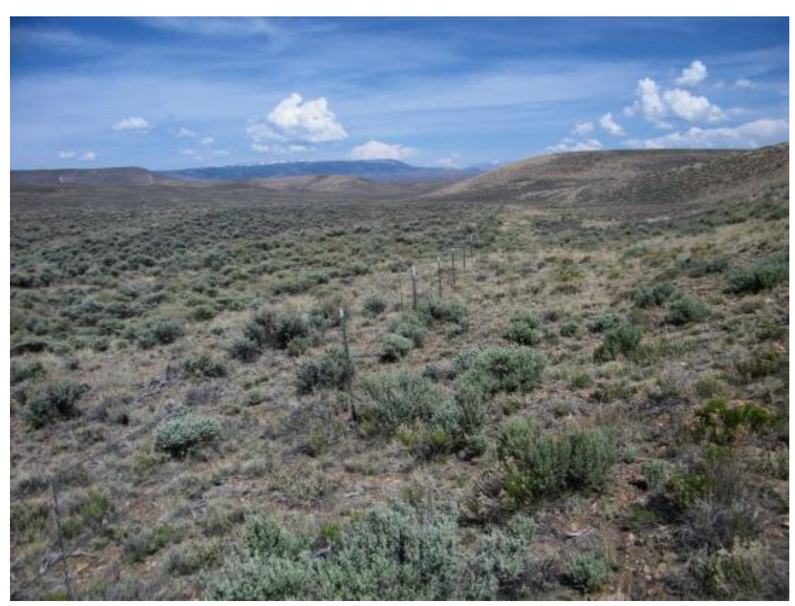
GUD 6/2012. PL-1. Perimeter fence along the west side of the site.