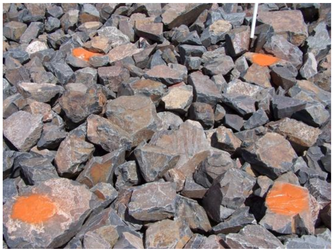
GUN 5/2007. PL-11A. Riprap Test Area No. 5 (Type D riprap) at the east diversion channel outlet (May 21, 2007).