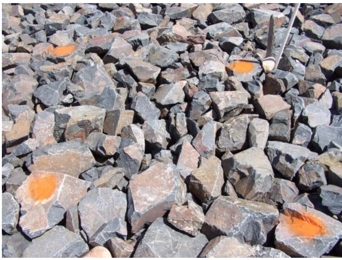
GUN 5/2007. PL-8A. Riprap Test Area No. 2 (Type B riprap) on the cell's south apron (May 21, 2007).