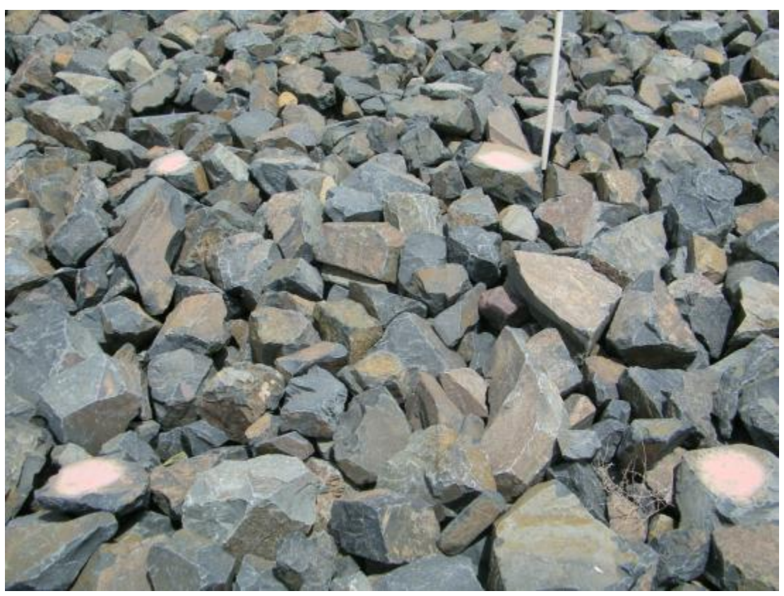
GUD 6/2012. PL-7. Riprap Test Area No. 1 (Type B riprap) on the cell's east apron (June 4, 2012).