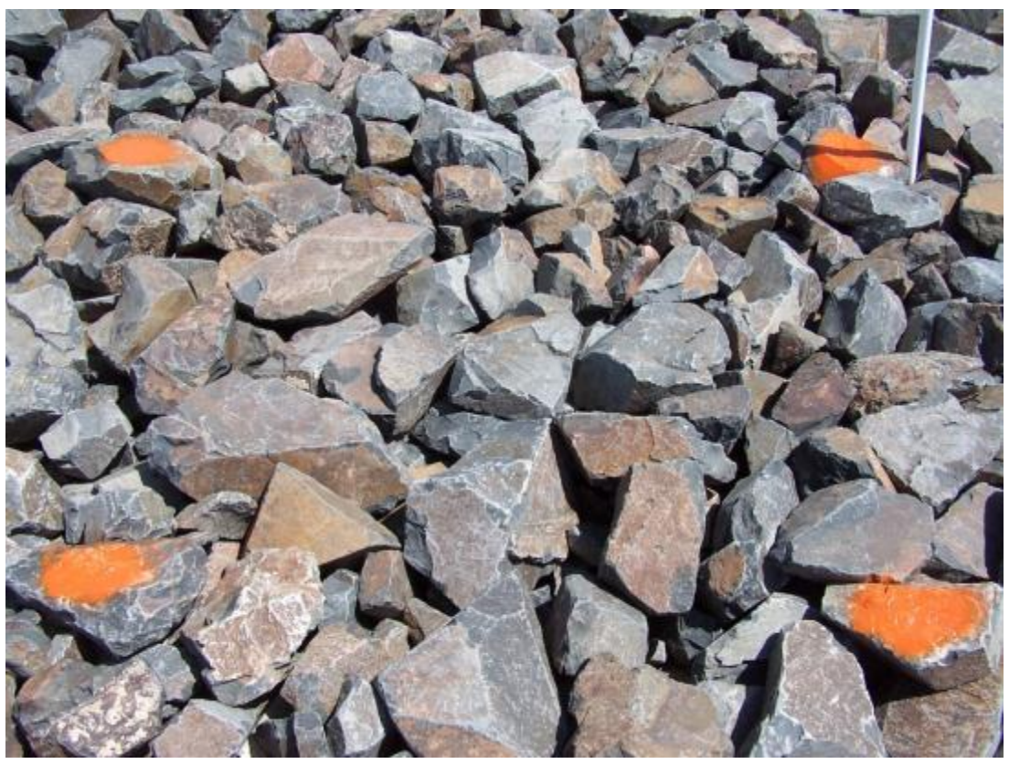
GUN 5/2007. PL-12A. Riprap Test Area No. 6 (Type D riprap) at the west diversion channel outlet (May 21, 2007).