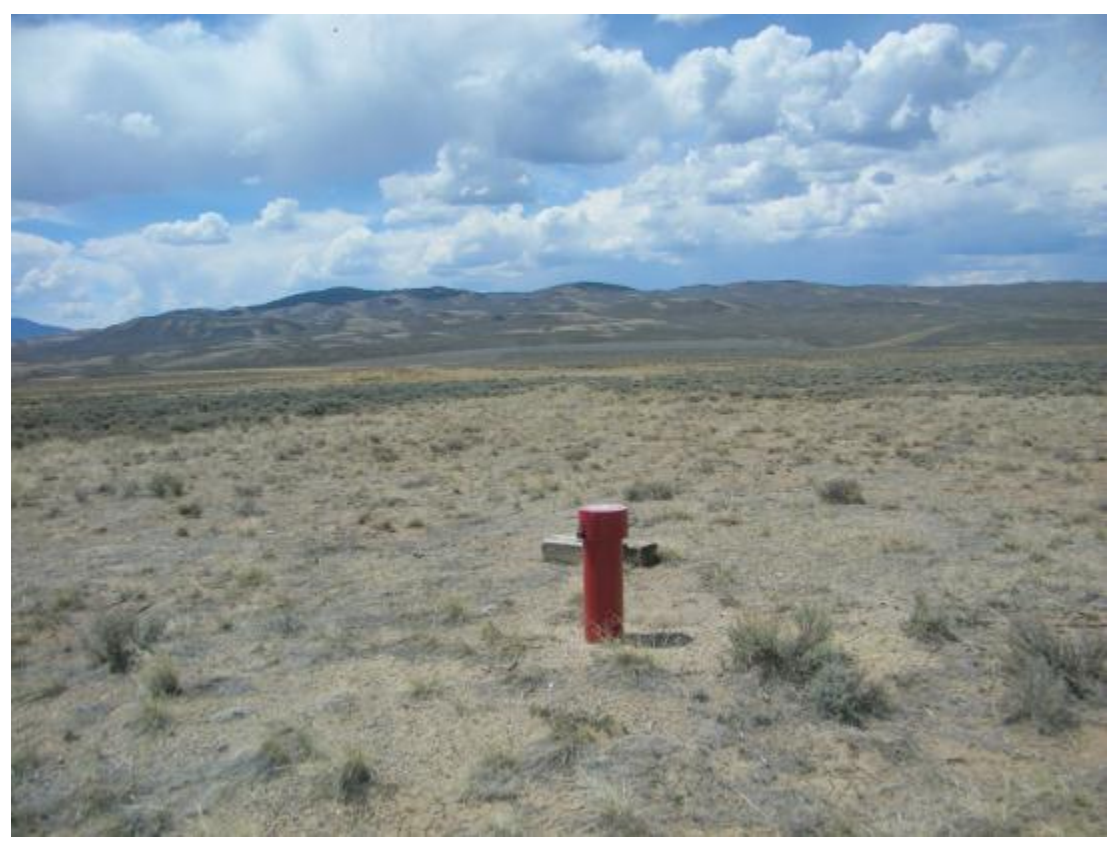
GUD 6/2012. PL-3. Monitoring well 0716 north of the disposal site.