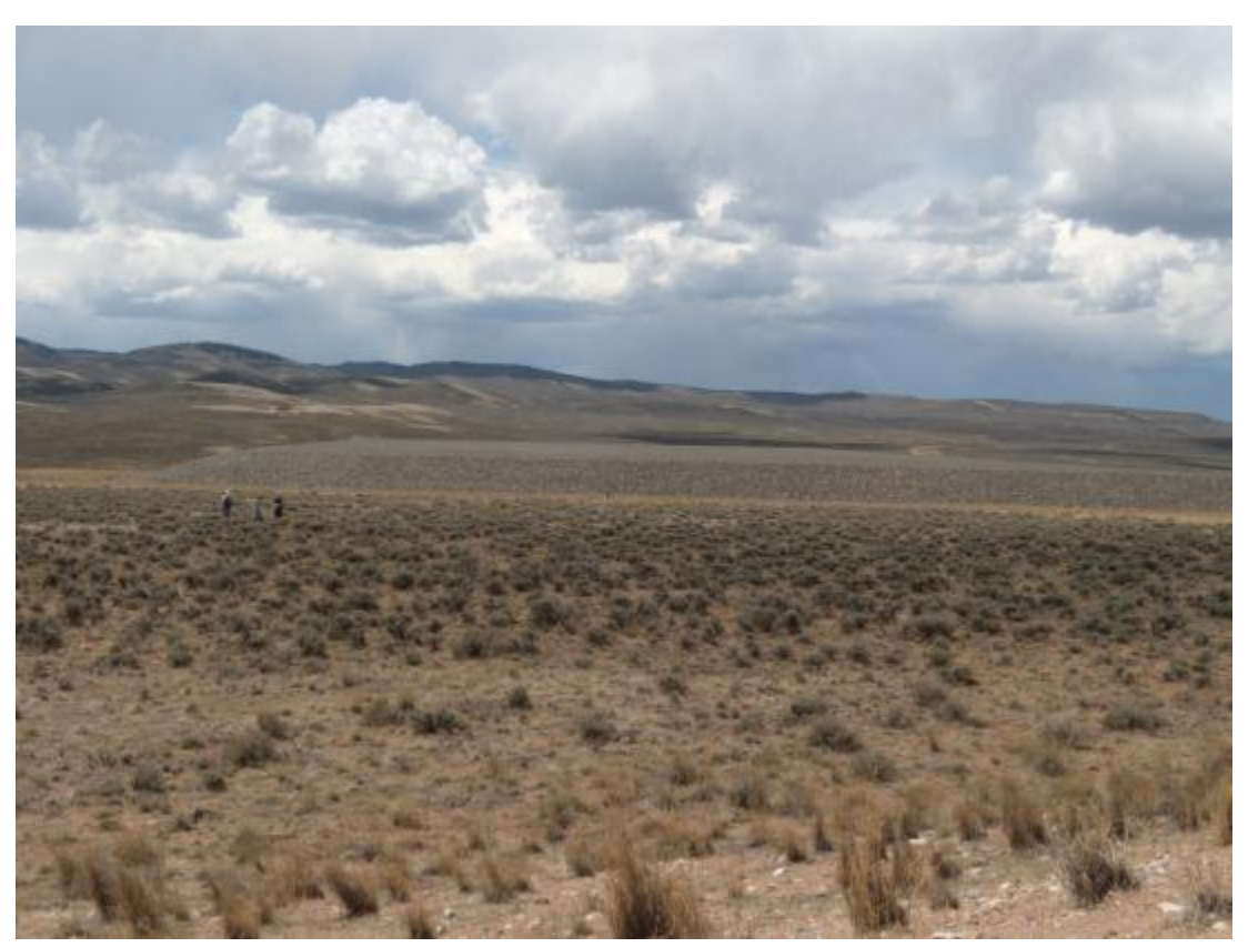
GUD 6/2012. PL-13. Reclaimed and undisturbed areas north of the disposal cell.