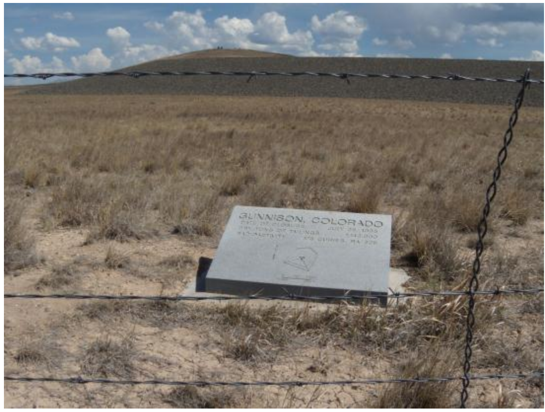
GUD 6/2012. PL-2. Site marker SMK-1 at the site entrance.