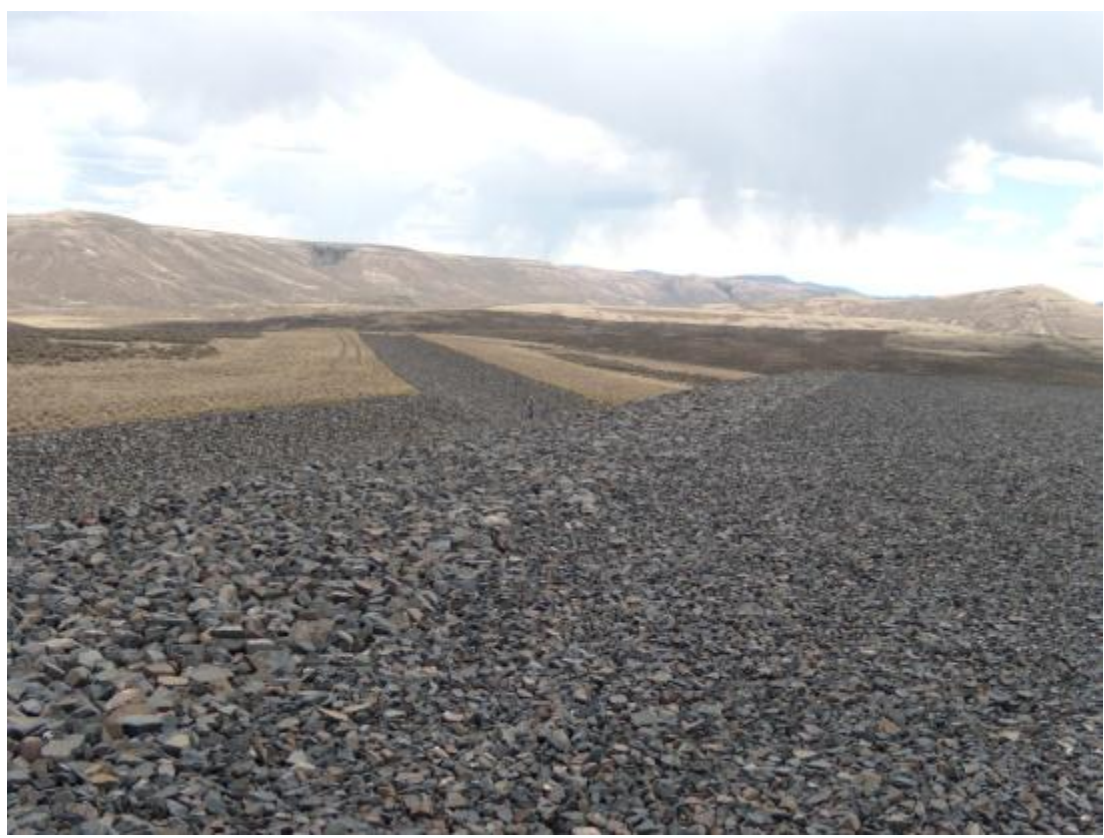
GUD 6/2012. PL-6. Northeast corner of the disposal cell and the east diversion channel.