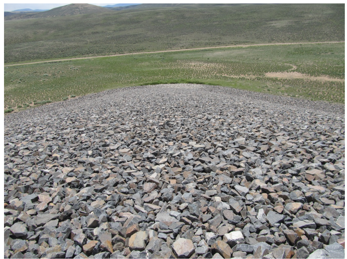
GUD 6/2013. PL-11. Southeast corner of the disposal cell (no runoff water accumulation).