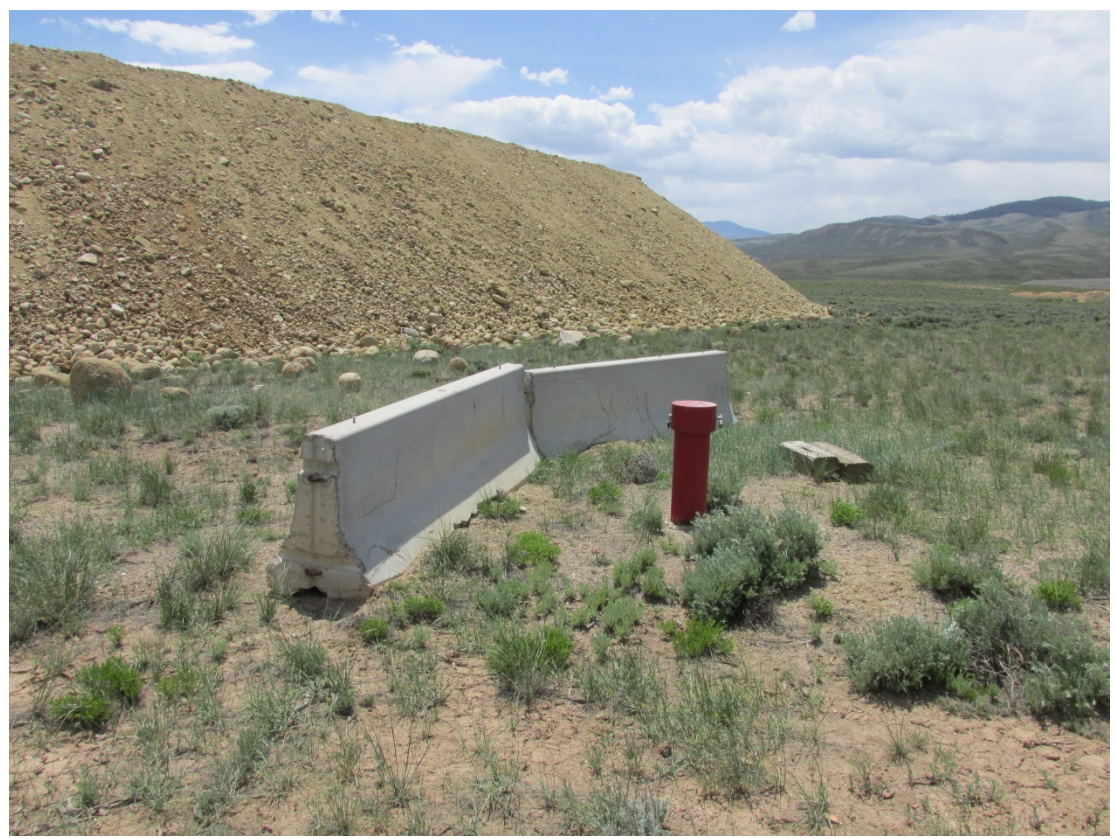
GUD 6/2013. PL-6. Monitoring well 0716 protected by concrete barriers.