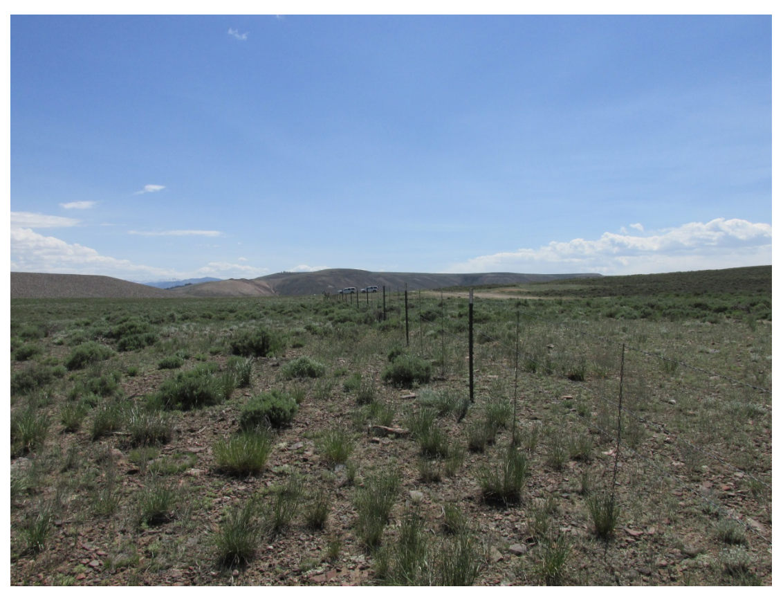
GUD 6/2013. PL-2. Site perimeter fence looking east from boundary monument BM-8.