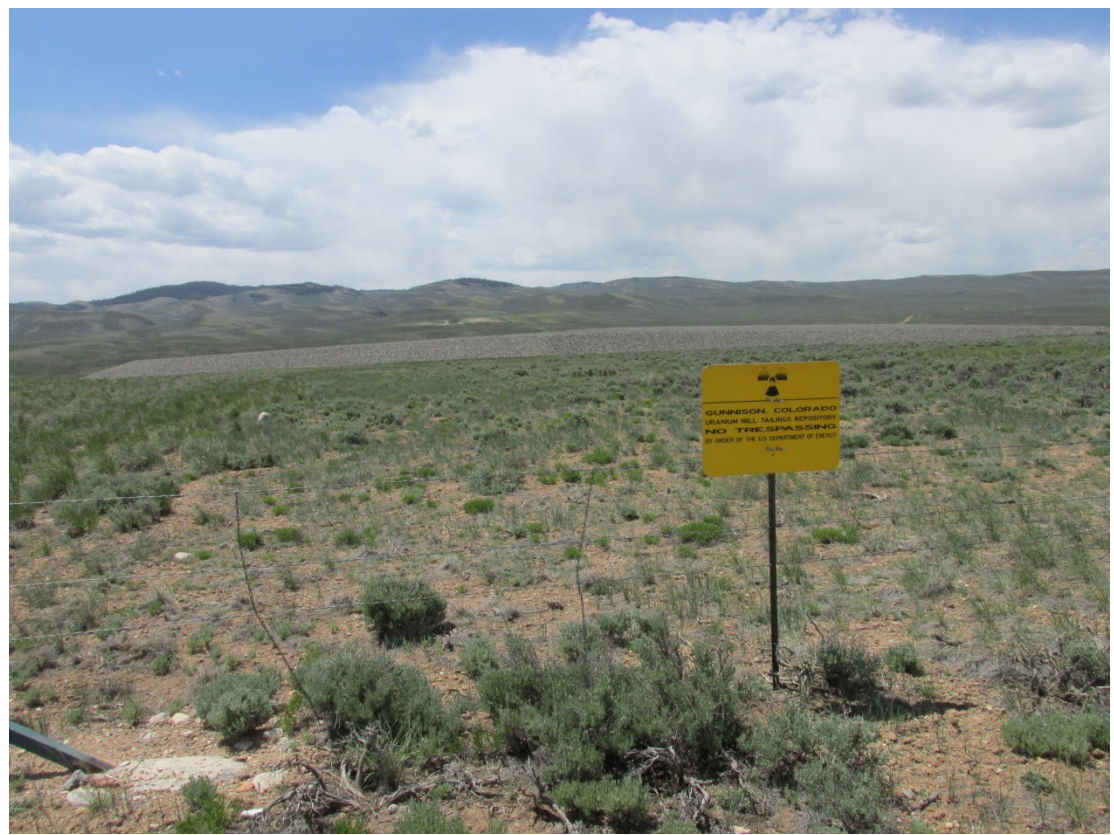
GUD 6/2013. PL-3. Perimeter sign P22 and the disposal cell.