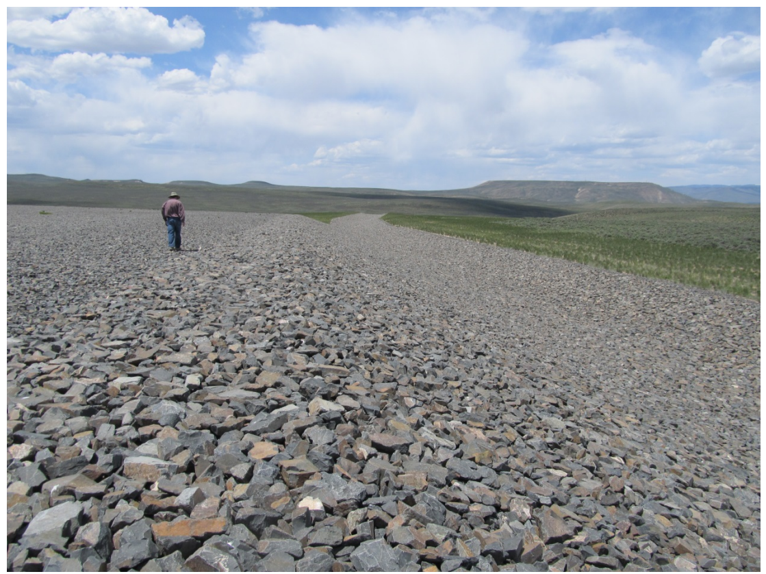
GUD 6/2013. PL-8. Northwest side of the disposal cell and the west diversion channel.