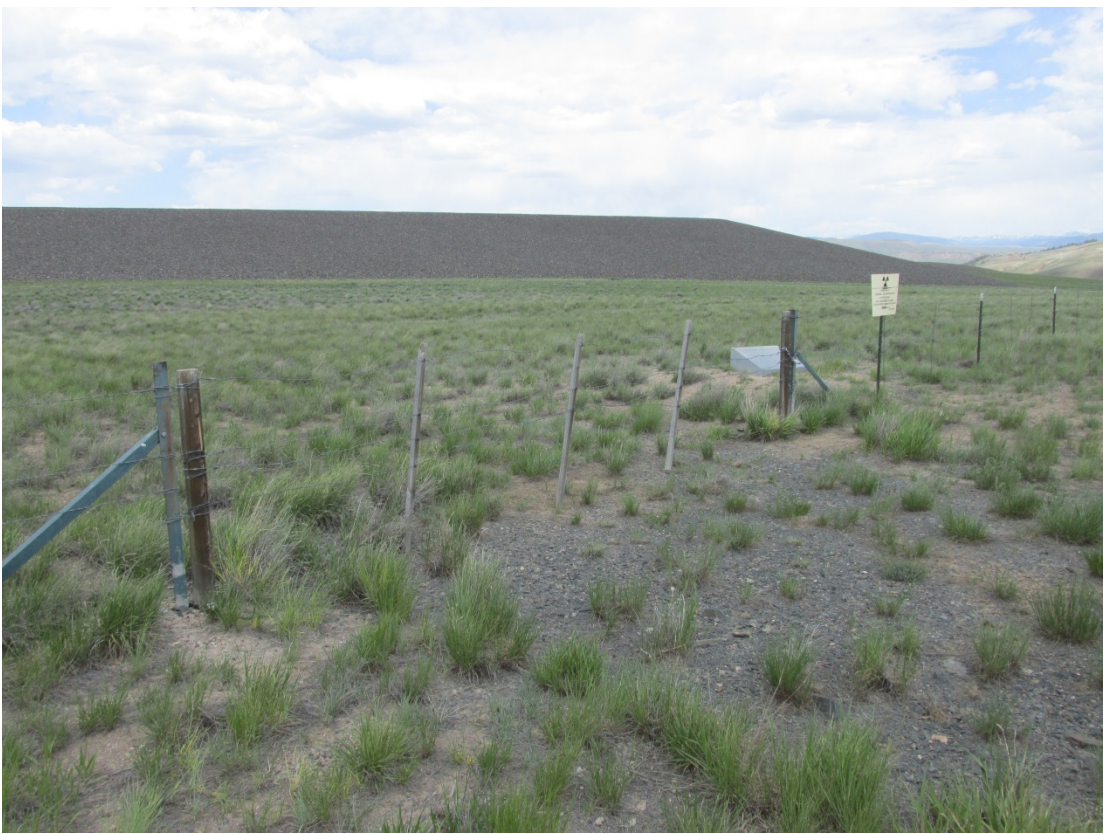
GUD 6/2013. PL-1. Site entrance gate.