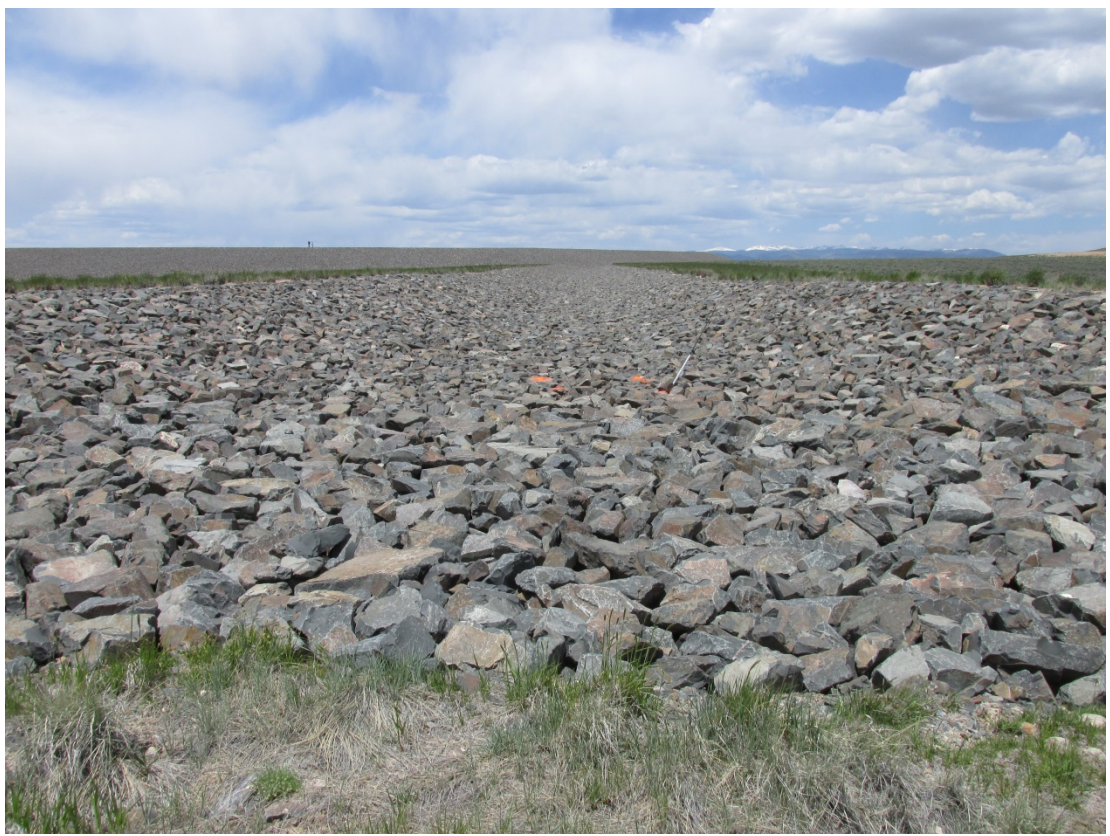
GUD 6/2013. PL-9. View upgradient of the east diversion channel.