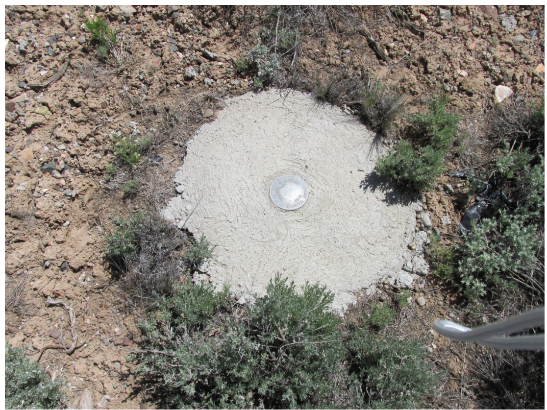
GUD 6/2013. PL-5. Boundary monument BM-5.