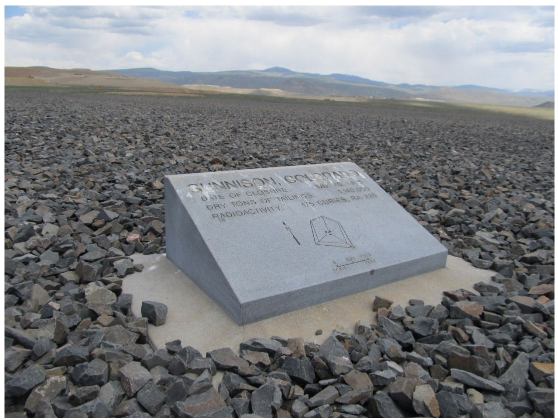
GUD 6/2013. PL-4. Site marker SMK-2 on top of the disposal cell.