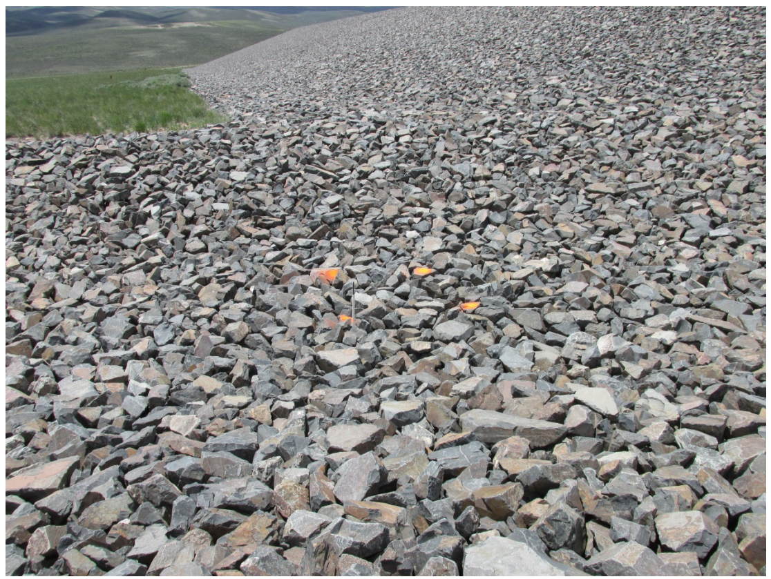
GUD 6/2013. PL-10. Riprap test area No. 4 in the east diversion channel.