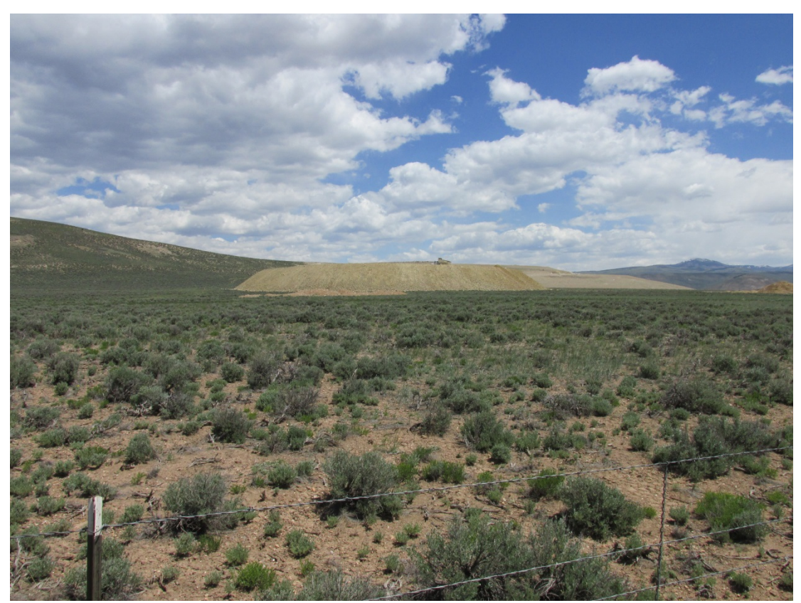
GUD 6/2013. PL-12. New spoil pile at the Gunnison County landfill.