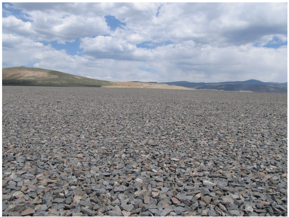
GUD 6/2013. PL-7. Top of the disposal cell and the Gunnison County landfill in the background.