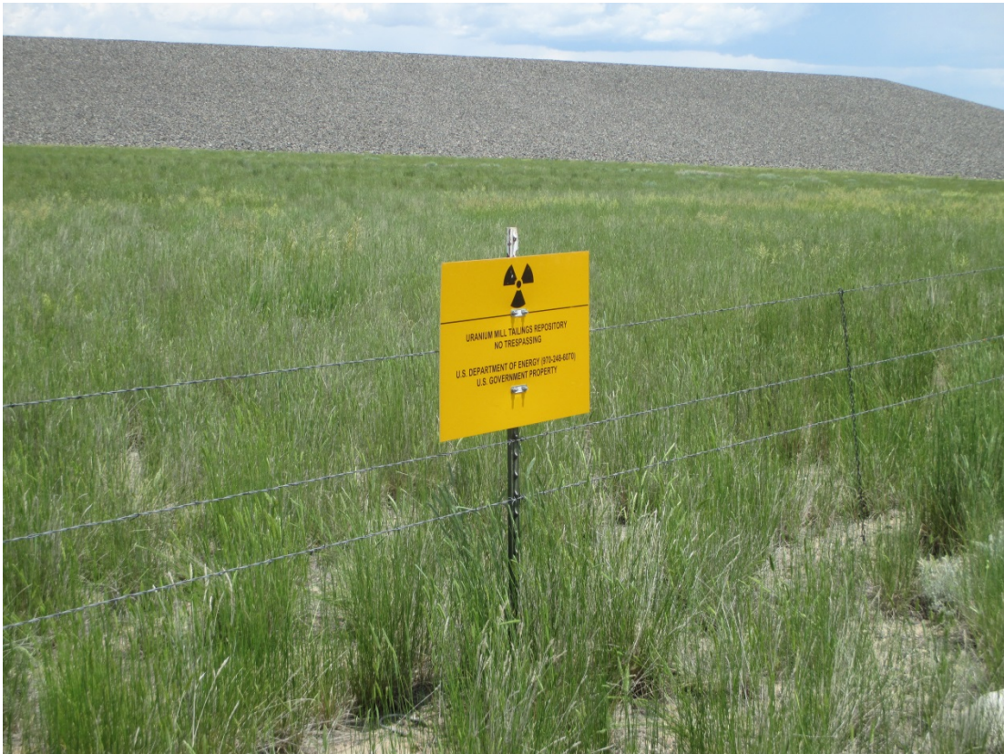
GUD 6/2015. PL-2. Perimeter sign P1.