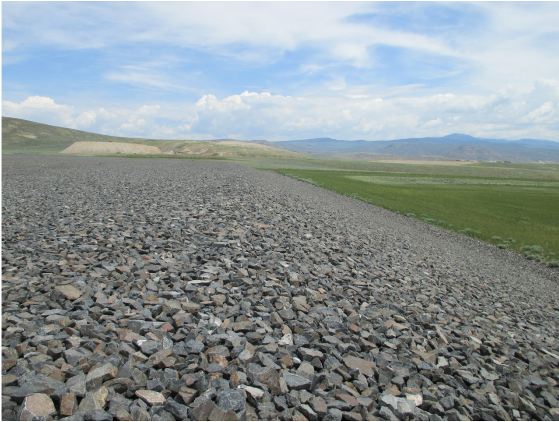
GUD 6/2015. PL-7. Side slope near the southeast side of disposal cell.