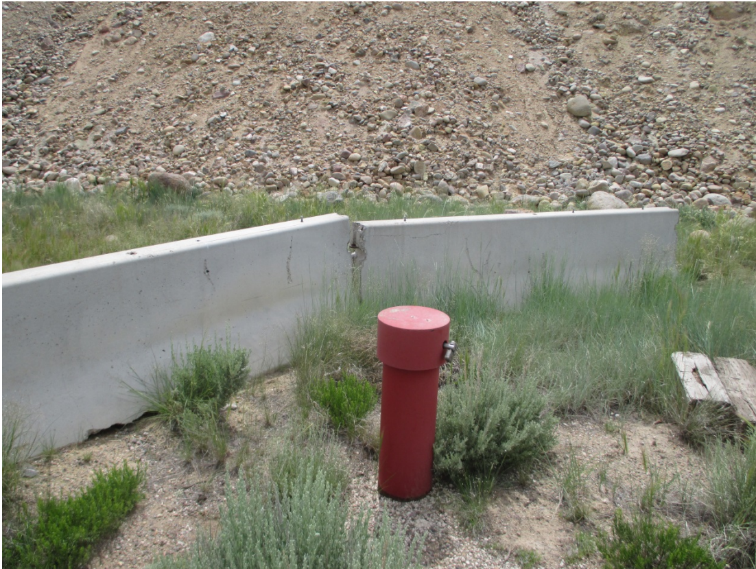
GUD 6/2015. PL-5. Monitoring well 0716 protected by jersey barriers.