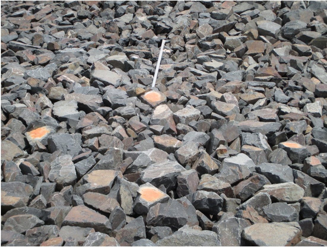
GUD 6/2015. PL-9. Riprap test area No. 3.