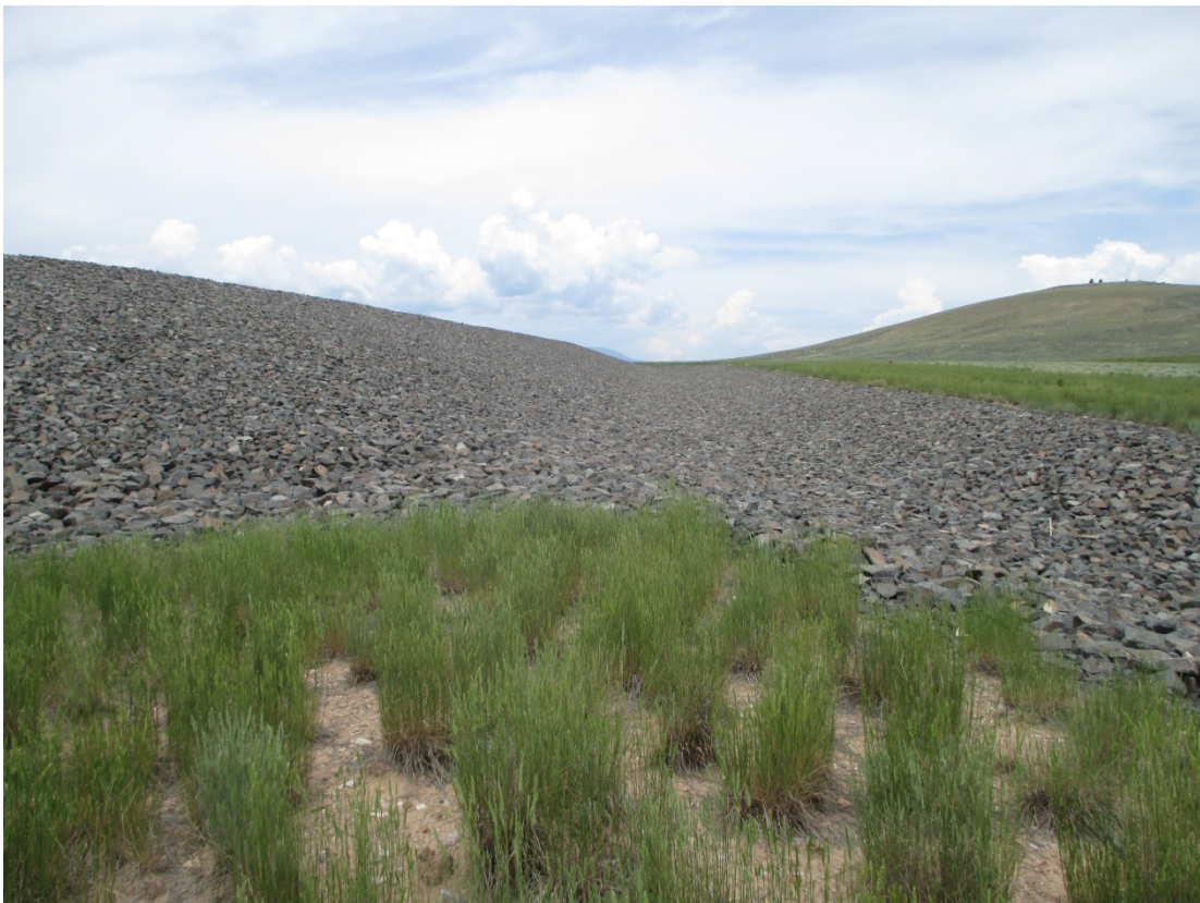
GUD 6/2015. PL-8. Diversion channel along the northeast side of disposal cell.