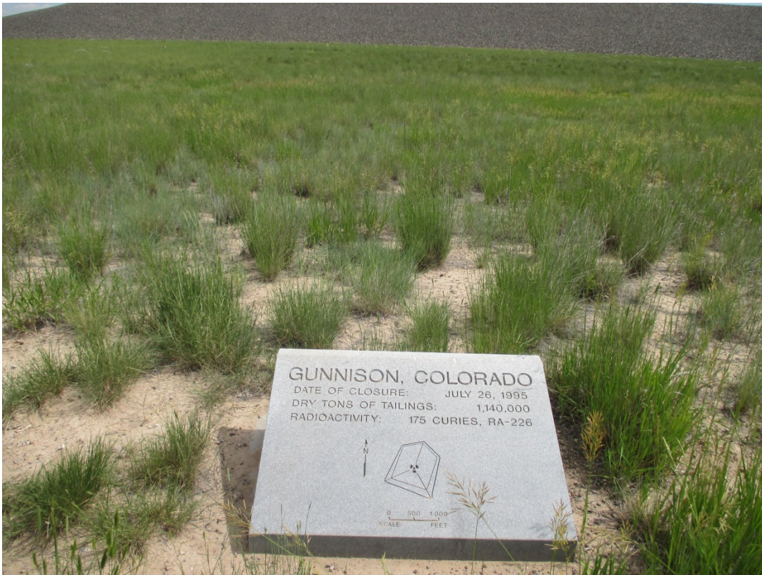
GUD 6/2015. PL-3. Site marker SMK-1.