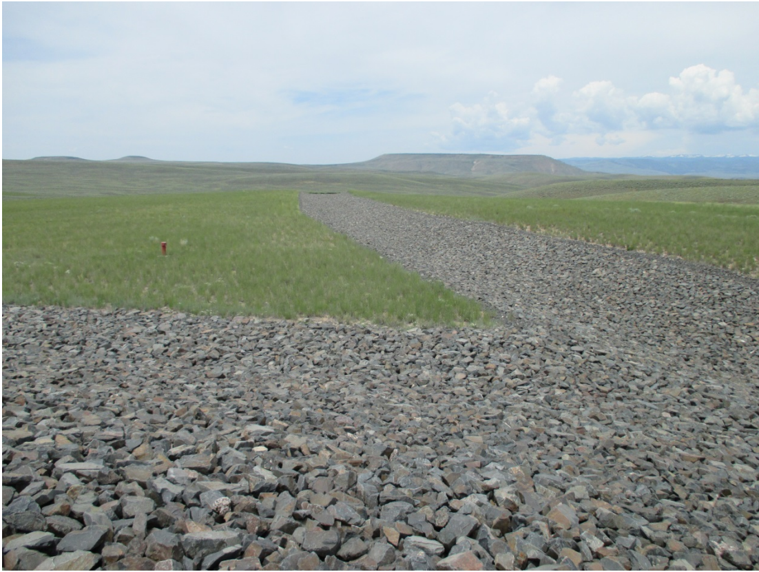
GUD 6/2015. PL-11. Revegetated area near the northwestern side of disposal cell.