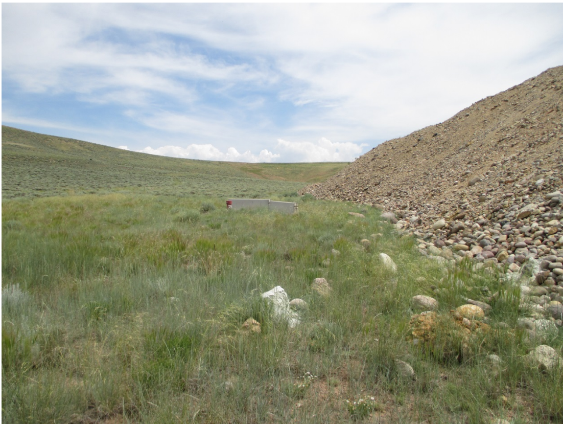
GUD 6/2015. PL-6. Monitoring well 0716 near west edge of landfill cover material spoil pile.