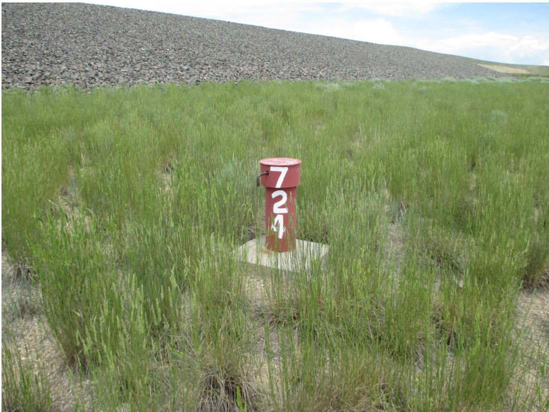
GUD 6/2015. PL-4. Monitoring well 0724 near east side of disposal cell.