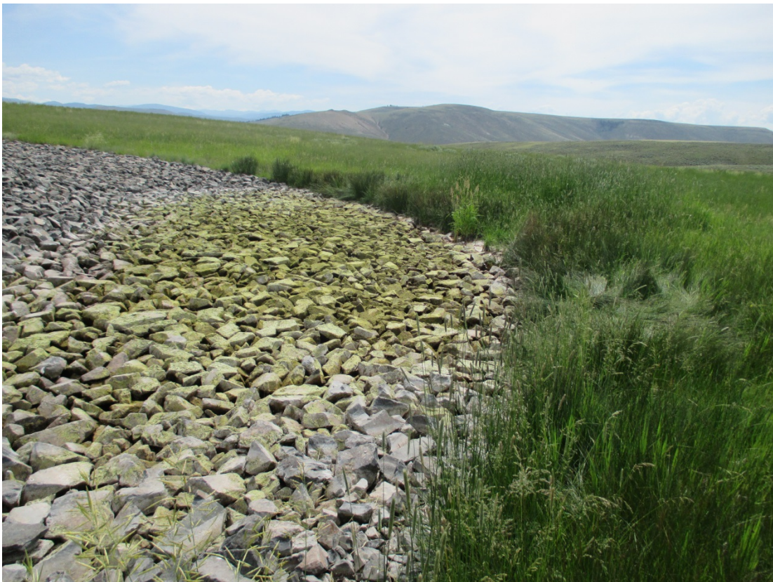
GUD 6/2015. PL-10. Standing water and moss coverage along the southeast side of disposal cell apron.