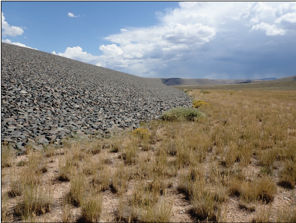
PL-6. South Riprap Apron