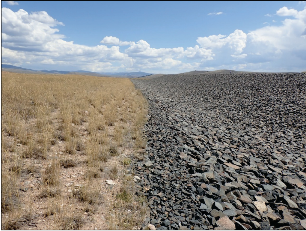
PL-7. West Diversion Channel