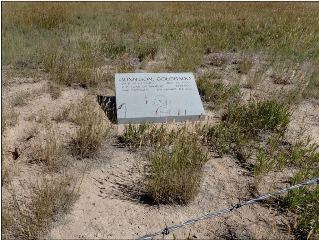
PL-2. Site Marker SMK-1