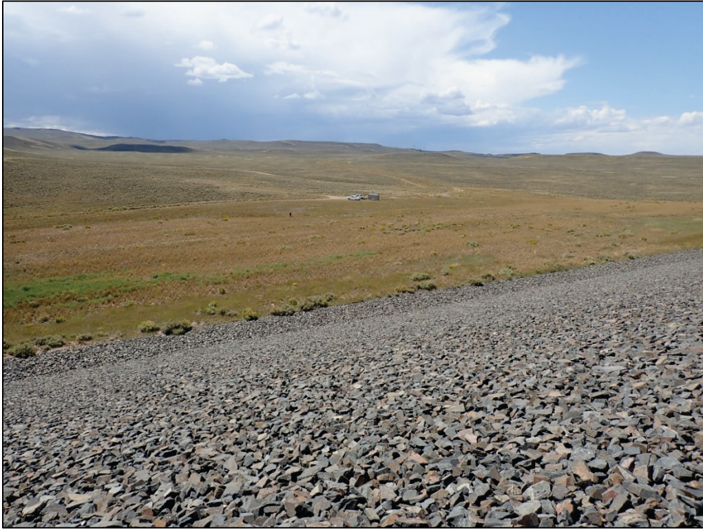
PL-9. Reclaimed Area Along South Fence Line