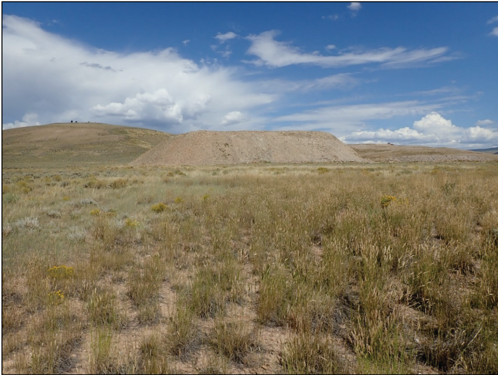
PL-4. Gunnison County Landfill Operations