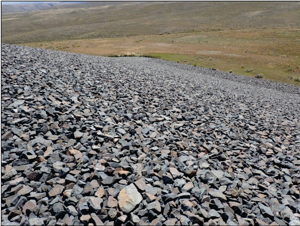
PL-8. Southeast Corner of Disposal Cell