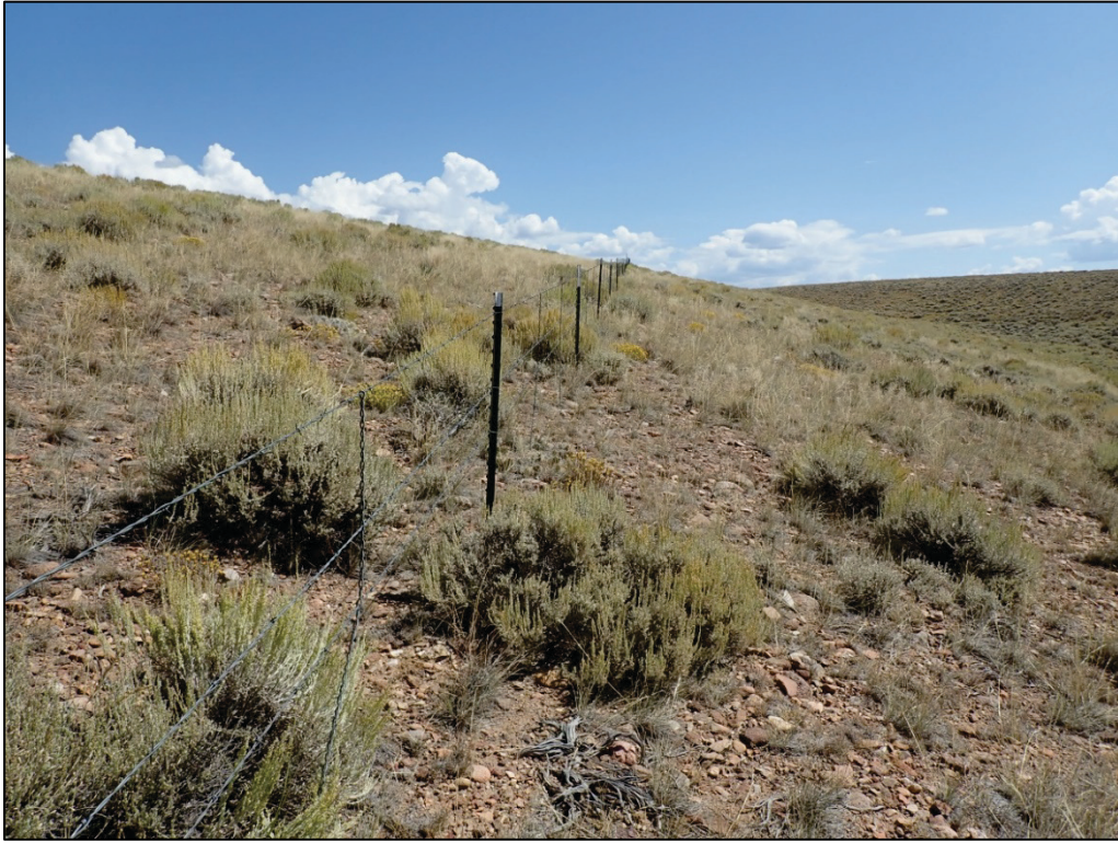
PL-1. North Fence Line