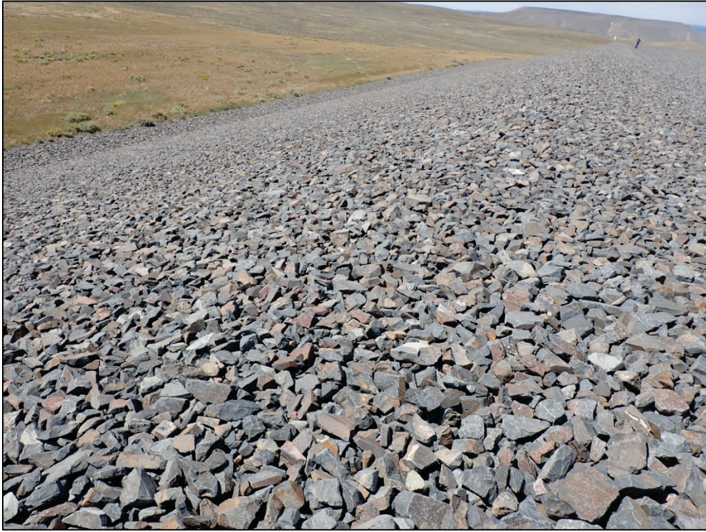
PL-5. South Side Slope of Disposal Cell