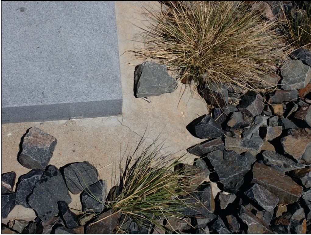
PL-3. Small Crack in Base of Site Marker SMK-2