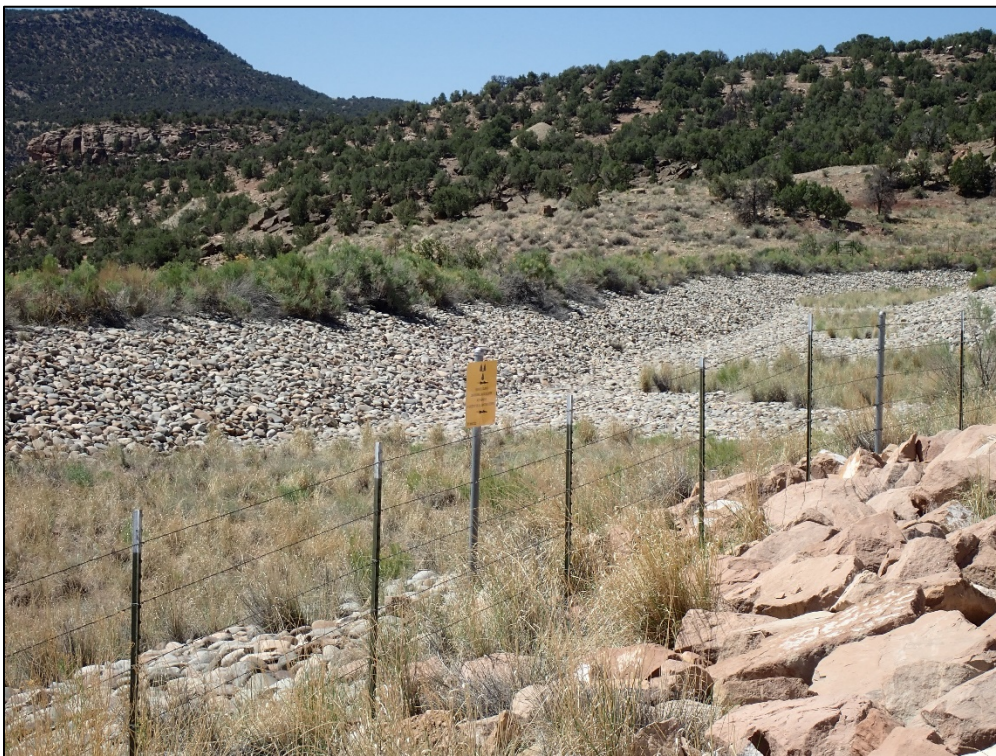
PL-8. Vegetation Growing in Interceptor Channel