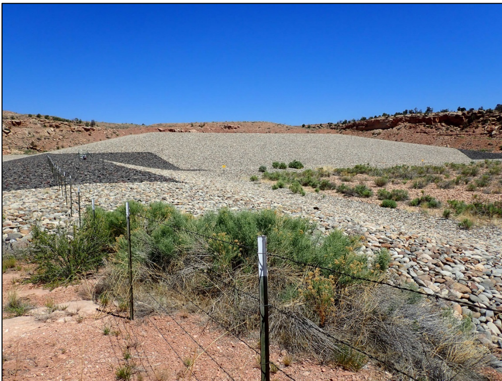
PL-6. Disposal Cell