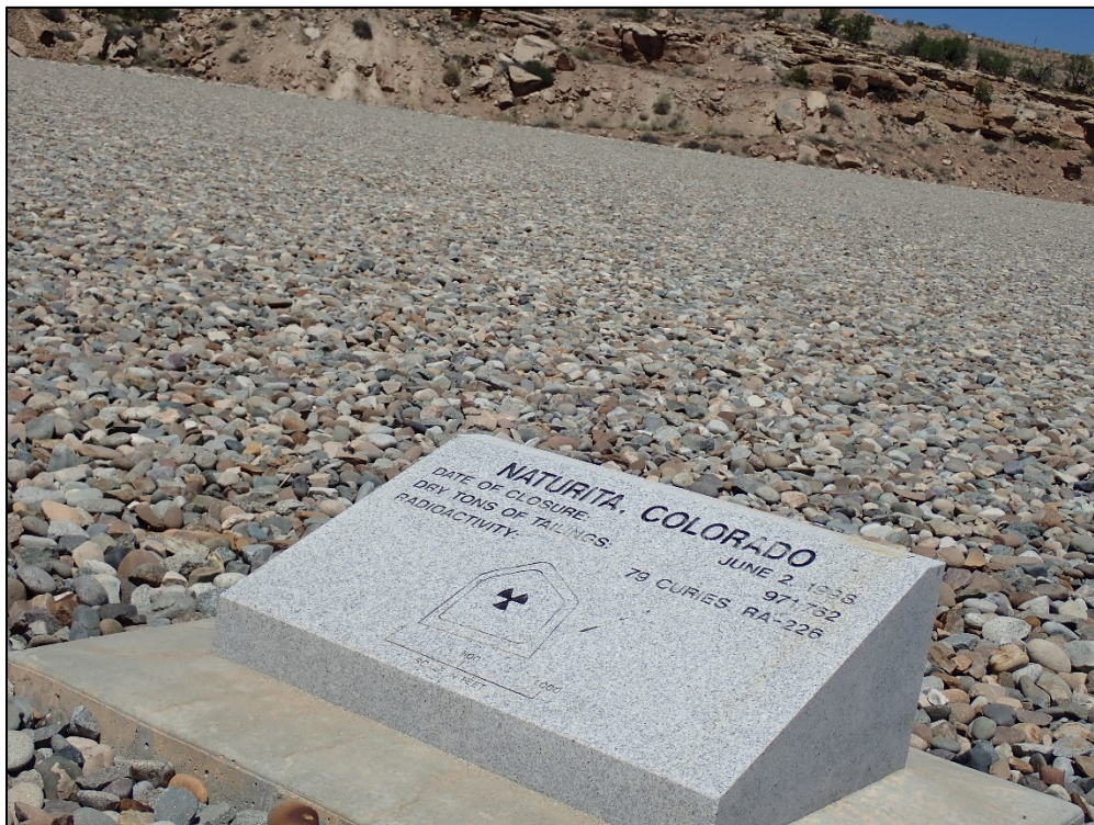
PL-2. Site Marker on Disposal Cell Top