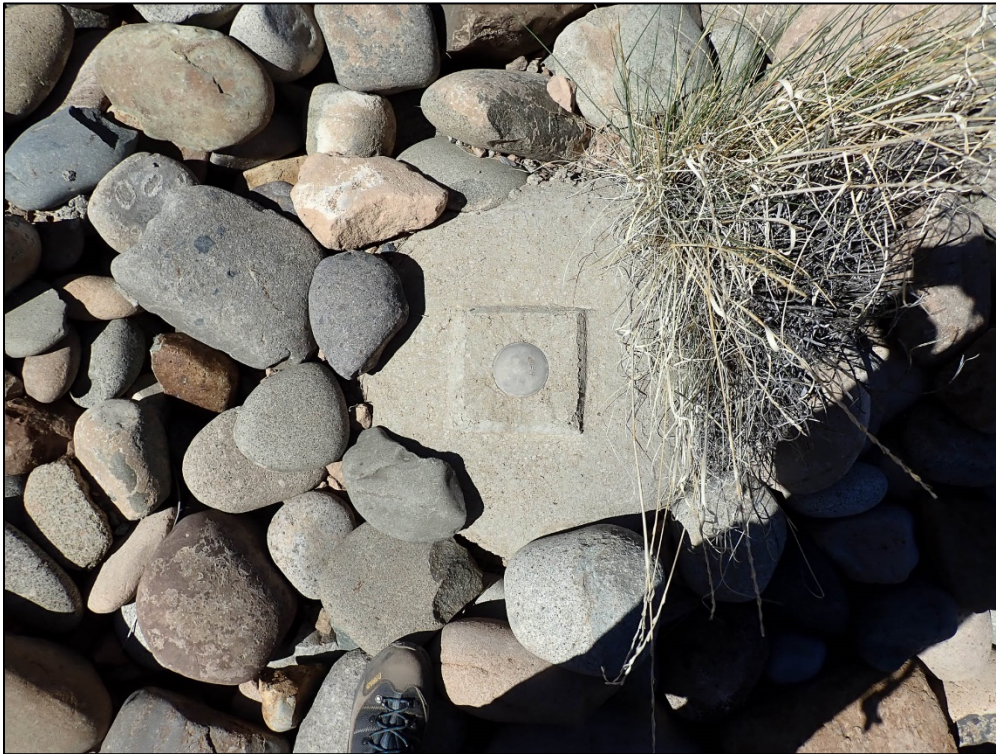
PL-3. Survey Monument SM-4