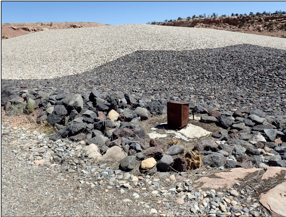
PL-5. Monitoring Well CM93-1