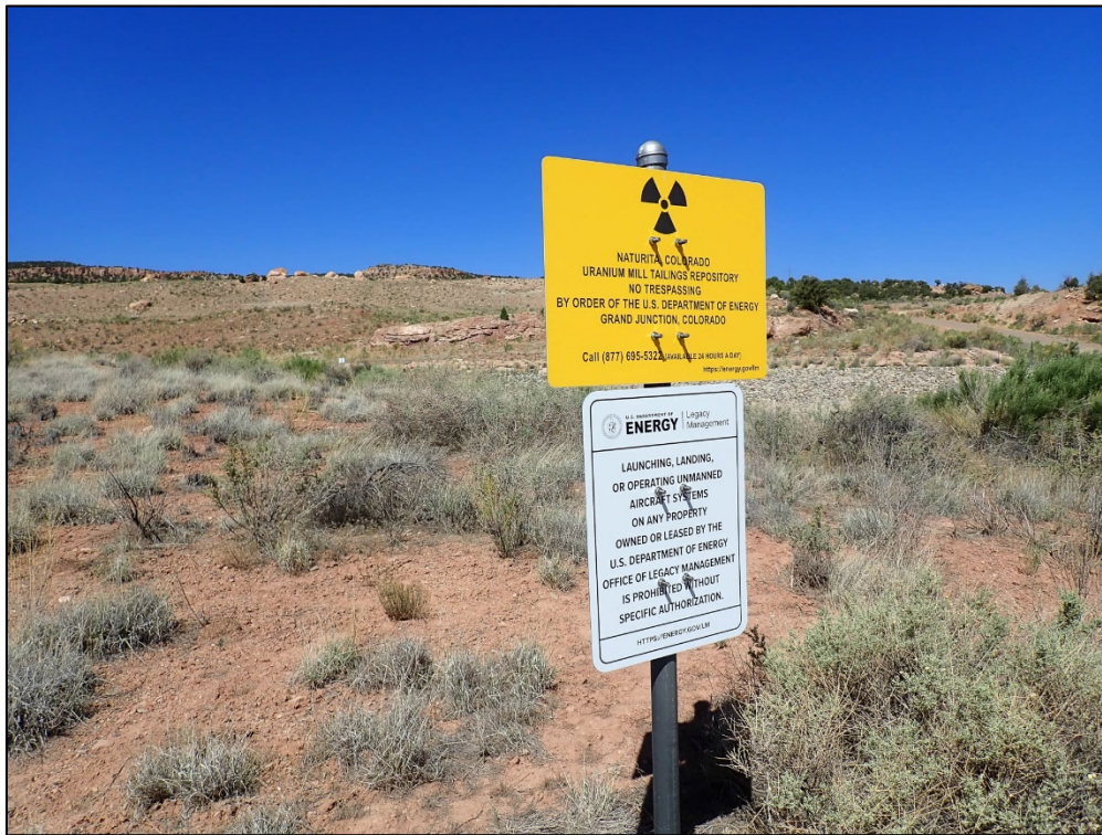
PL-1. Entrance Sign with Unmanned Aircraft System Sign