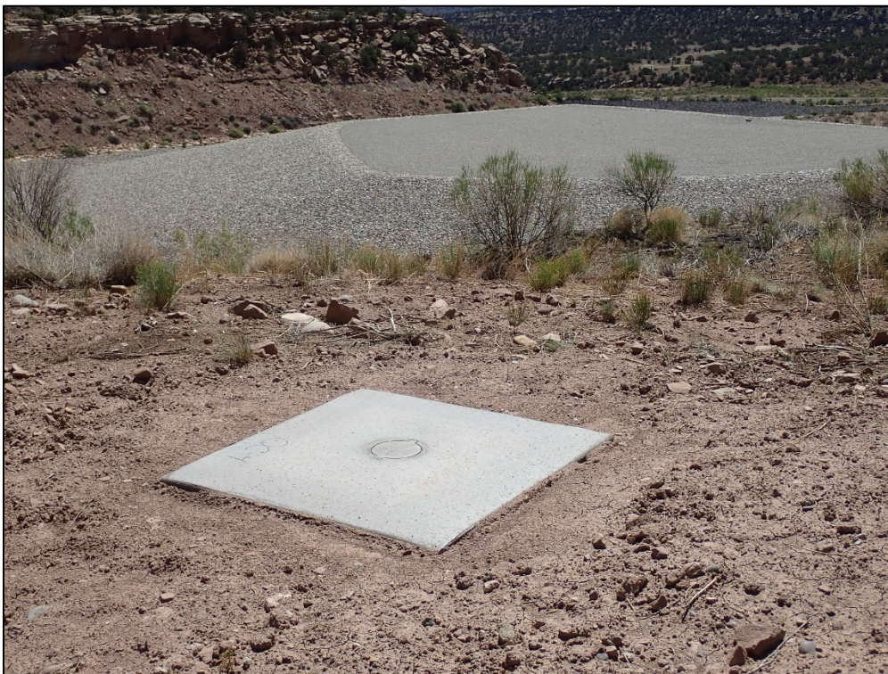
PL-4. Aerial Survey Quality Control Monument QC-4