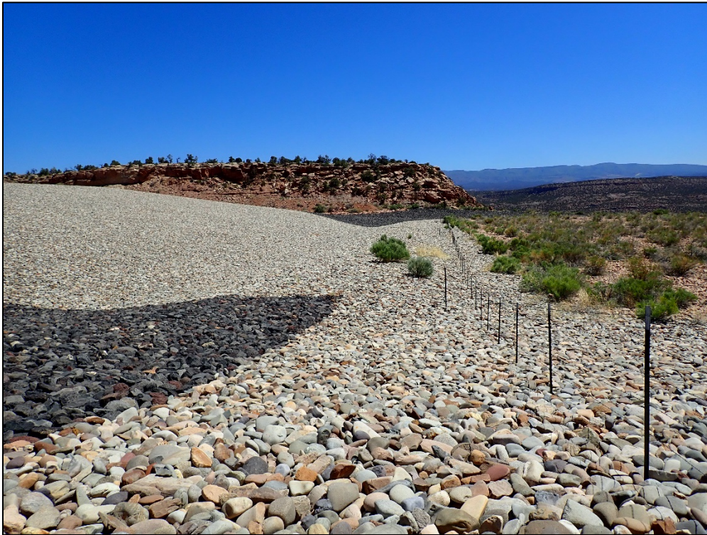
PL-7. Vegetation Growing near Southern Fence Line