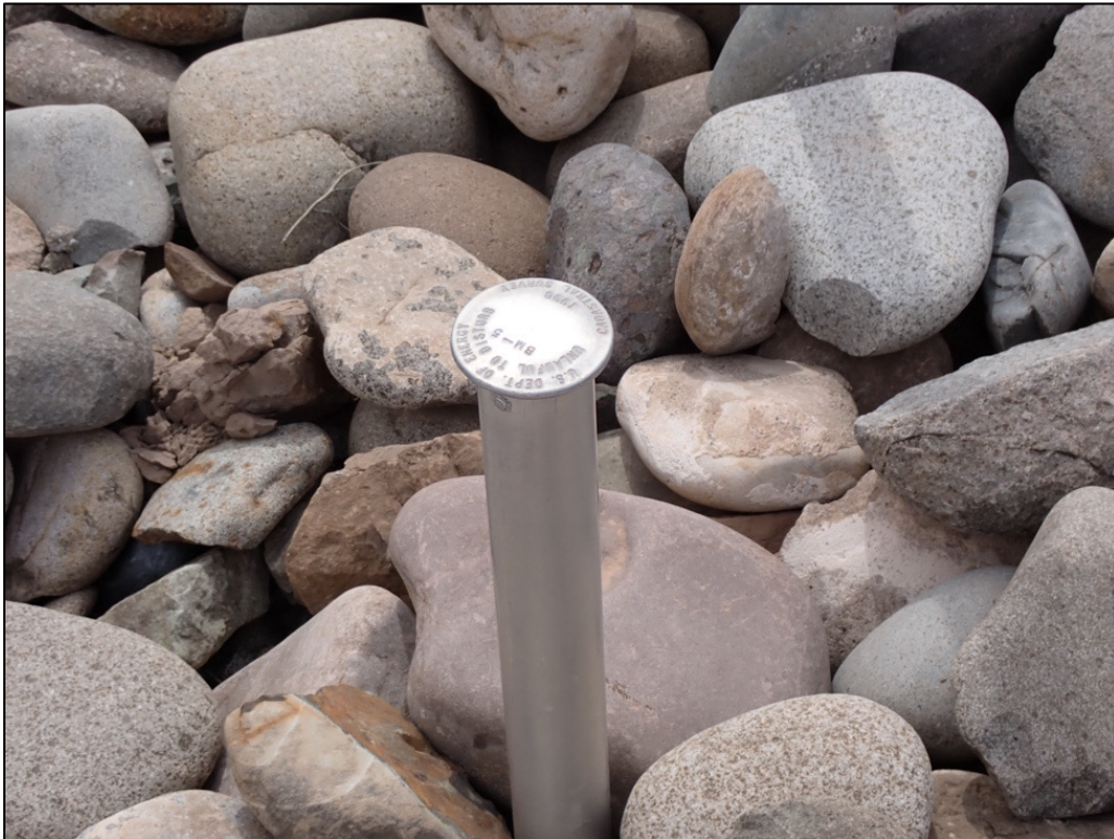
PL-3. Boundary Monument BM-5