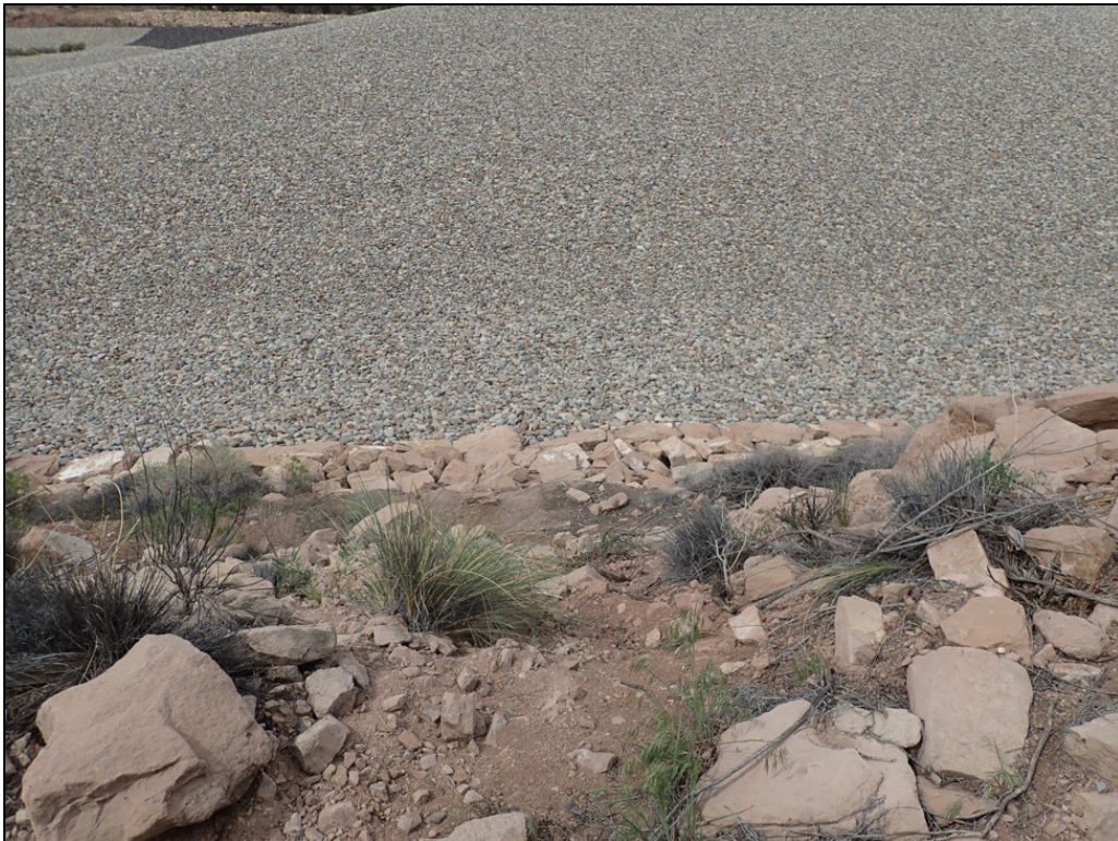
PL-4. Previous Site of Monitoring Well BR95-1