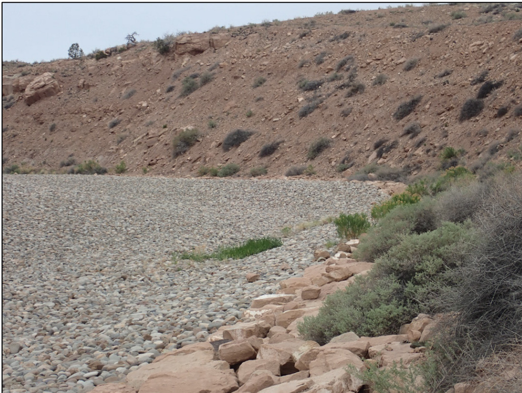
PL-6. Vegetation Growing in Accumulated Sediment Downslope from Culvert Break