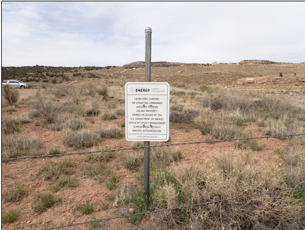
PL-1. Entrance Area with Missing Entrance Sign