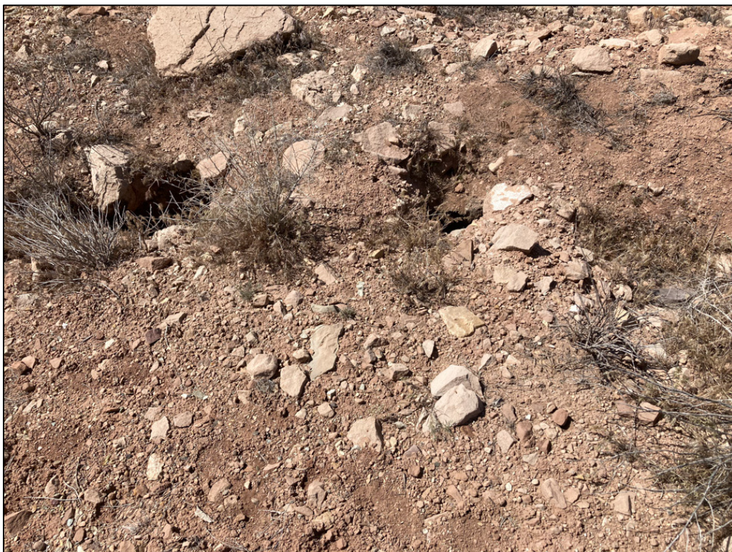
PL-7. Erosional Channeling on Slope North of Disposal Cell