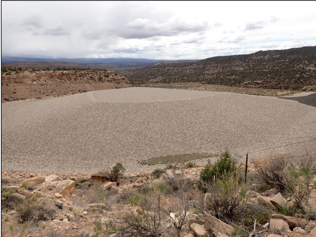
PL-5. Disposal Cell