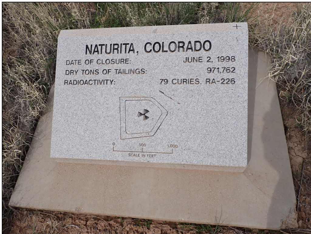
PL-2. Site Marker SMK-1 near Entrance Gate