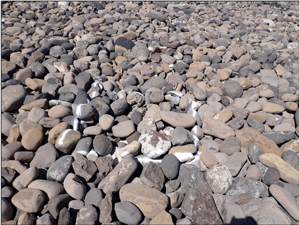
PL-7. (a) Rock Quality Plot No. III—2021