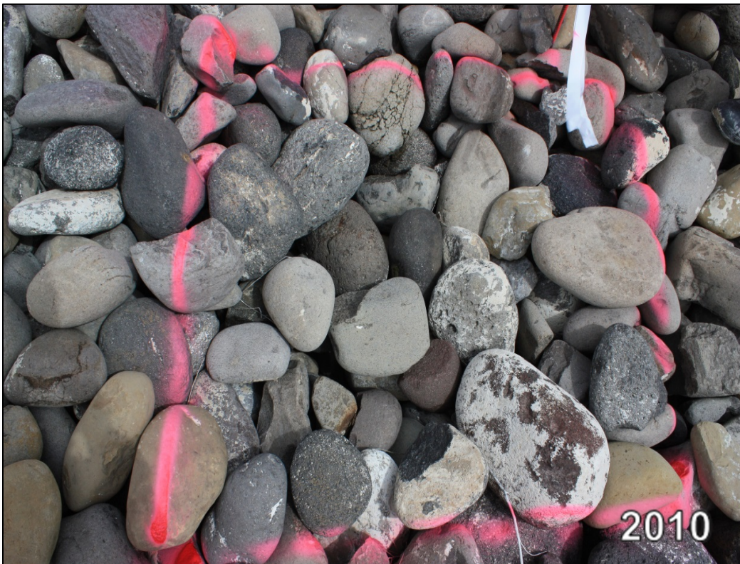
PL-7. (b) Rock Quality Plot No. III—2010 Photo for Comparison