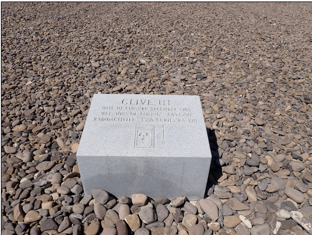
PL-2. Site Marker SMK-2