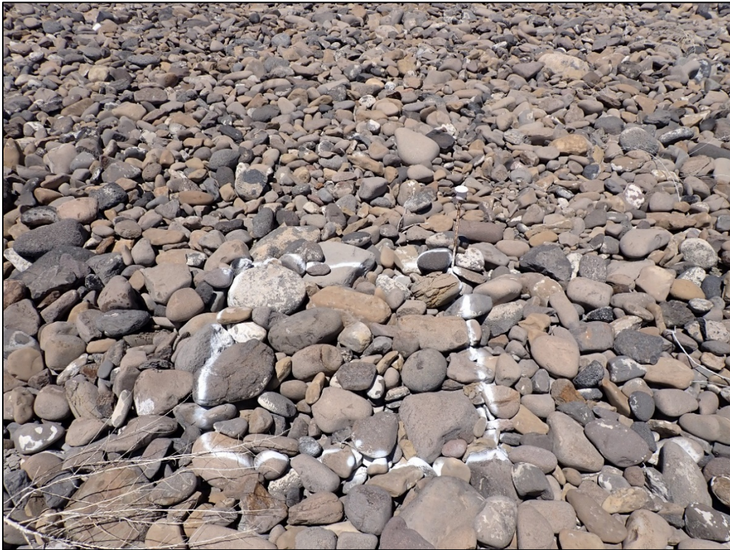
PL-6. (a) Rock Quality Plot No. II—2021