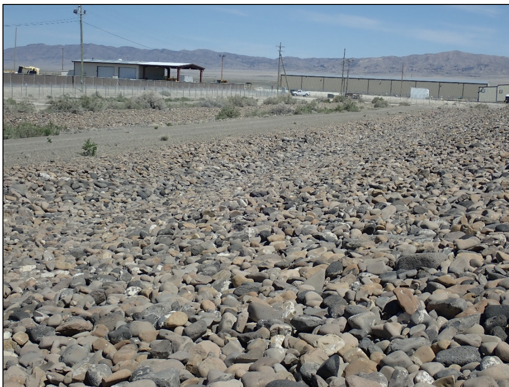
PL-4. North Side Cell Slope