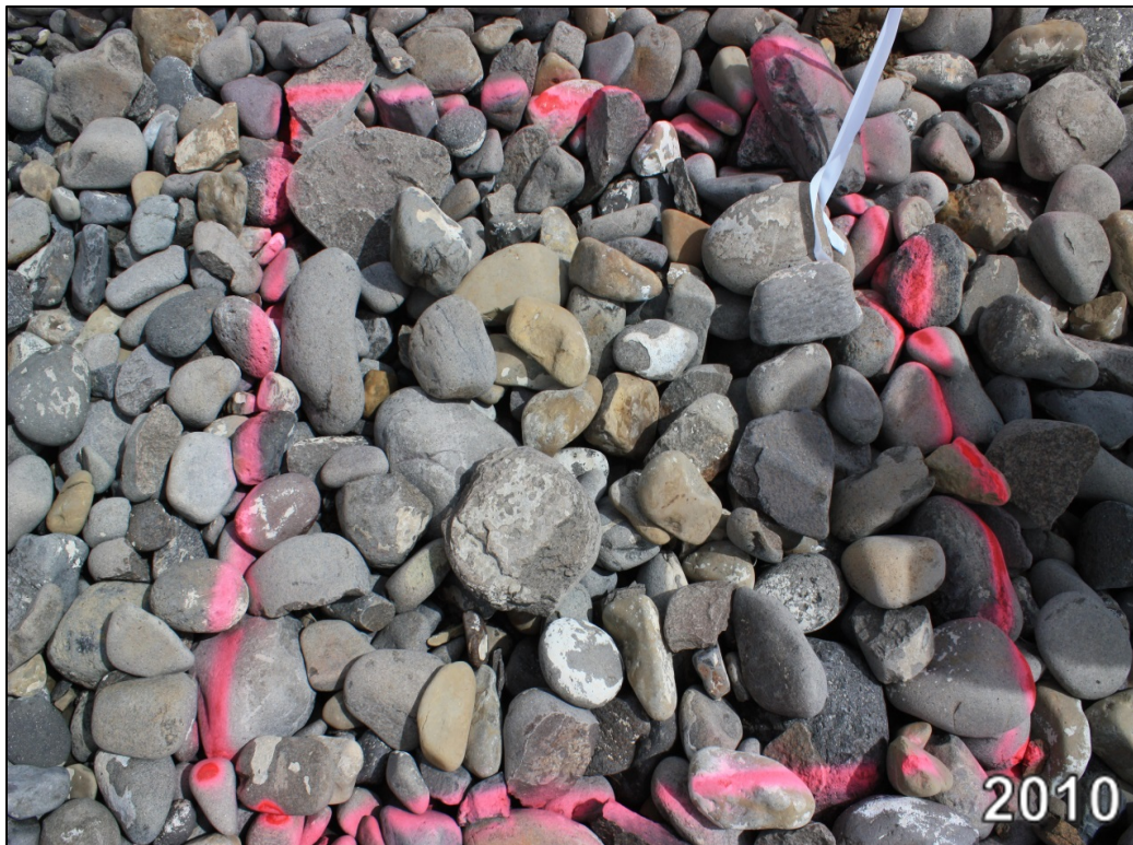
PL-5. (b) Rock Quality Plot No. 1—2010 Photo for Comparison