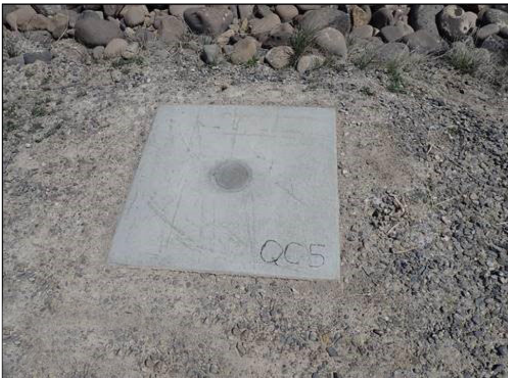
PL-3. Baseline Aerial Survey Quality Control Monument