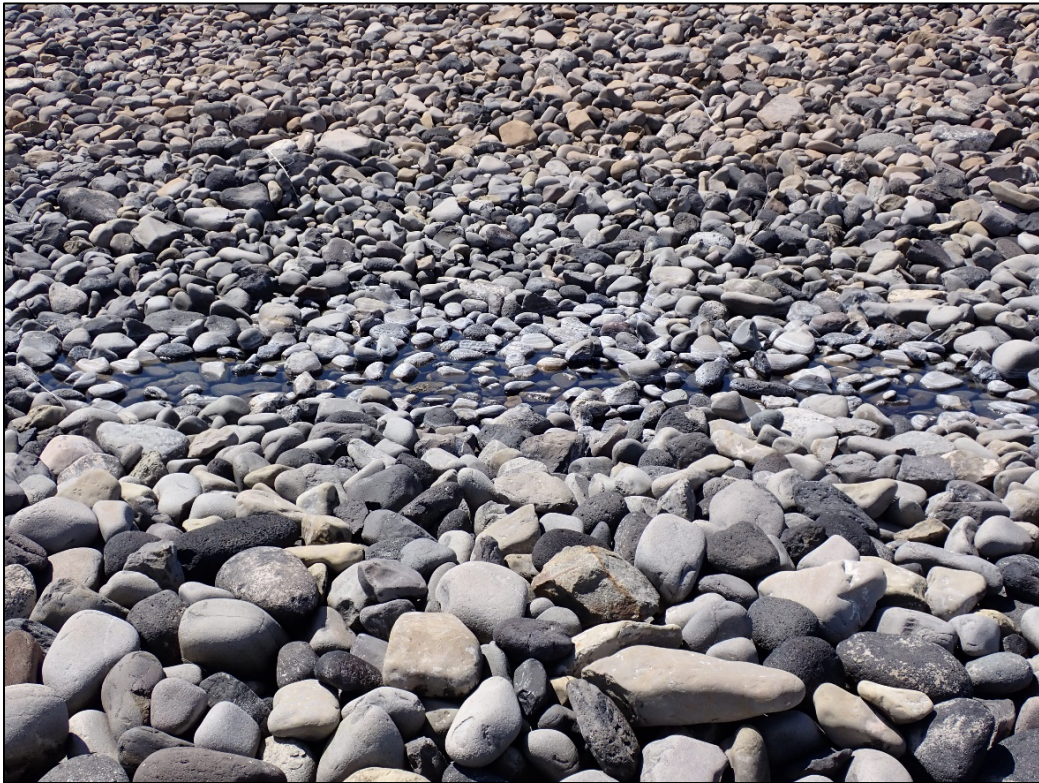
PL-8. Standing Water in Southeast Cell Toe Drainage