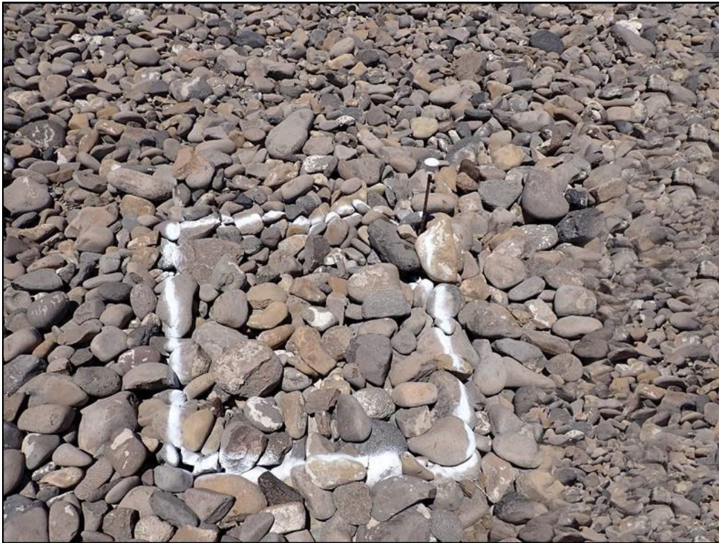
PL-5. (a) Rock Quality Plot No. 1—2021