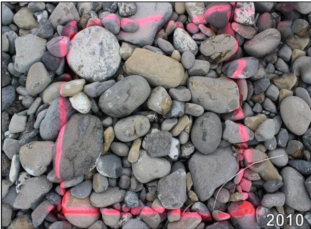
PL-6. (b) Rock Quality Plot No. II—2010 Photo for Comparison