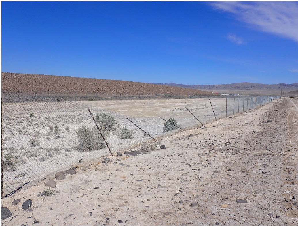
PL-1. Down Fence Along South Side of Cell