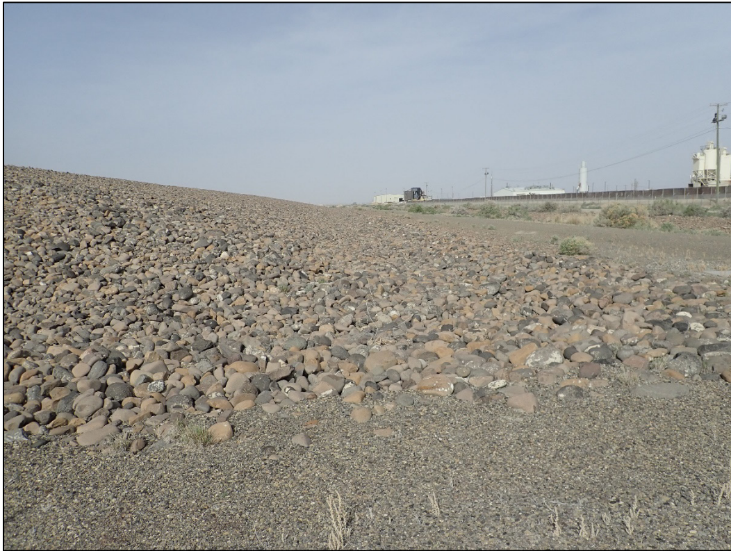
PL-5. Northern Cell Side Slope