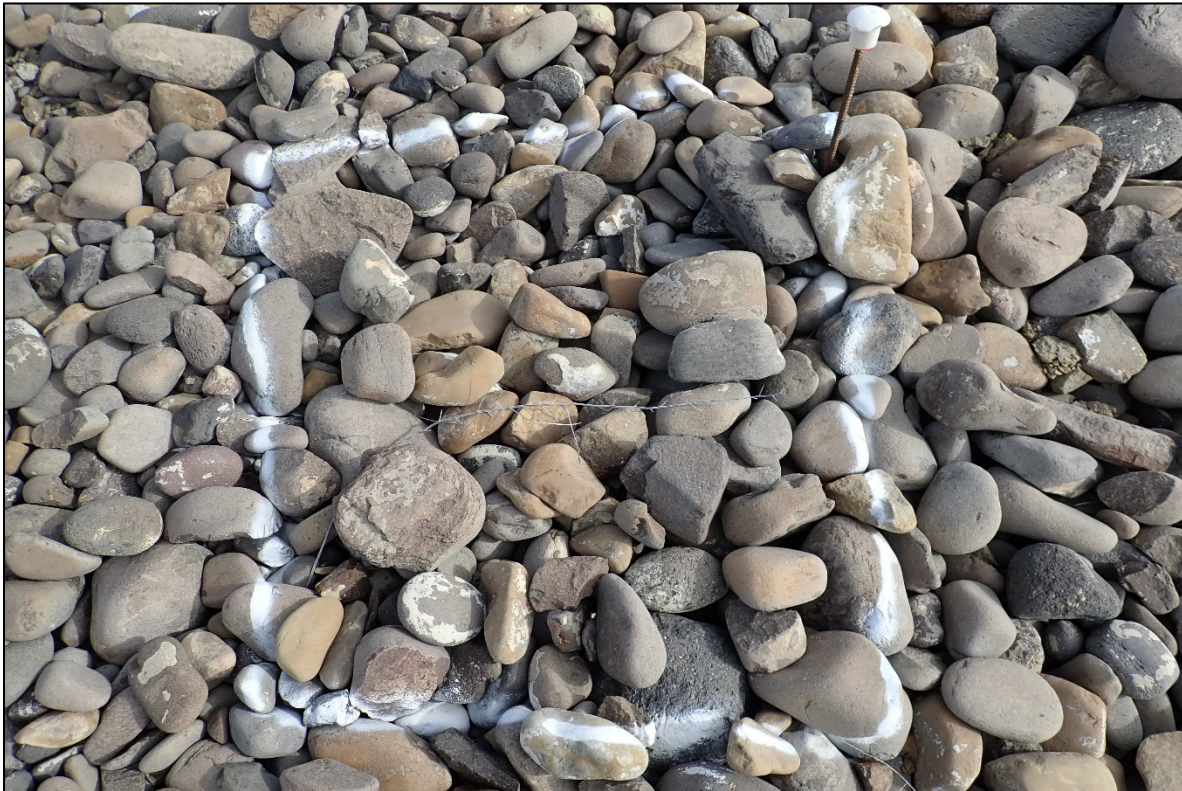
PL-6a. Rock Quality Plot No. I—2022