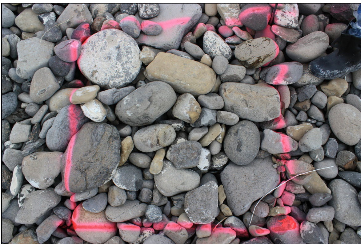
PL-7b. Rock Quality Plot No. II—2010 Photo for Comparison