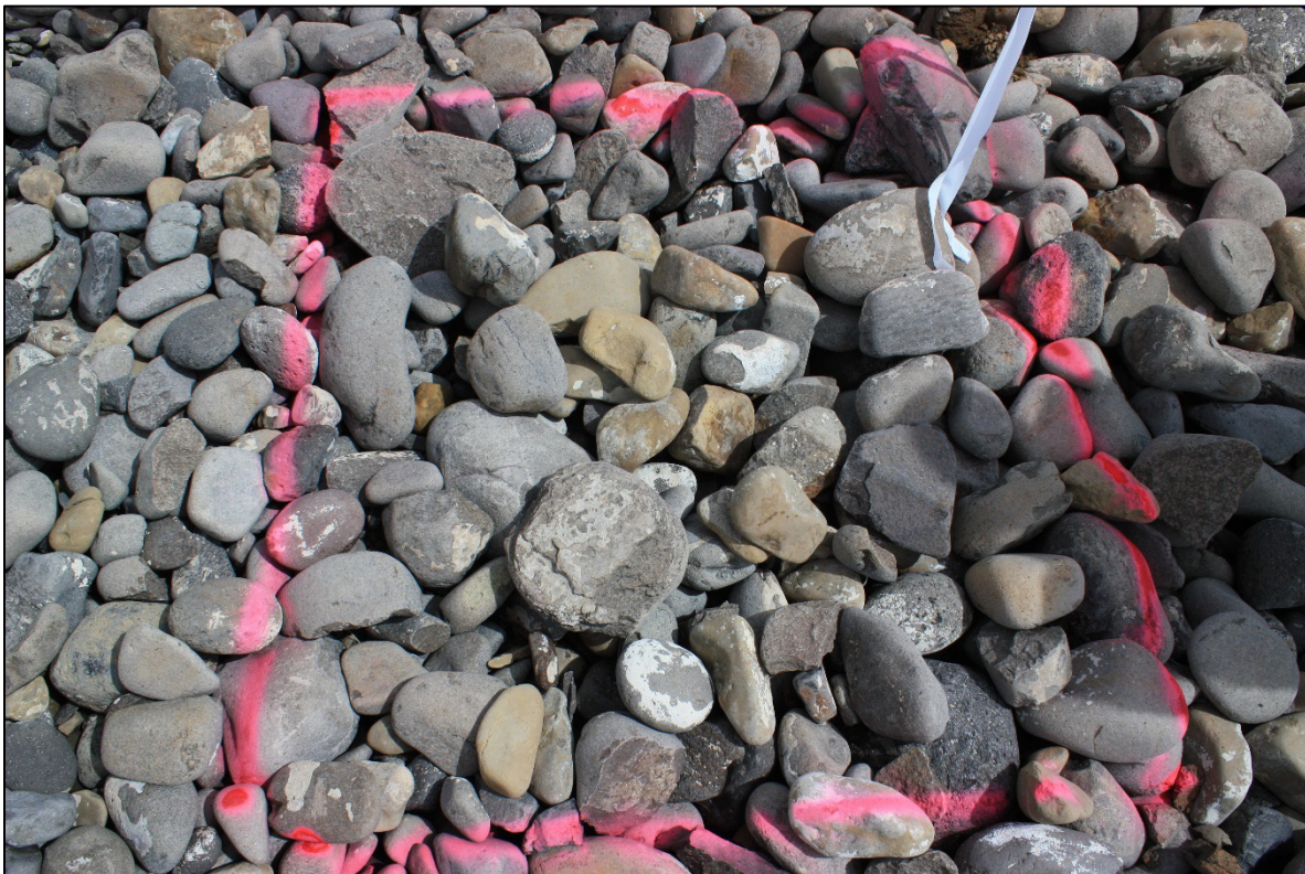
PL-6b. Rock Quality Plot No. I—2010 Photo for Comparison