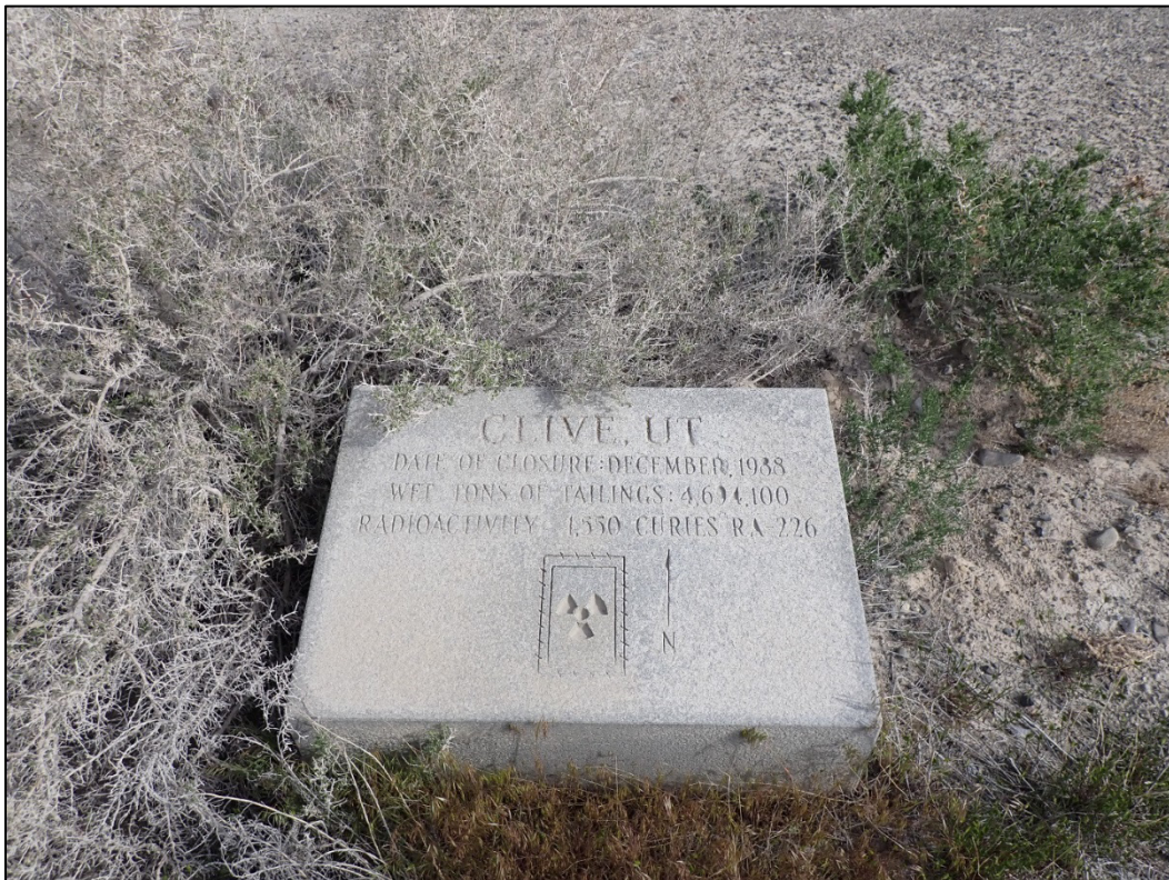
PL-2. Site Marker SMK-1