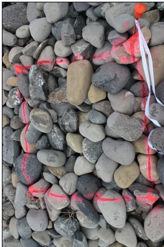
PL-9b. Rock Quality Plot No. VIII—2010 Photo for Comparison