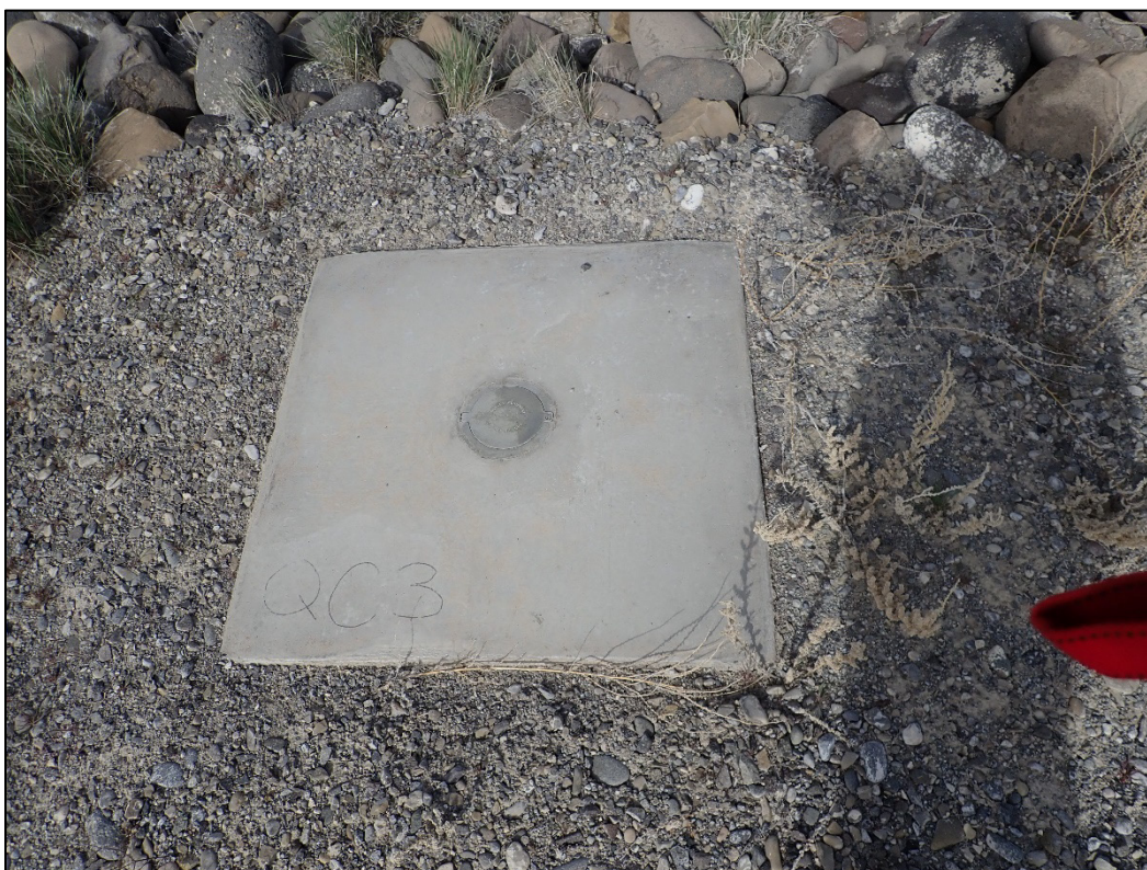
PL-4. Quality Control Monument QC-3