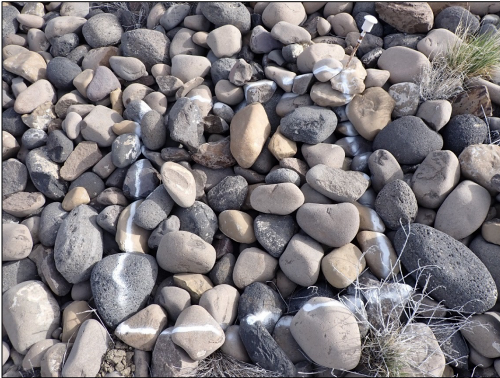
PL-9a. Rock Quality Plot No. VIII—2022