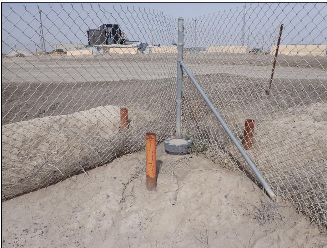
PL-3. Boundary Monument BM-1 with Protective Cover and Nearby Bollards