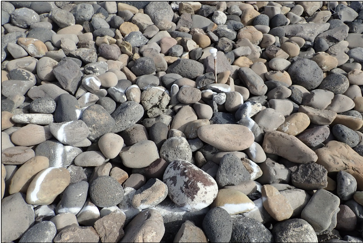
PL-8a. Rock Quality Plot No. III—2022