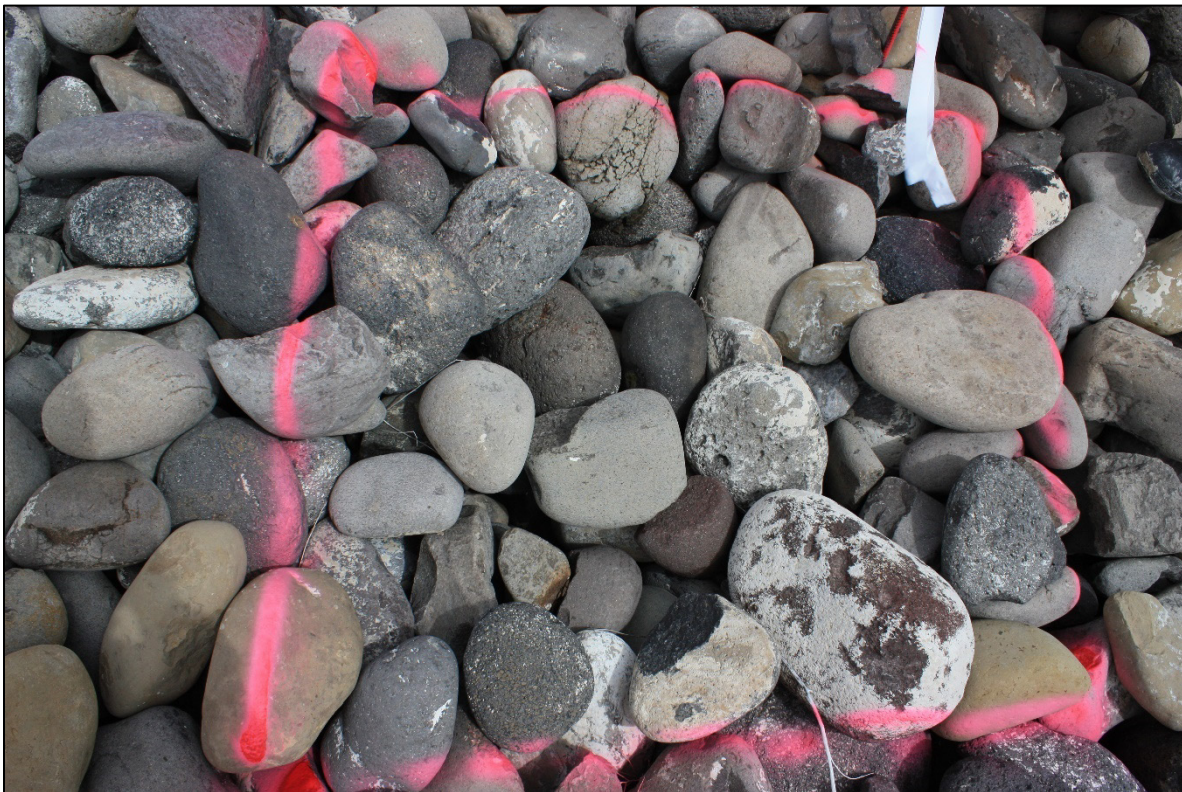
PL-8b. Rock Quality Plot No. III—2010 Photo for Comparison