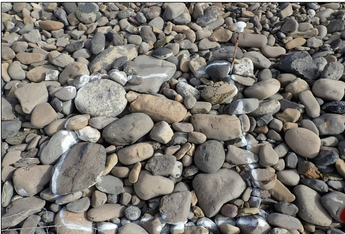
PL-7a. Rock Quality Plot No. II—2022