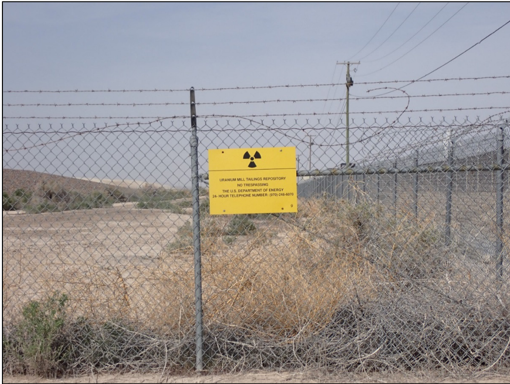
PL-1. Perimeter Sign P9