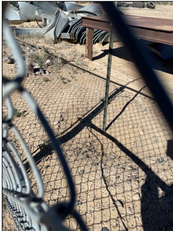
PL-7. Boundary Monument BM-3 (Covered with Rocks)