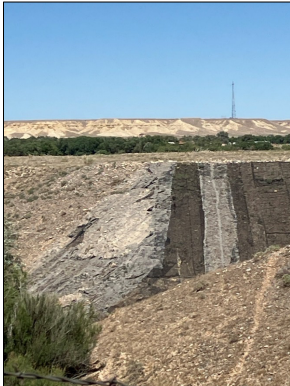
PL-13. Deteriorated Fabric in Outflow Channel