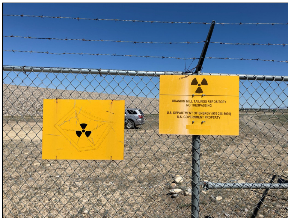
PL-1. Entrance Sign

— = Photograph taken vertically from above.