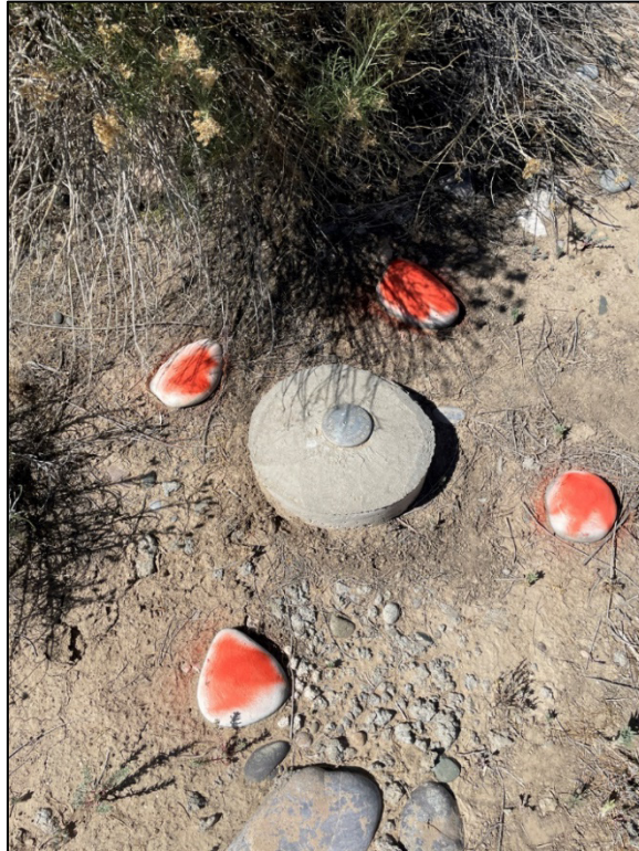
PL-10. Erosion Control Marker ECM-5A