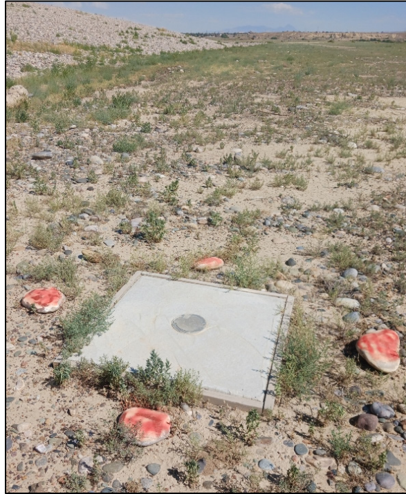
PL-8. Quality Control Monument QC-2