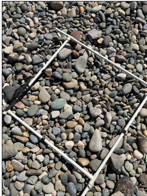
PL-9. Aerial Survey Targets