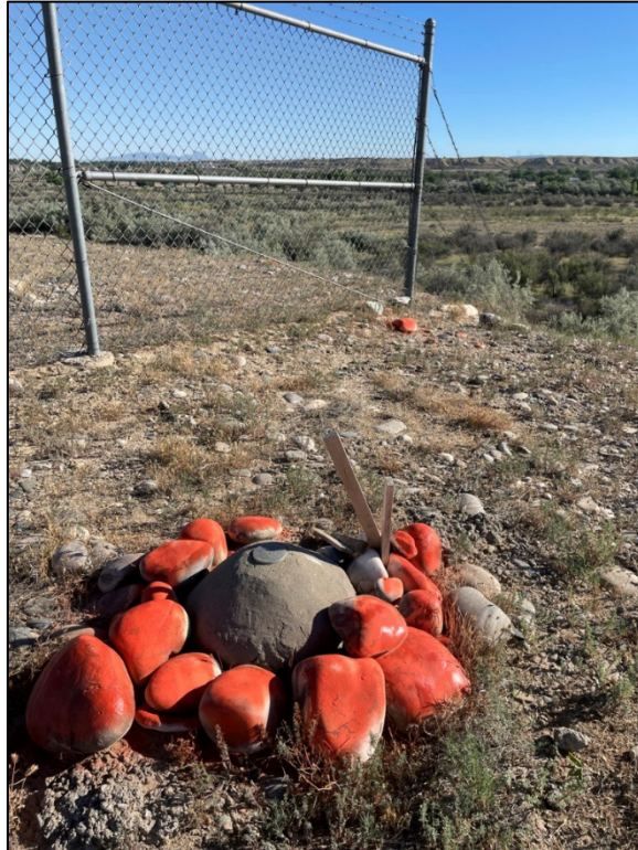
PL-6. Survey Monument SM-1