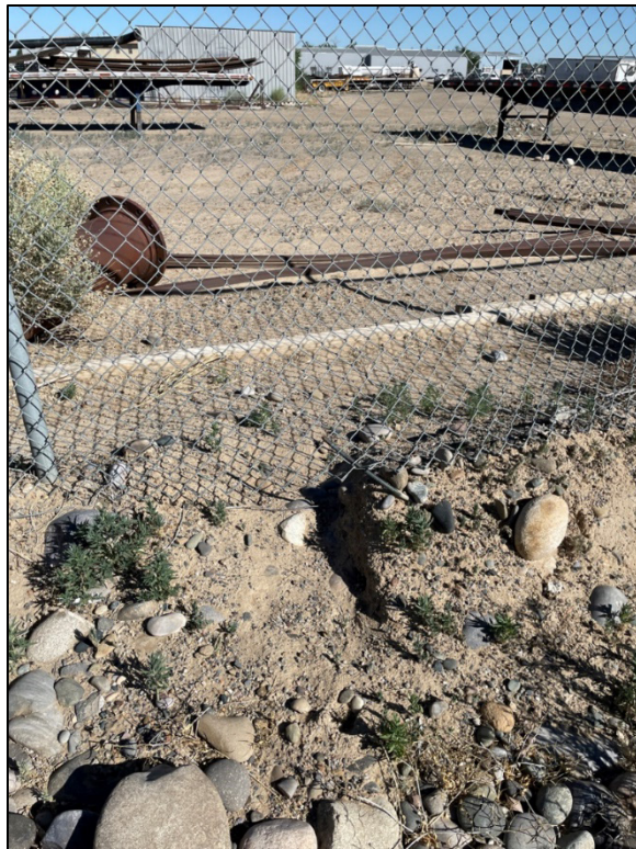
PL-3. Gap Under Fence