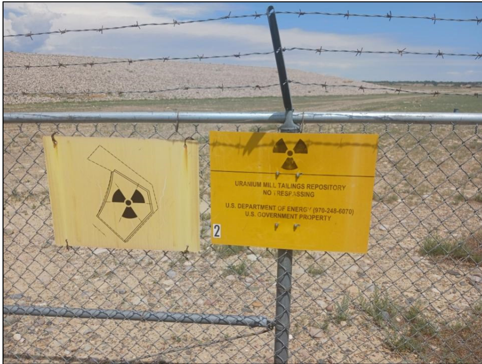
PL-4. Perimeter Sign Pair