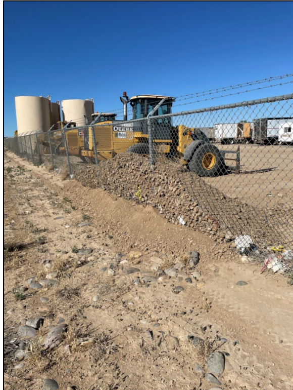
PL-2. Dirt Piled on Fence