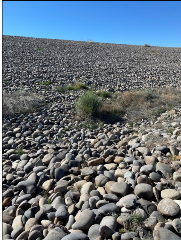
PL-12. Woody Shrubs