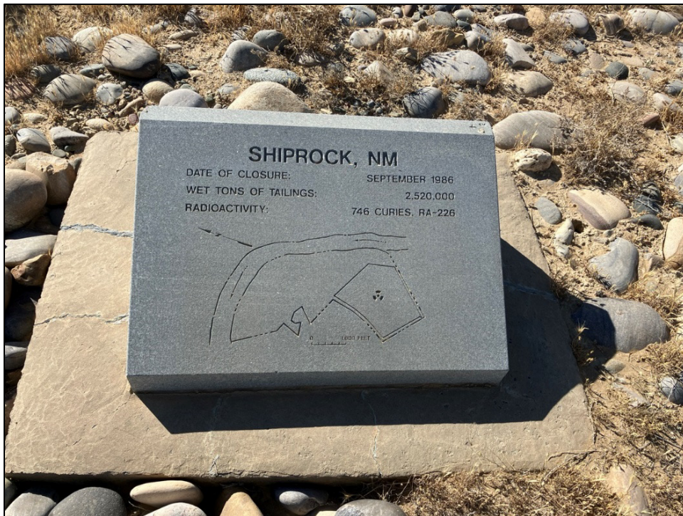
PL-5. Site Marker SMK-1