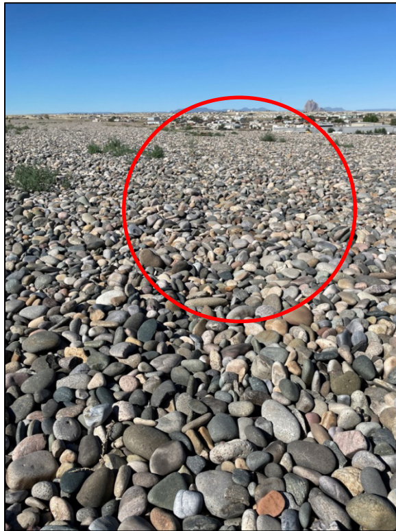
PL-11. Vehicle Ruts