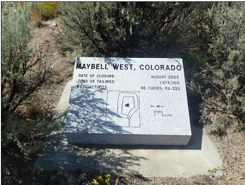
PL-4. Granite Site Marker