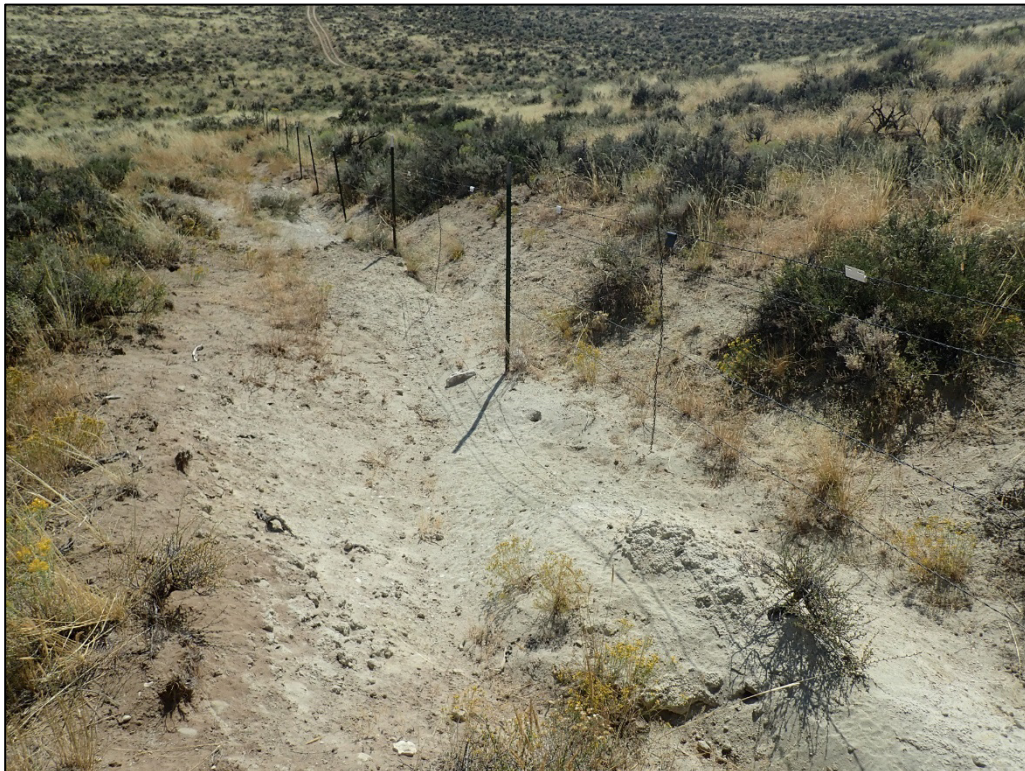
PL-2. Erosion Under Perimeter Fence Southwest of Disposal Cell