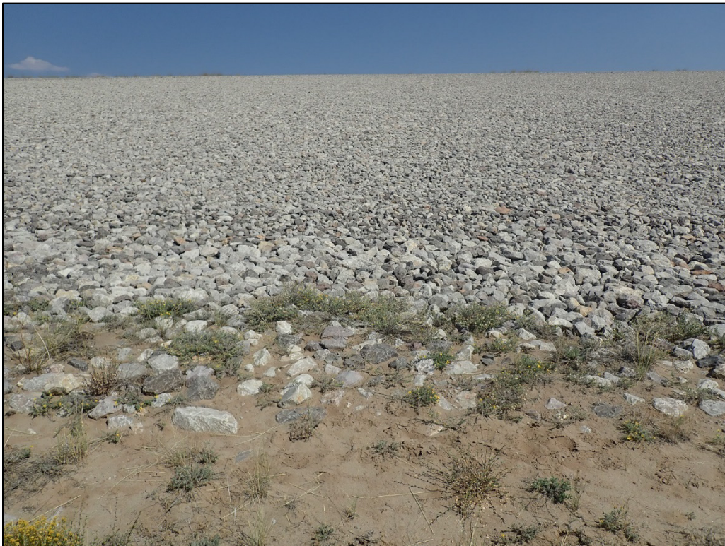
PL-12. Windblown Material Along Western Toe Slope of Disposal Cell