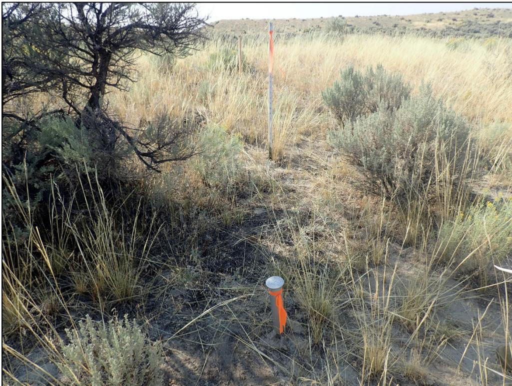
PL-6. Boundary Monument BM-1