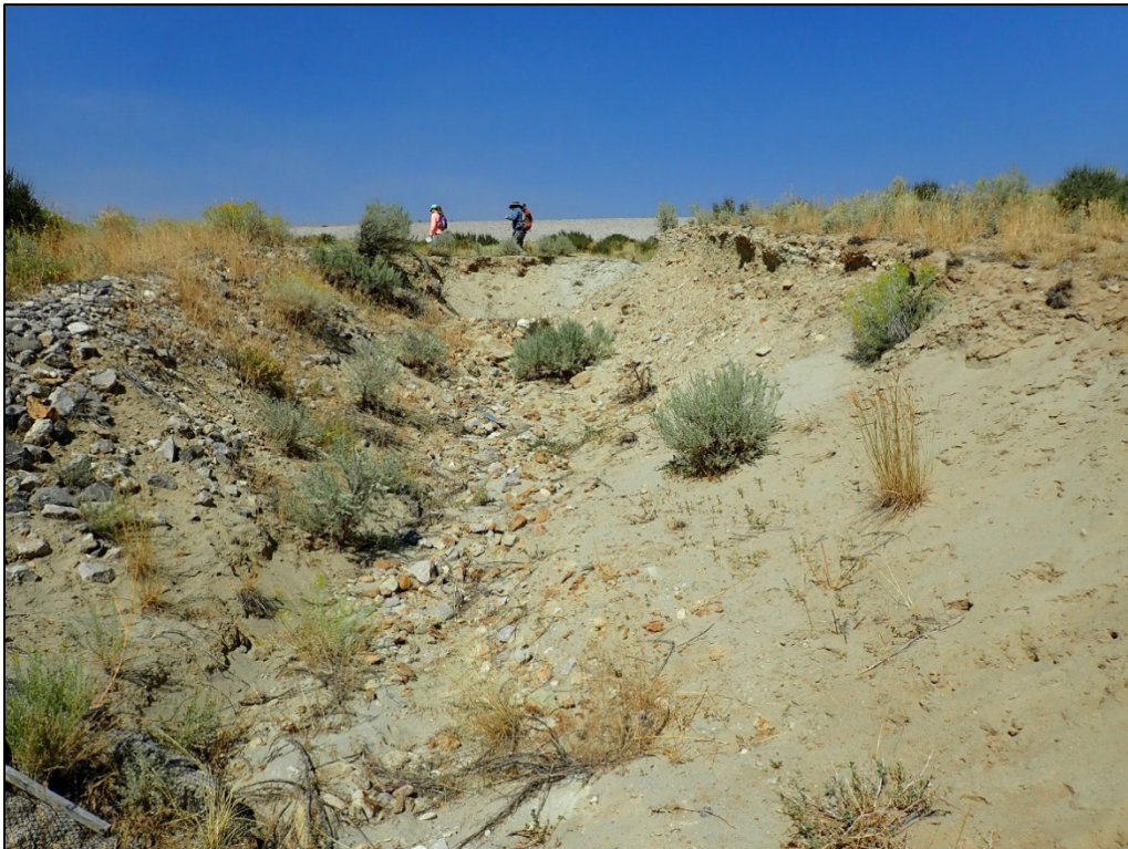
PL-18. Easternmost Erosion Between Rock Berms