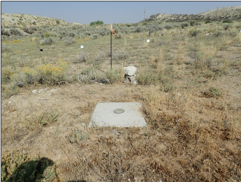
PL-8. Quality Control Monument QC-3