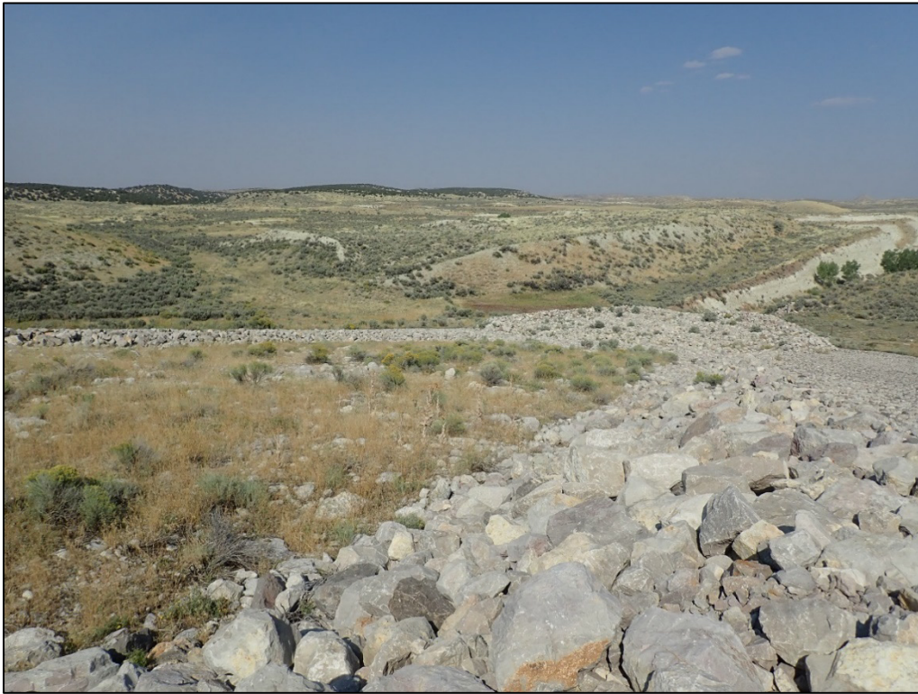
PL-17. Diversion Channel No. 1 Along Disposal Cell Eastern Side Slope and Launch Rock Erosion Protection Basin in Background