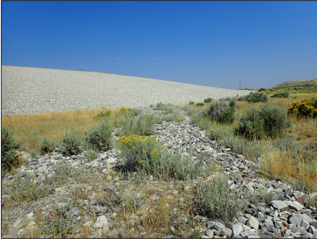
PL-13. Apron Toe Drain