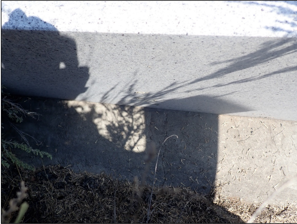
PL-5. Granite Site Marker Cracking on Base