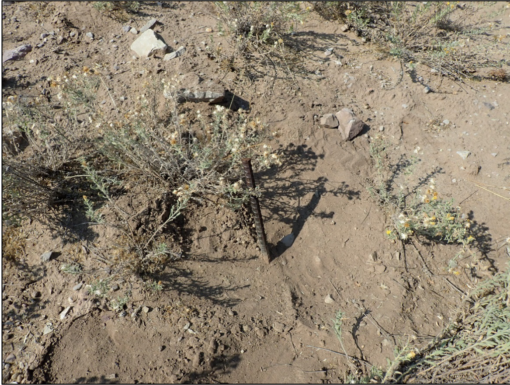
PL-7. Boundary Monument BM-3