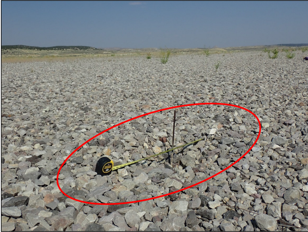
PL-11. Shallow Depression No. 3