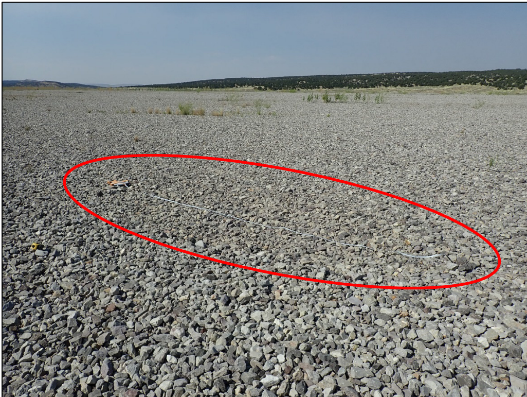
PL-10. Shallow Depression No. 2