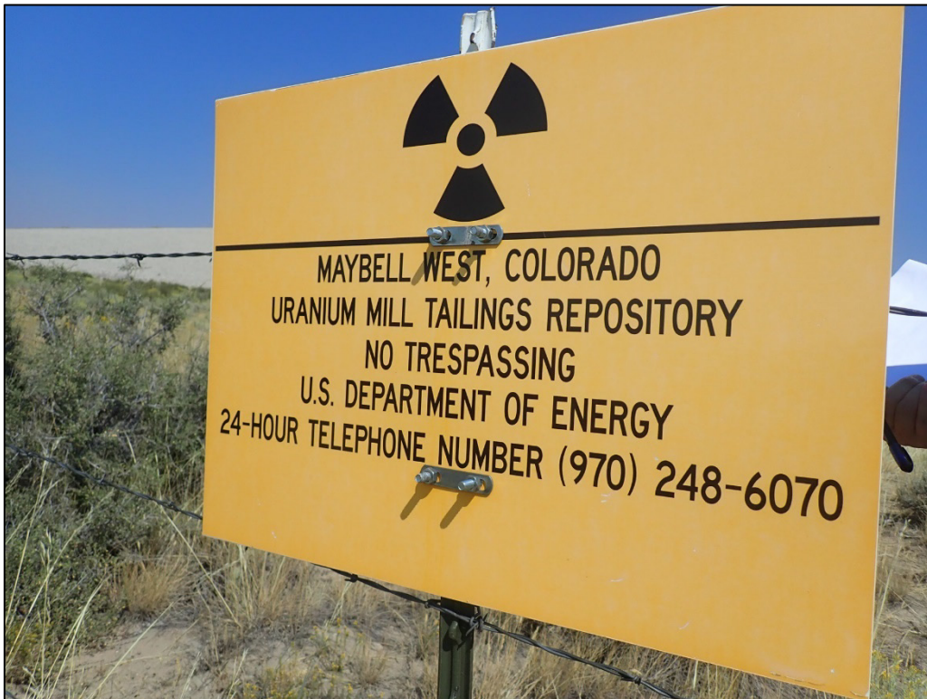
PL-3. Perimeter Sign P7