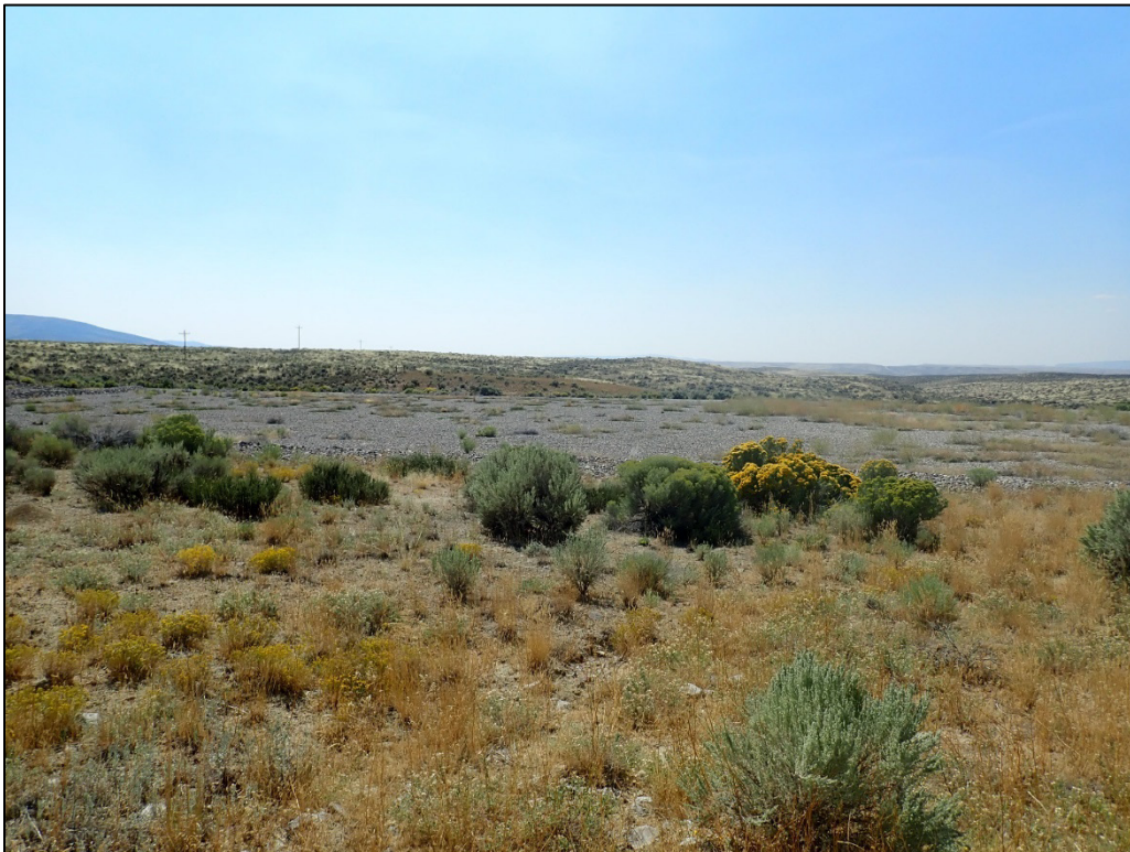
PL-14. Ancillary Cell Top Slope