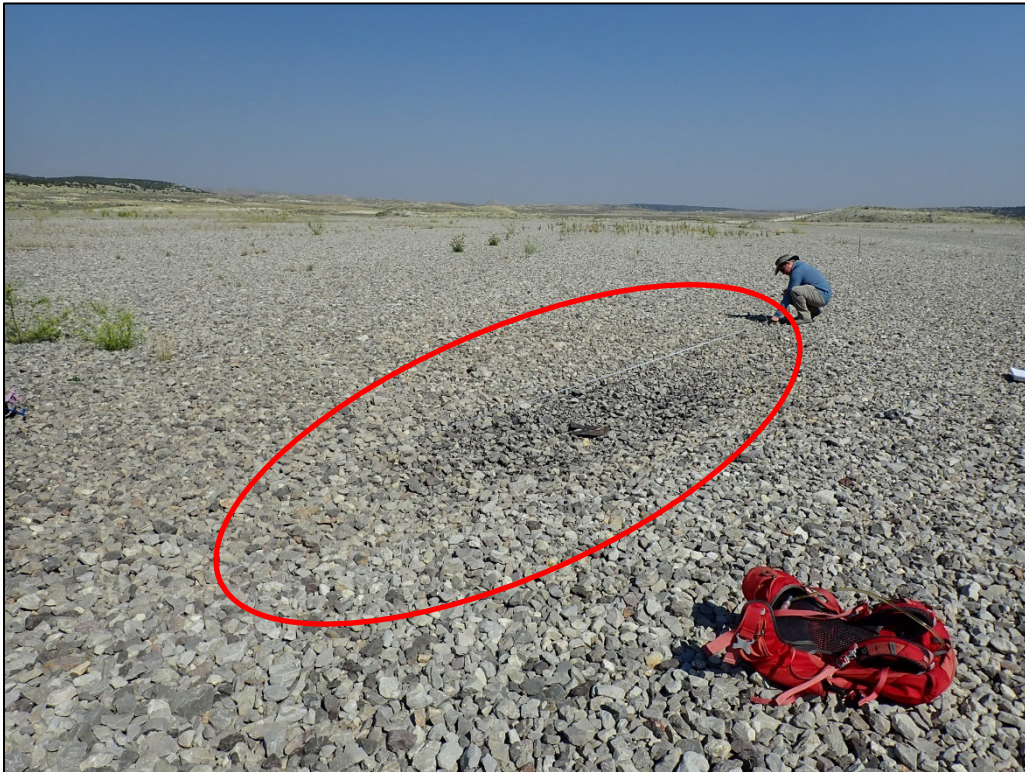
PL-9. Shallow Depression No. 1