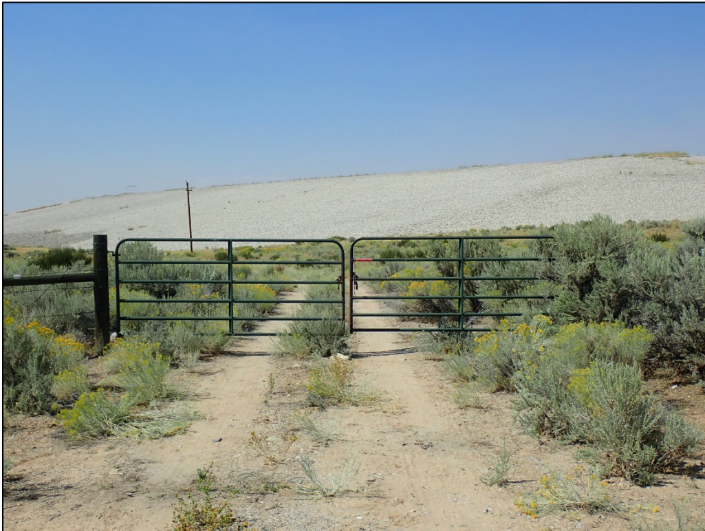
PL-1. Entrance Gate