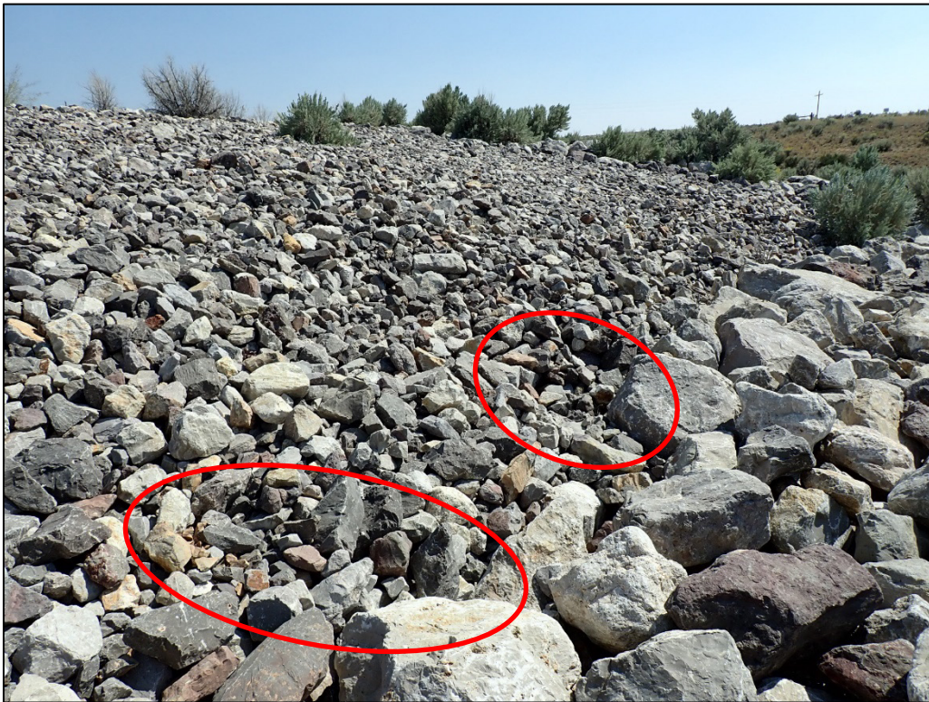
PL-16. Large Depressions on Ancillary Cell Side Slope Toe