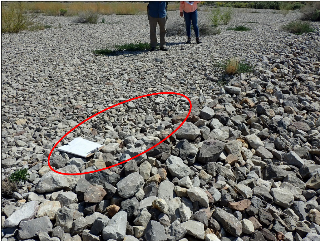
PL-15. Small Depressions on Ancillary Cell Crest