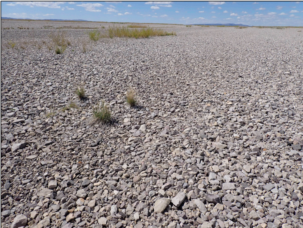
PL-6. Shallow Depression No. 4