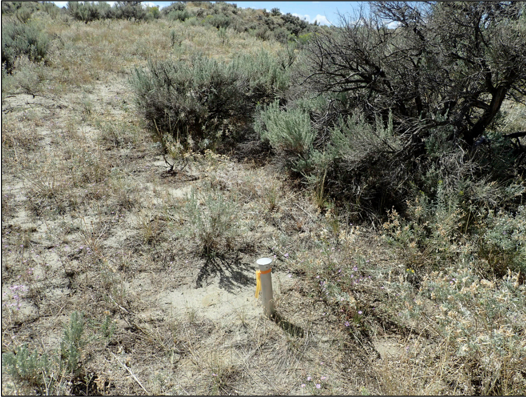
PL-3. Boundary Monument BM-1