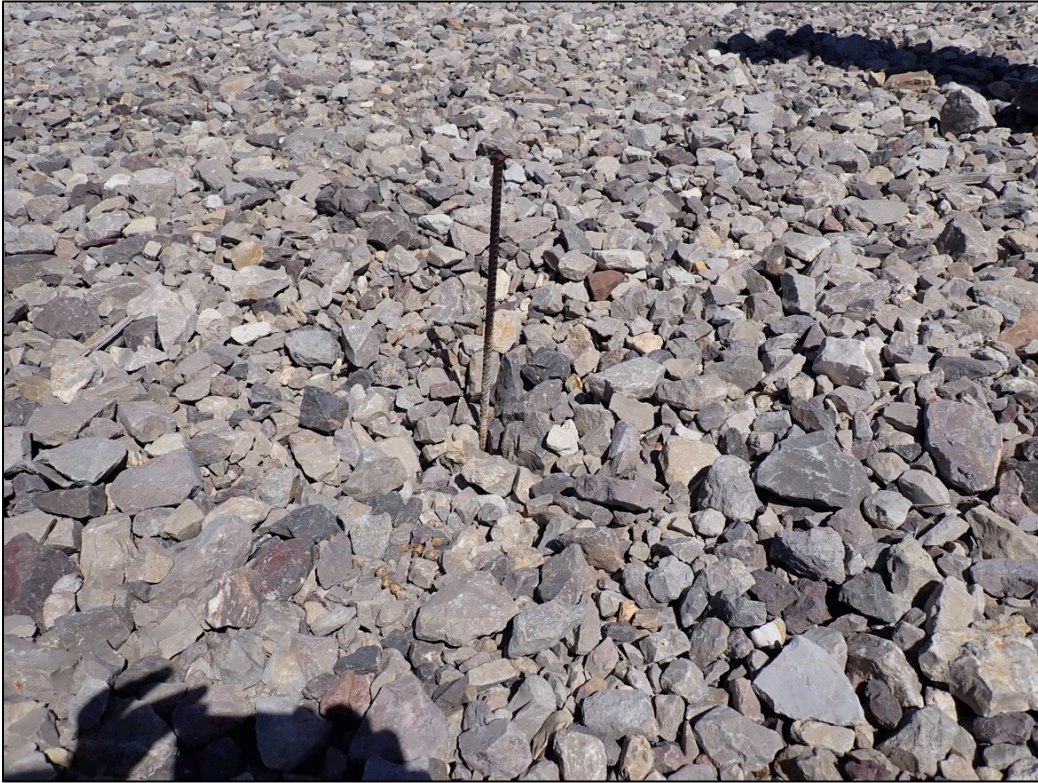
PL-5. Shallow Depression No. 3