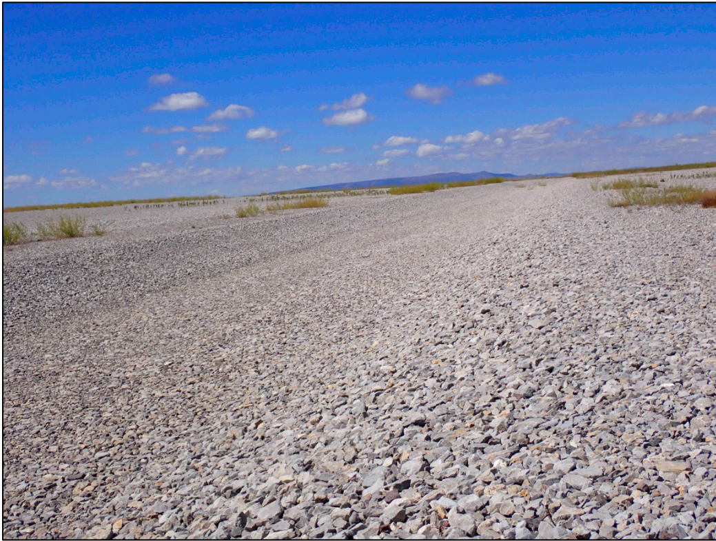
PL-11. Diversion Channel No. 1