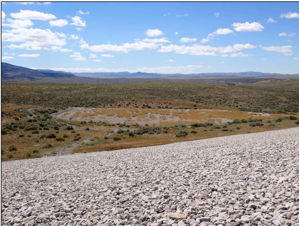
PL-8. Ancillary Cell Overview