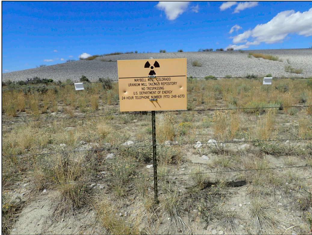
PL-1. Perimeter Sign P1 with Bullet Holes