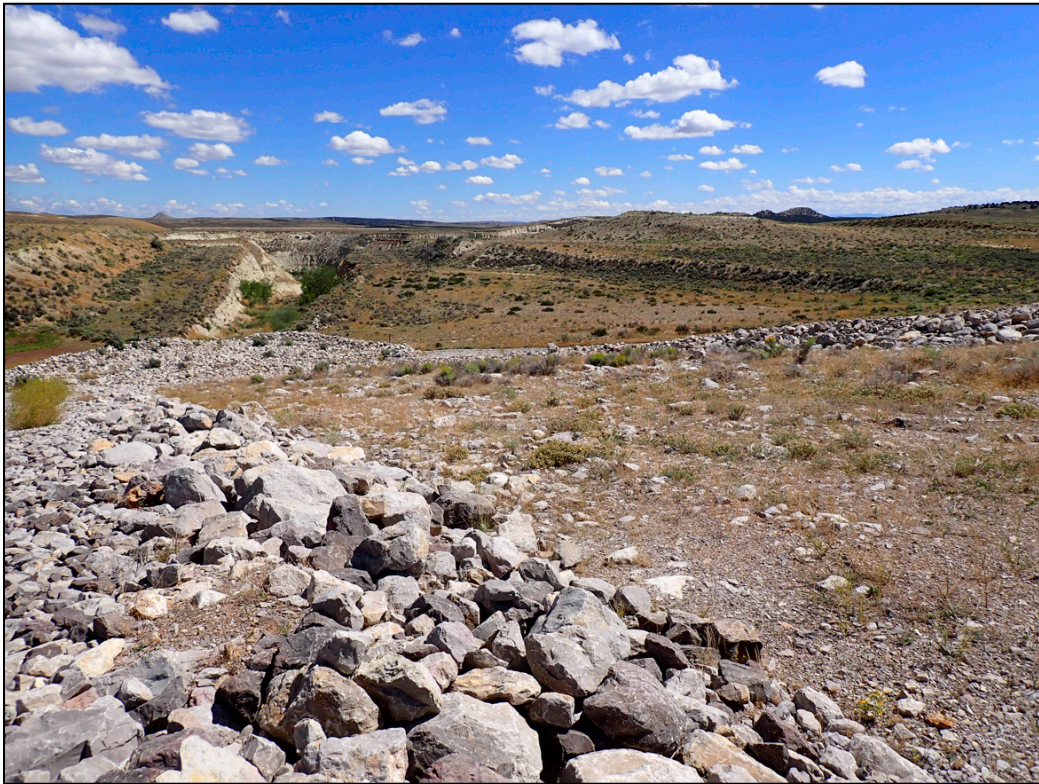
PL-12. Launch Rock Erosion Protection Basin