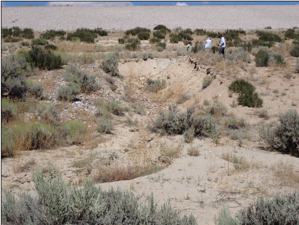
PL-14. Largest Gully Below Rock Berm