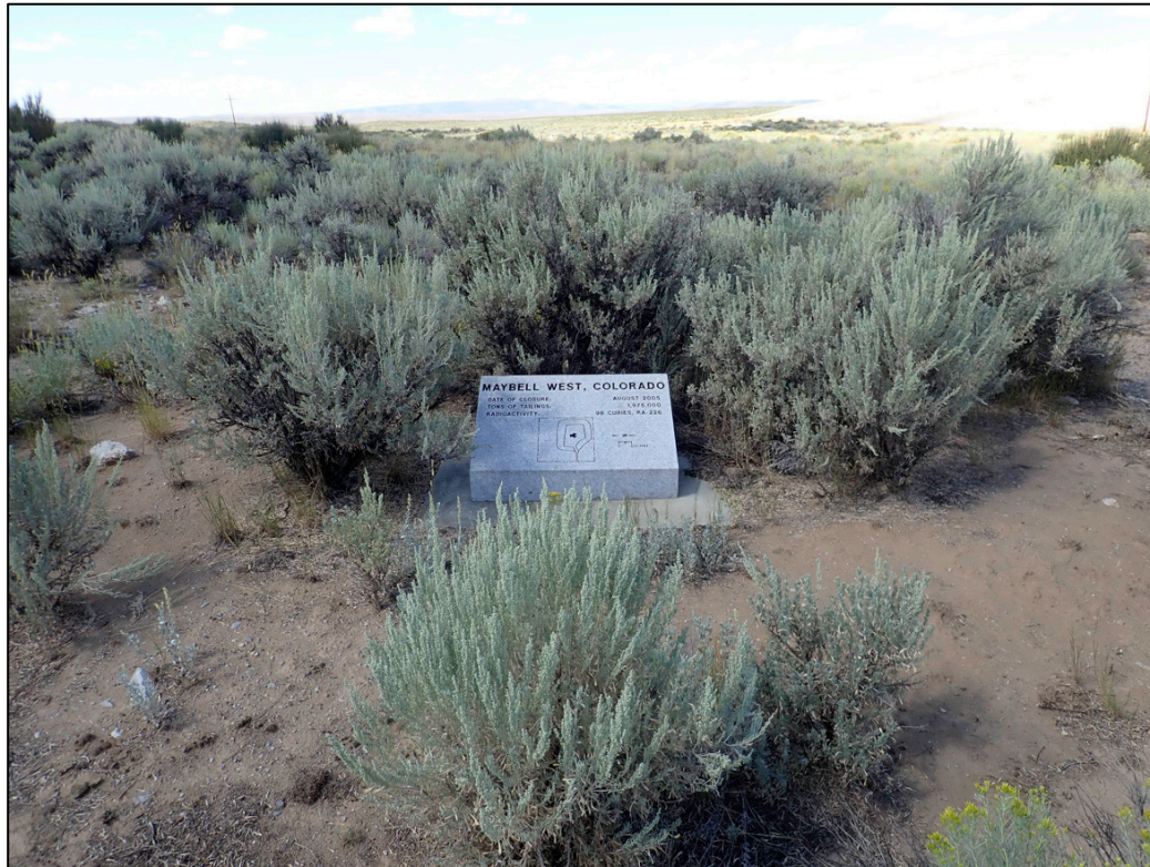
PL-2. Site Marker