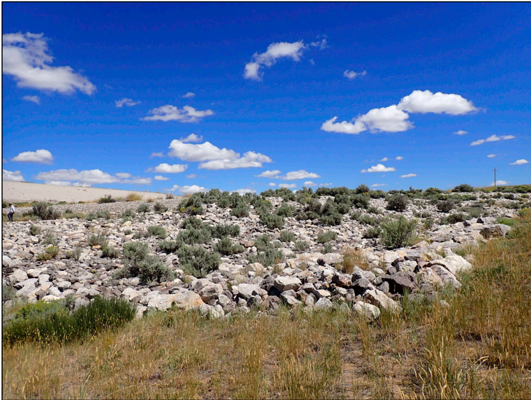
PL-13. Diversion Channel No. 2