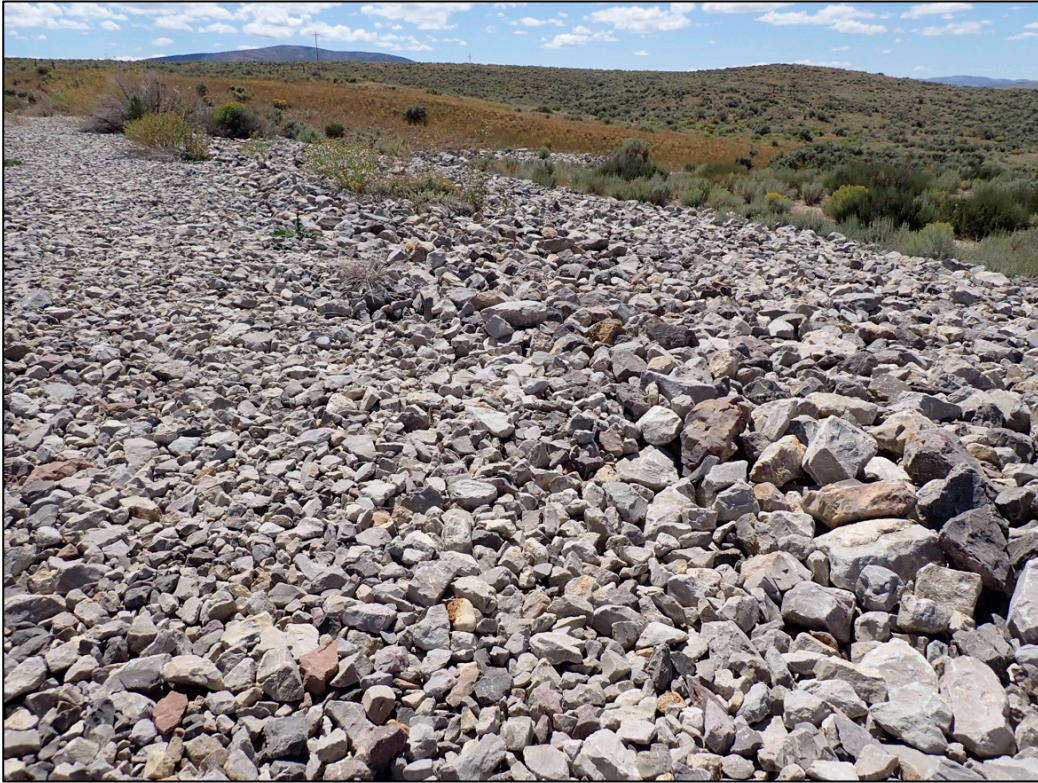
PL-9. Depressions on Crest of Ancillary Cell