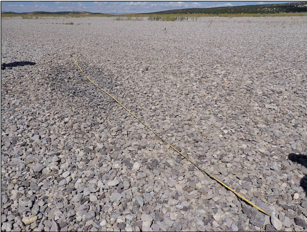
PL-4. Shallow Depression No. 2