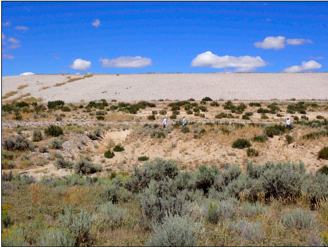
PL-15. Erosion Below Rock Berm