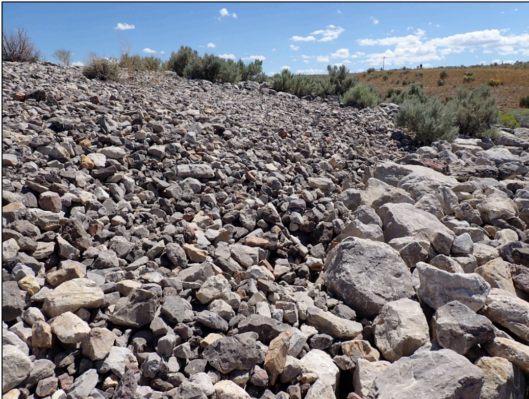
PL-10. Depressions on Toe of Ancillary Cell