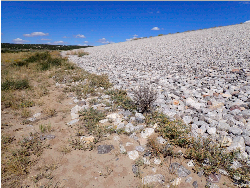
PL-7. Windblown Sediment Accumulation at Toe of Side Slope