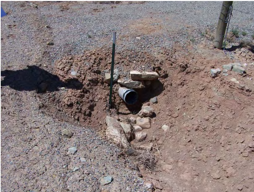
SRK 5/2008. PL-2. View of outlet with eroded 8-inch-diameter culvert (May 2008).