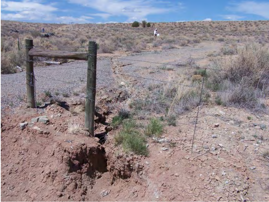
SRK 5/2008. PL-1. Gully across access road just inside entrance gate; repaired in July 2008.