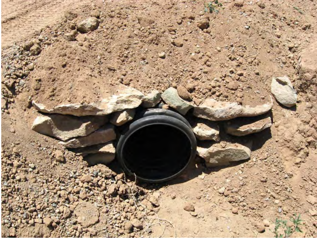
SRK 7/2008. PL-3. Outlet of newly installed 15-inch-diameter replacement culvert (July 2008).