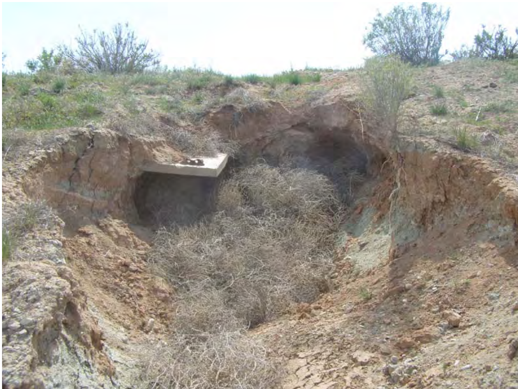
SRK 5/2008. PL-4. Primary gully below county road with 7-foot-deep vertical headcut, repaired in July 2008.