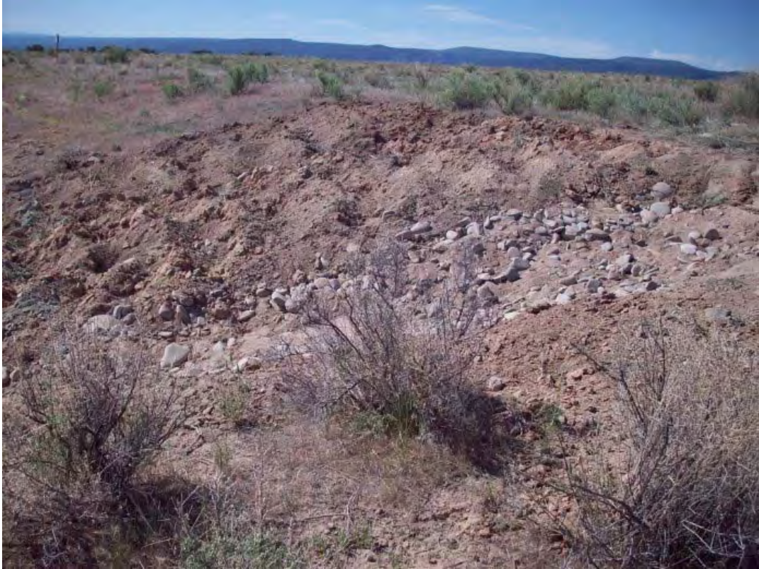
SRK 7/2008. PL-5. July 2008 erosion repair of primary gully.