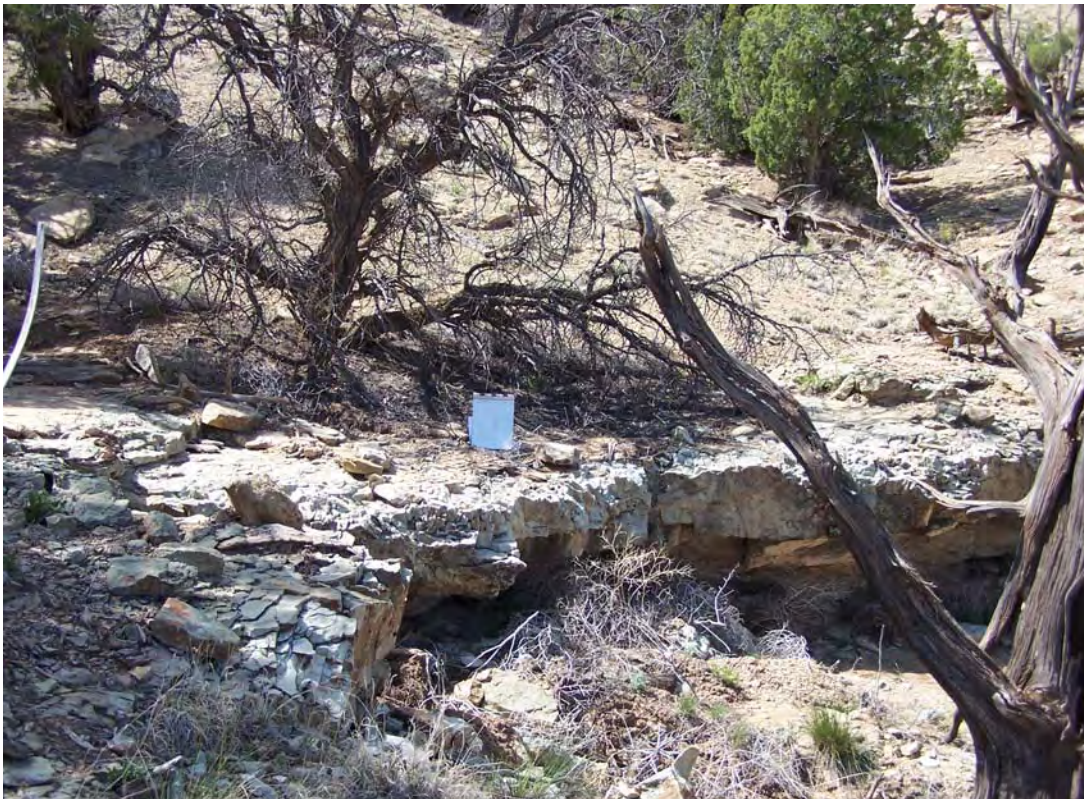
SRK 5/2008. PL-6. Kd-1 (Dakota) sandstone outcrop.