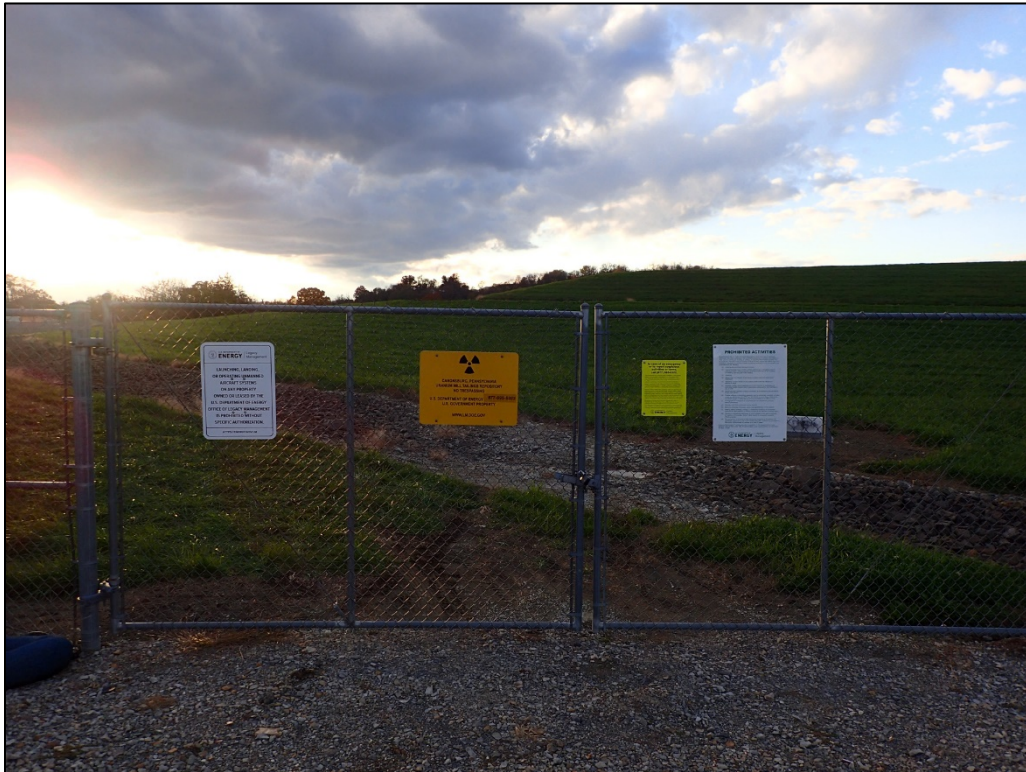
PL-1. Signage on Entrance Gate