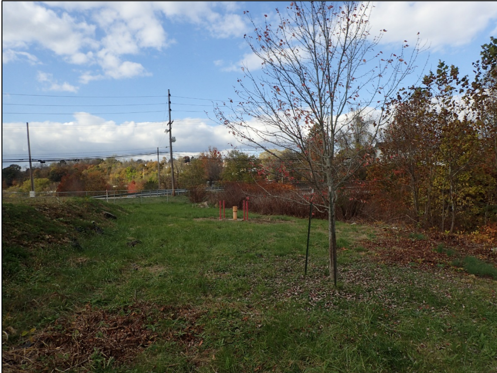
PL-13. Monitoring Well 0424