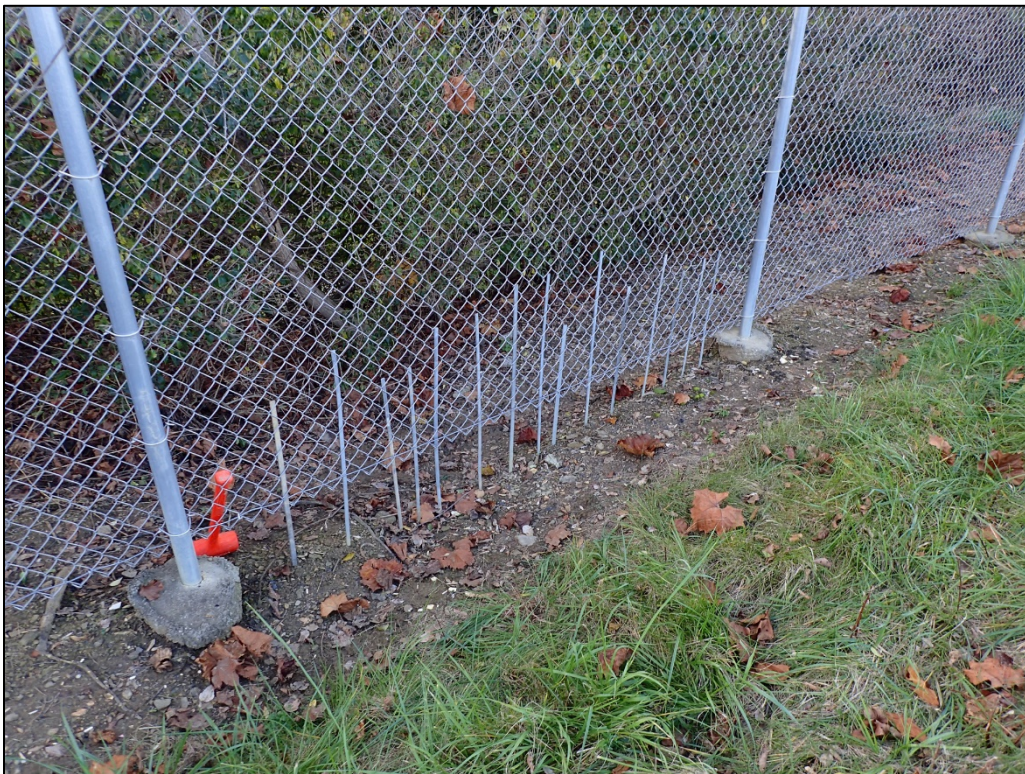
PL-4. New Slats in Fence at Erosion Area