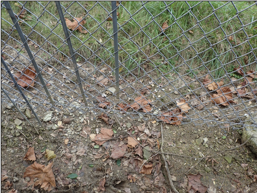
PL-3. Erosion Area Under West Fence