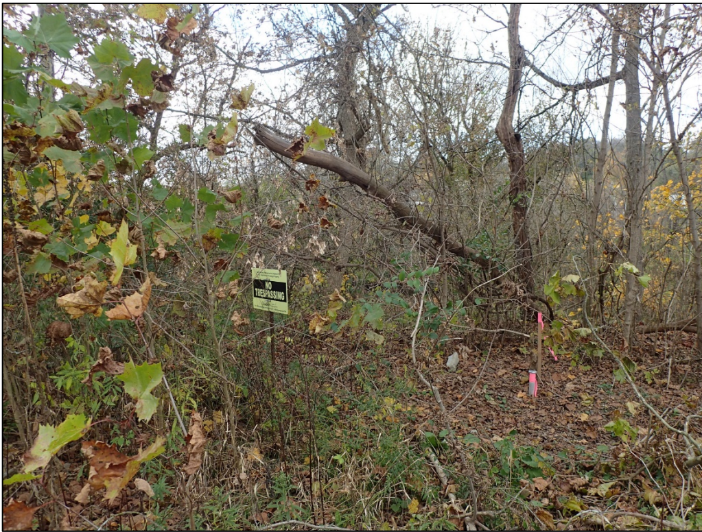
PL-6. New Southwest Boundary Monument BM-5