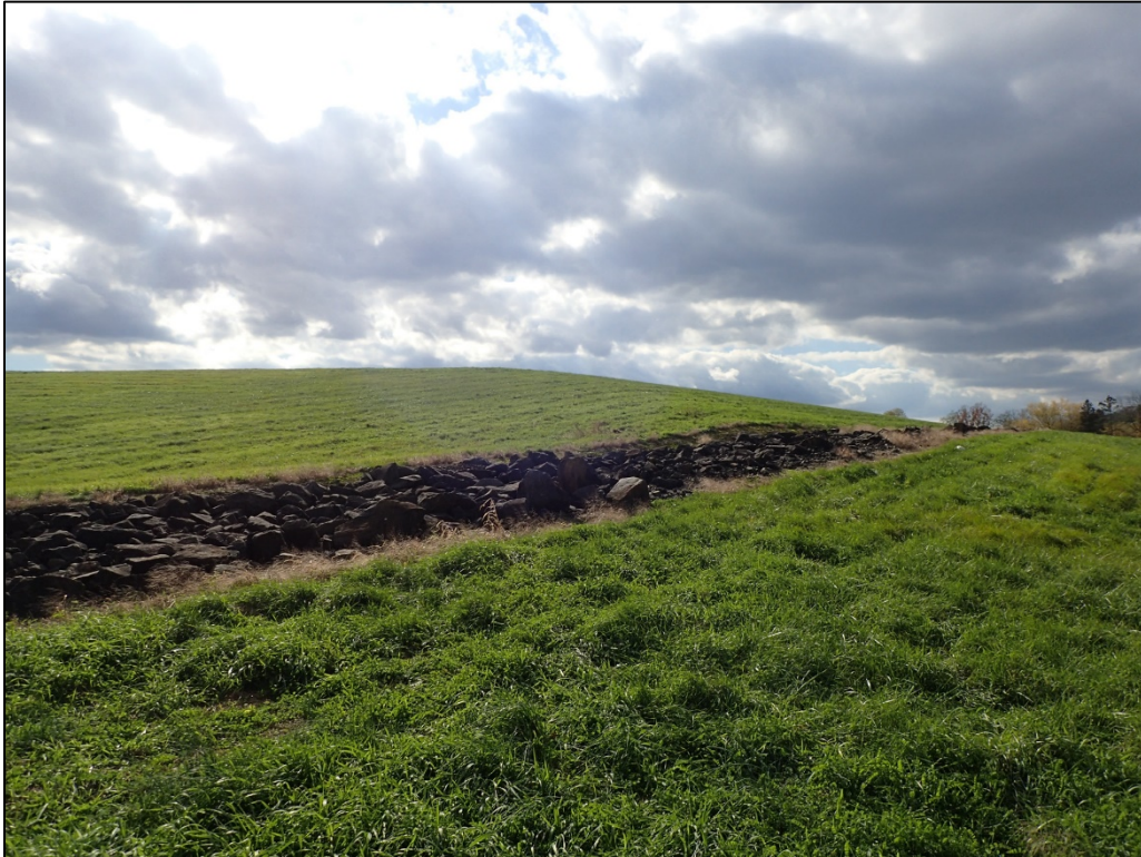
PL-9. Northwest Side of Disposal Cell