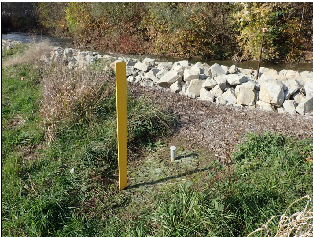
PL-8. Erosion Control Markers 2 and 2A