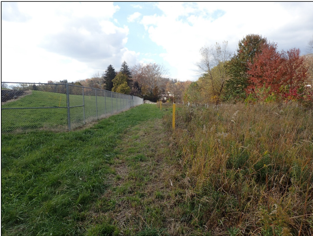
PL-12. Edge of Tall Grass Prairie and Riparian Area