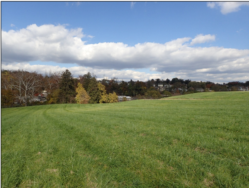
PL-10. West Side of Disposal Cell