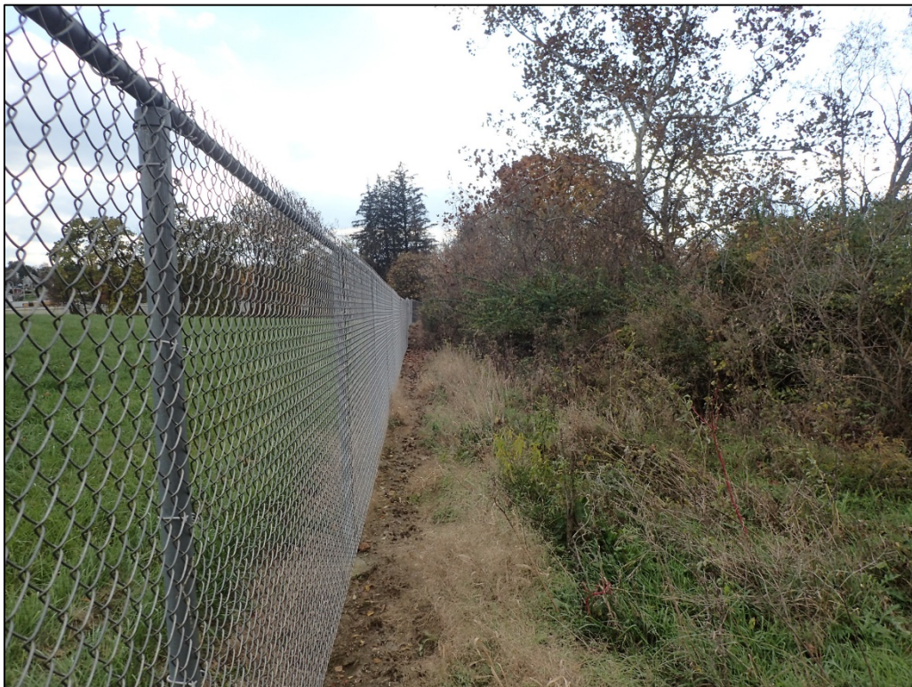
PL-2. West Fence Line