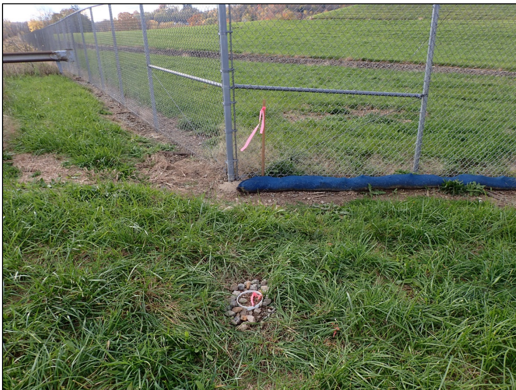
PL-7. Boundary Monument BM-3