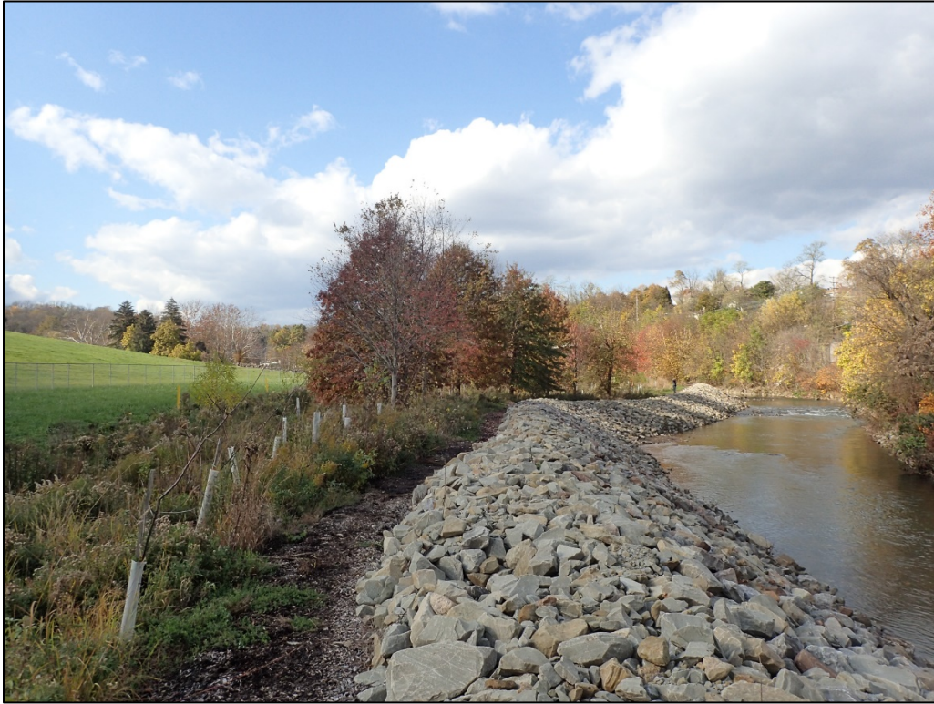
PL-11. Riparian Area and Riprap-Armored Streambank