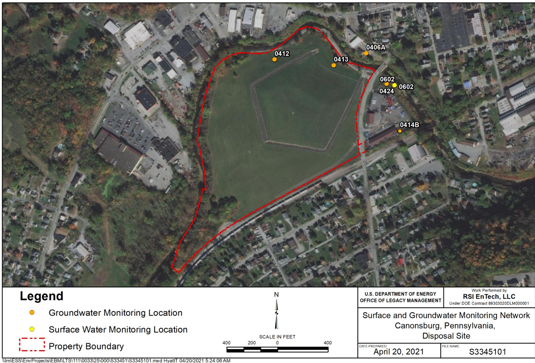
Figure 3-2. Groundwater and Surface Water Monitoring Network for the Canonsburg, Pennsylvania, Disposal Site