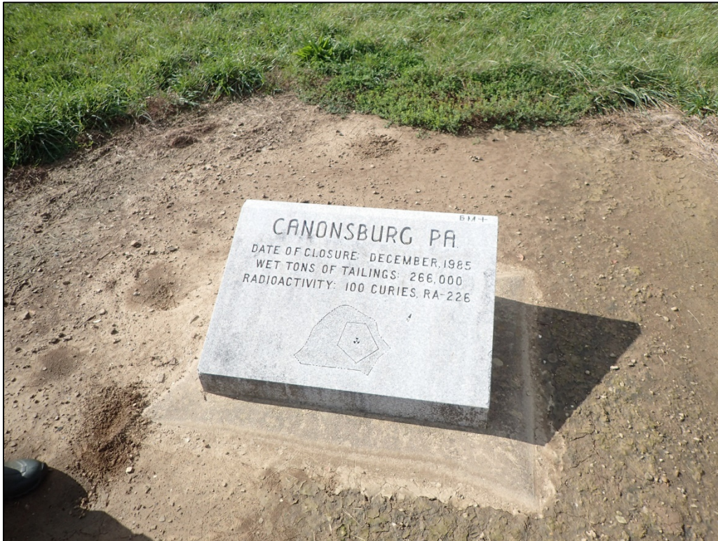
PL-5. Site Marker SMK-2