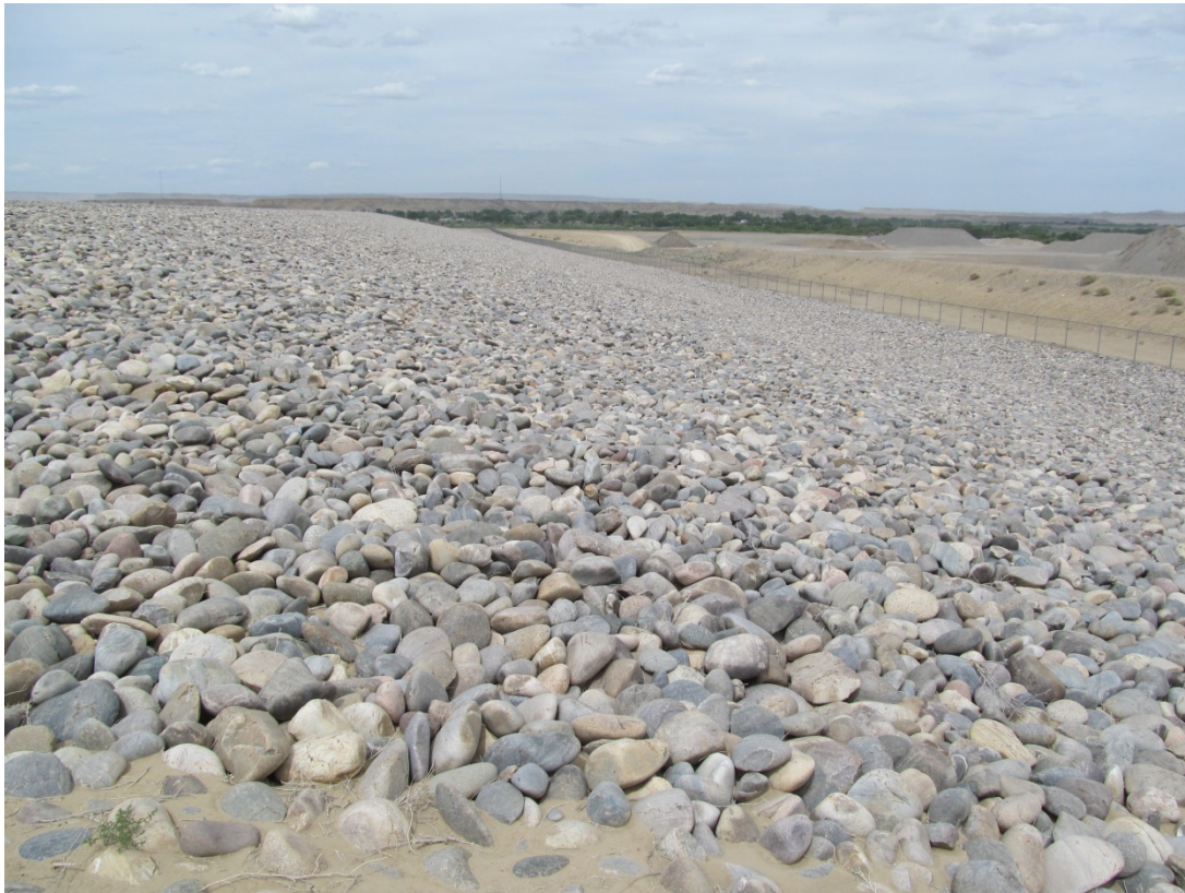
SHP 5/2013. PL-10. Southeast slope of disposal cell.