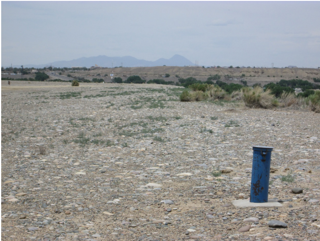
SHP 5/2013. PL-14. Terrace, view north-northeast.