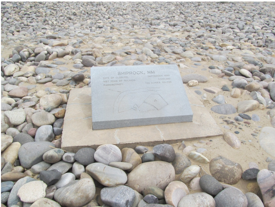
SHP 5/2013. PL-5. Site marker SMK-1.