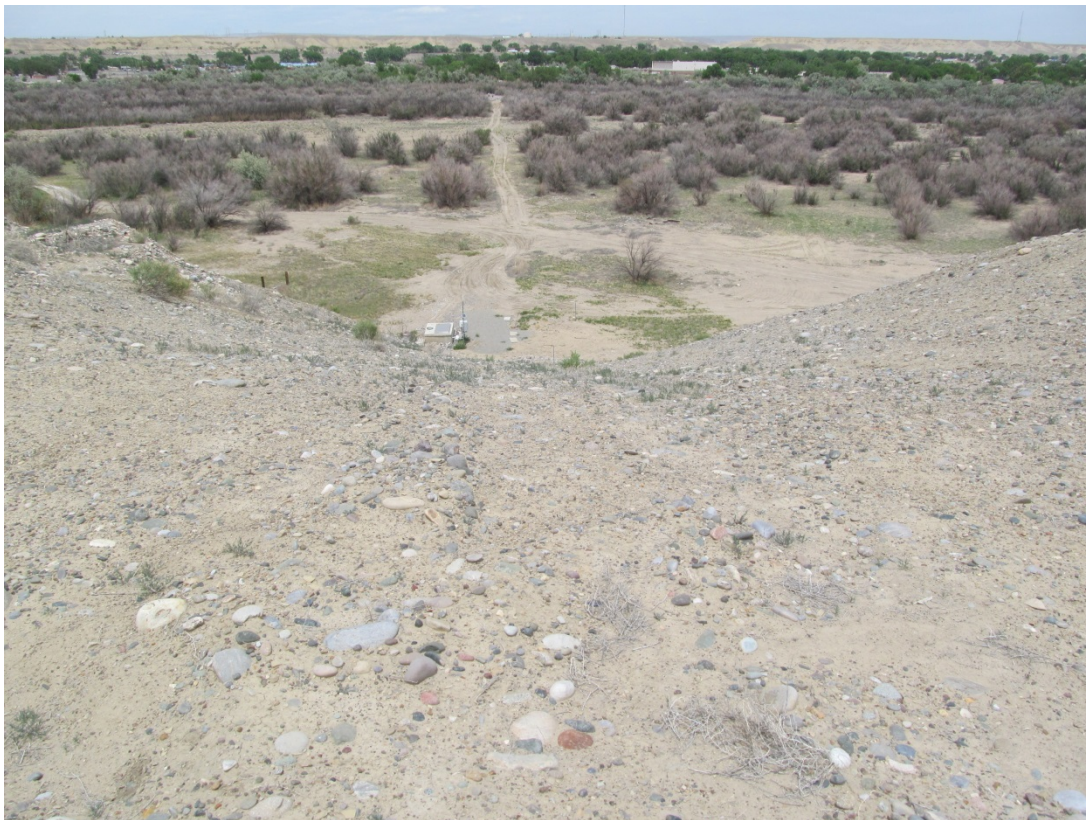
SHP 5/2013. PL-16. View down repaired section of escarpment; no new erosion.