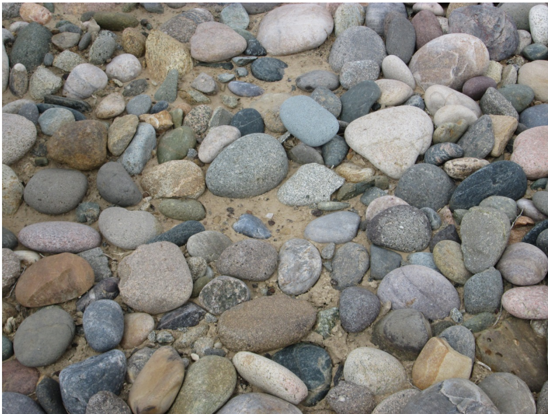
SHP 5/2013. PL-12. Sediment deposition on cell top.