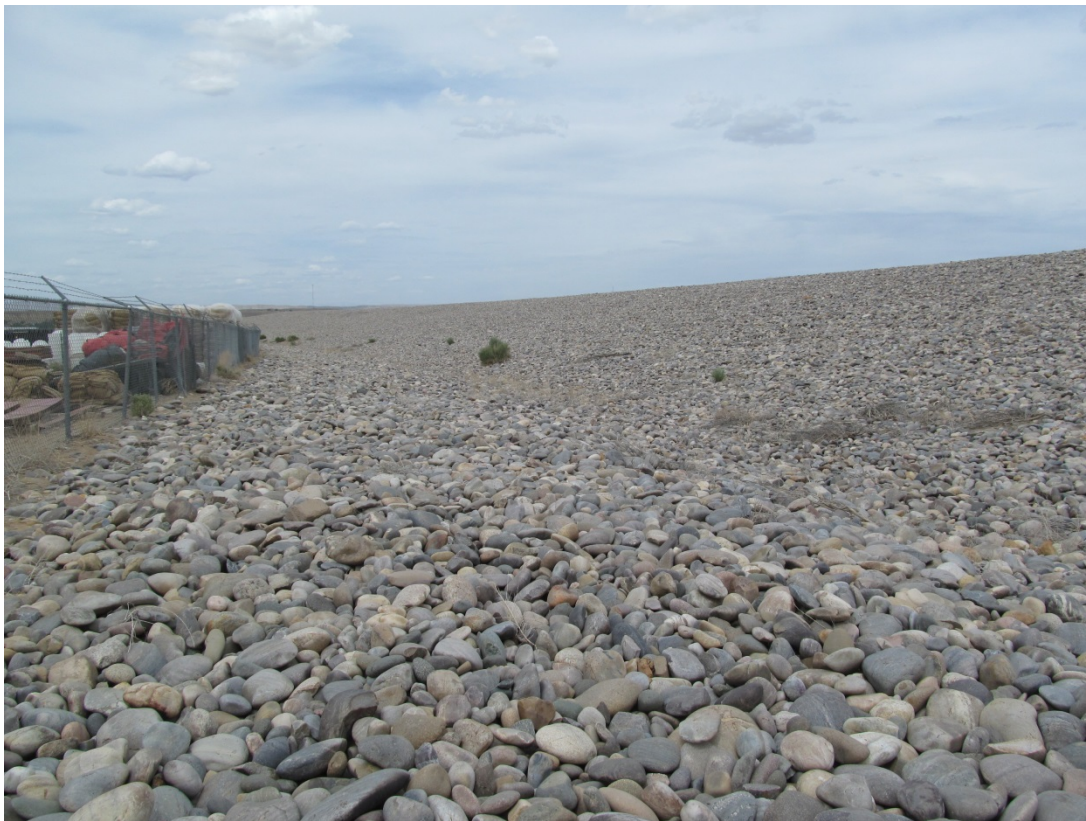
SHP 5/2013. PL-11. Northwest slope of disposal cell showing vegetation.