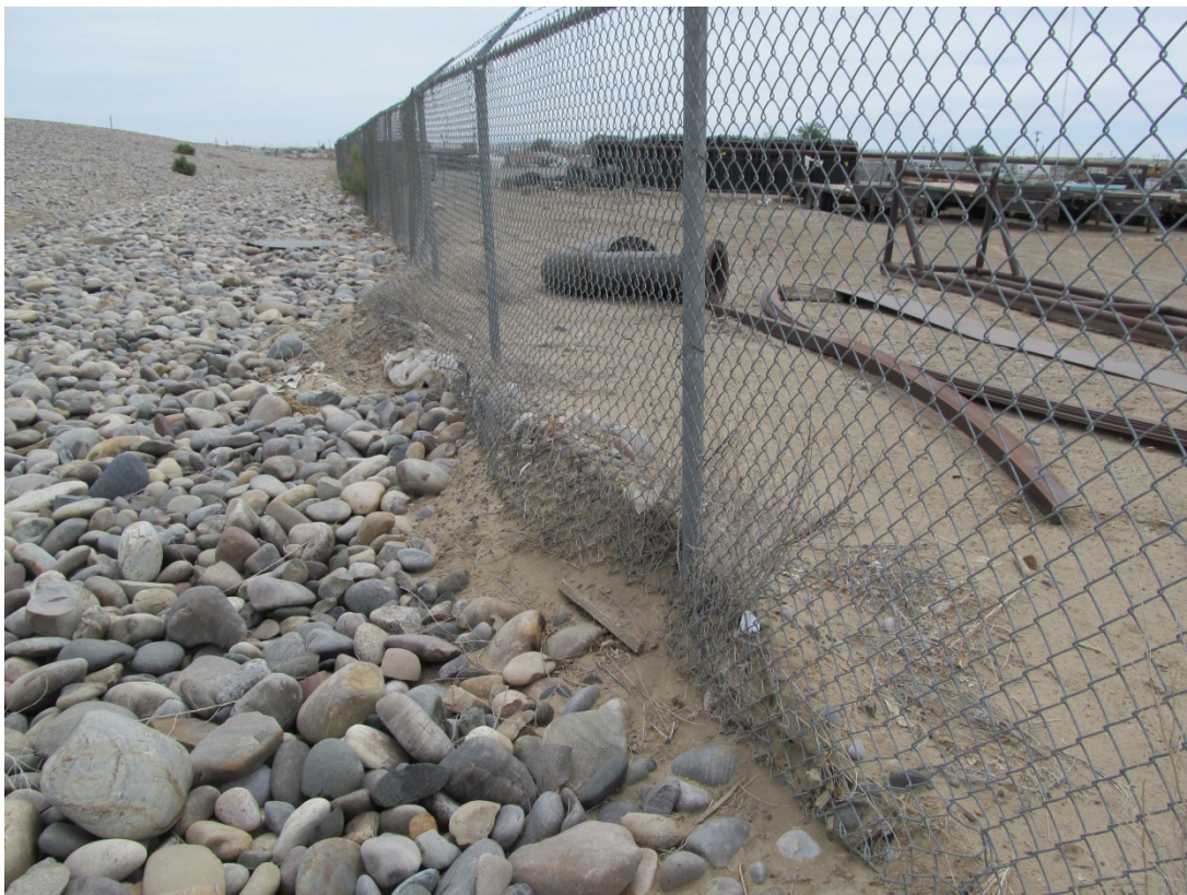
SHP 5/2013. PL-3. Dirt pushed under fence between P11 and P12.