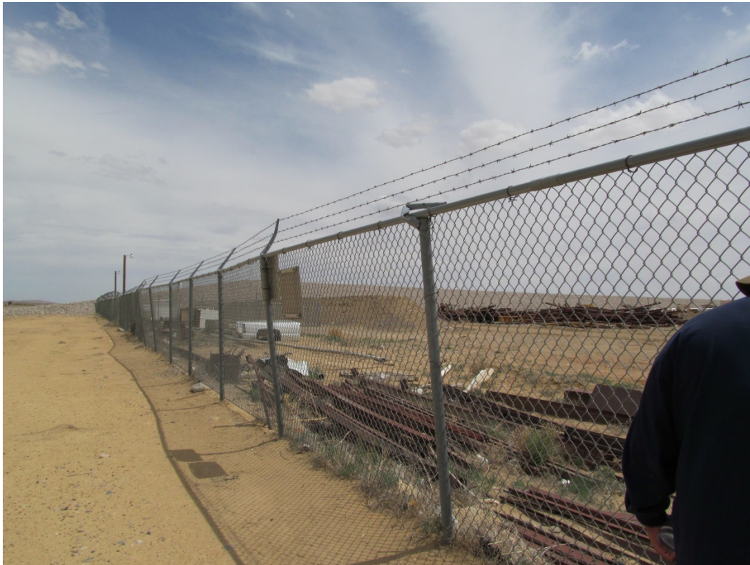
SHP 5/2013. PL-2. Damaged fence line near perimeter sign P15.