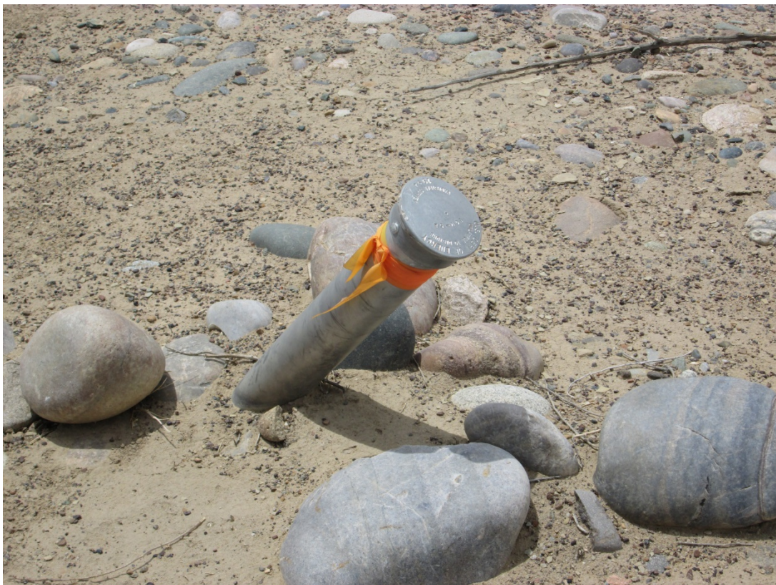
SHP 5/2013. PL-9. Erosion marker ECM-5A, bent but functional.