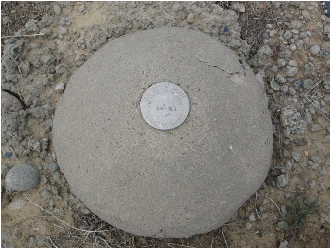
SHP 5/2013. PL-6. Survey monument SM-1.