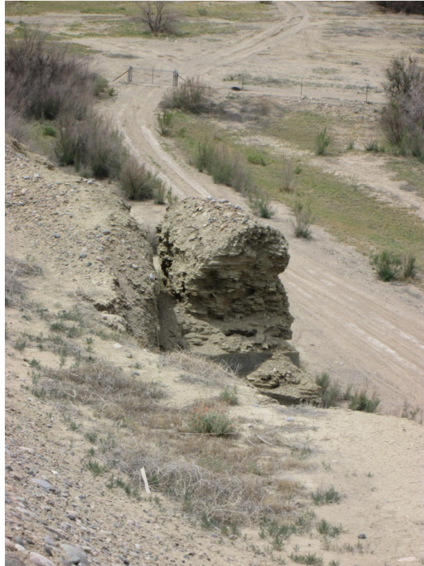
SHP 5/2013. PL-15. Terrace escarpment pedestaling; piping was also observed.