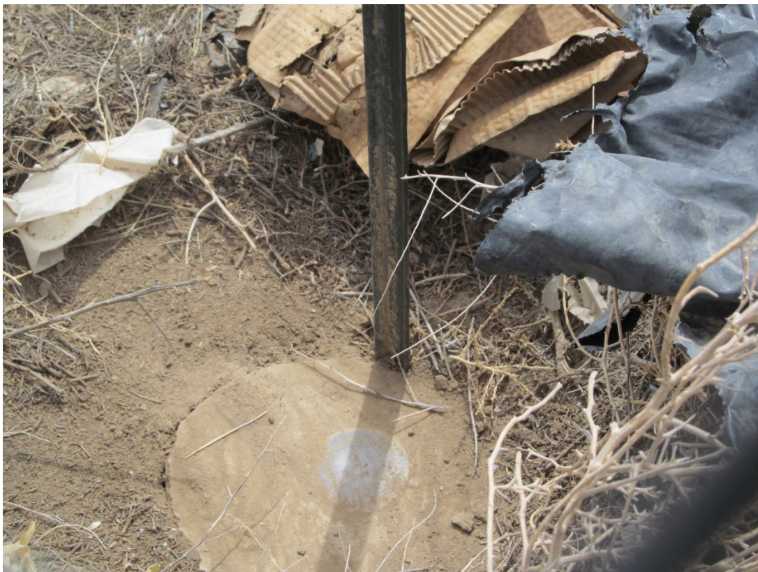
SHP 5/2013. PL-7. Boundary monument 2 with reference post..