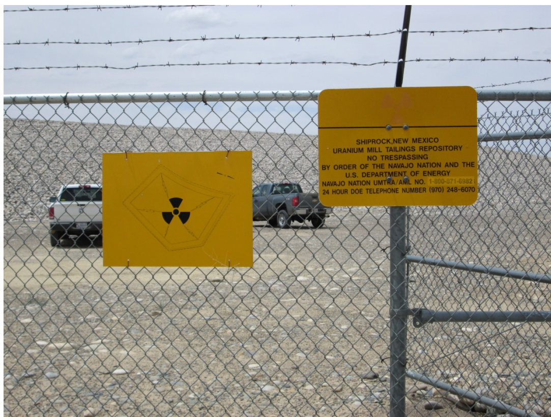
SHP 5/2013. PL-1. Entrance sign at main access gate.

*The azimuth is not given because the photo was taken at close range.