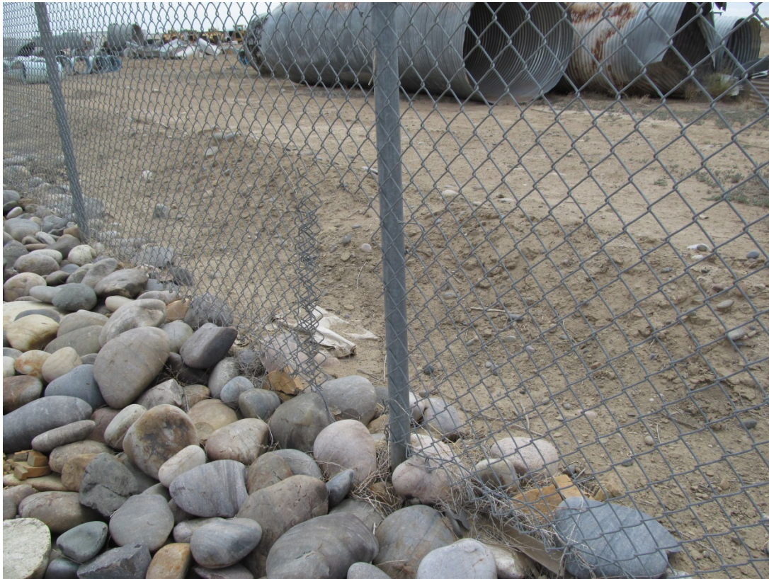
SHP 5/2013. PL-4. Hole cut into fence near perimeter sign P14.