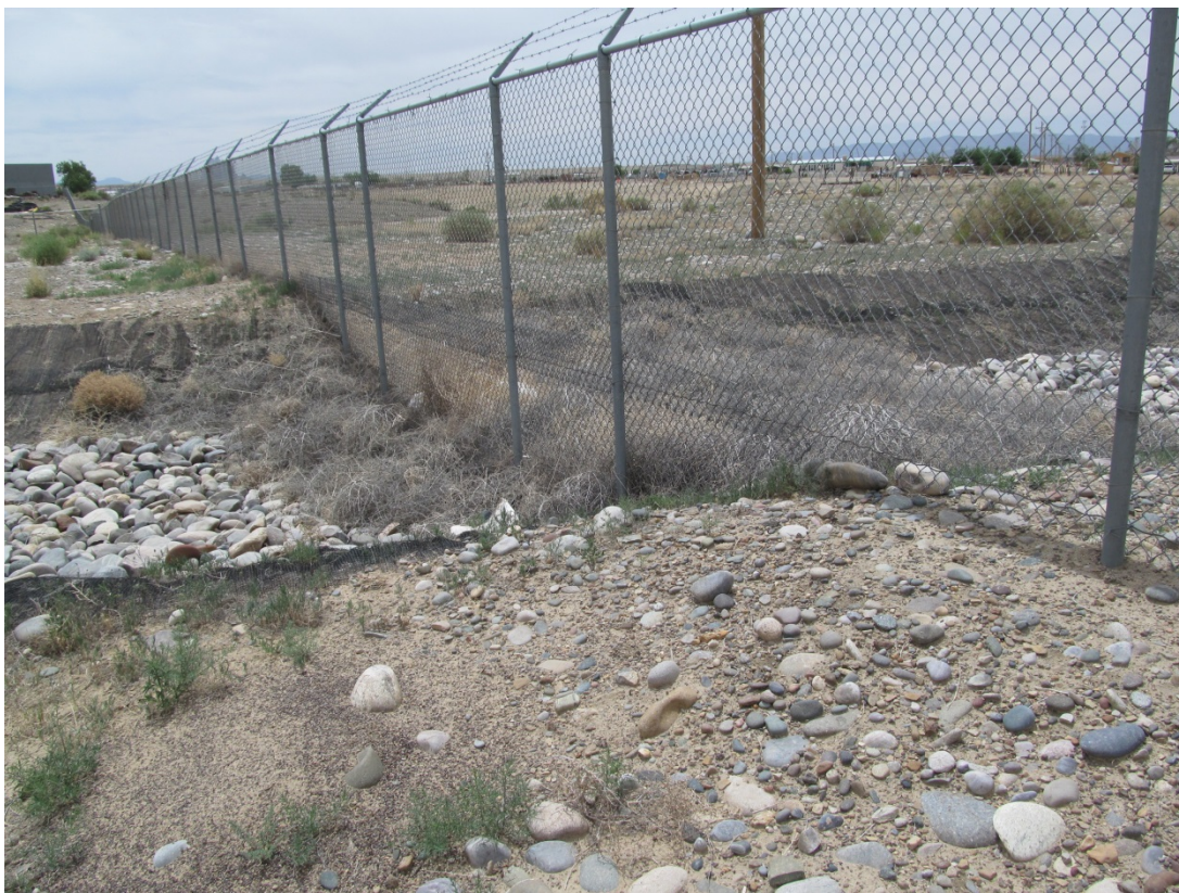
SHP 5/2013. PL-13. Fence across outflow channel with debris buildup.