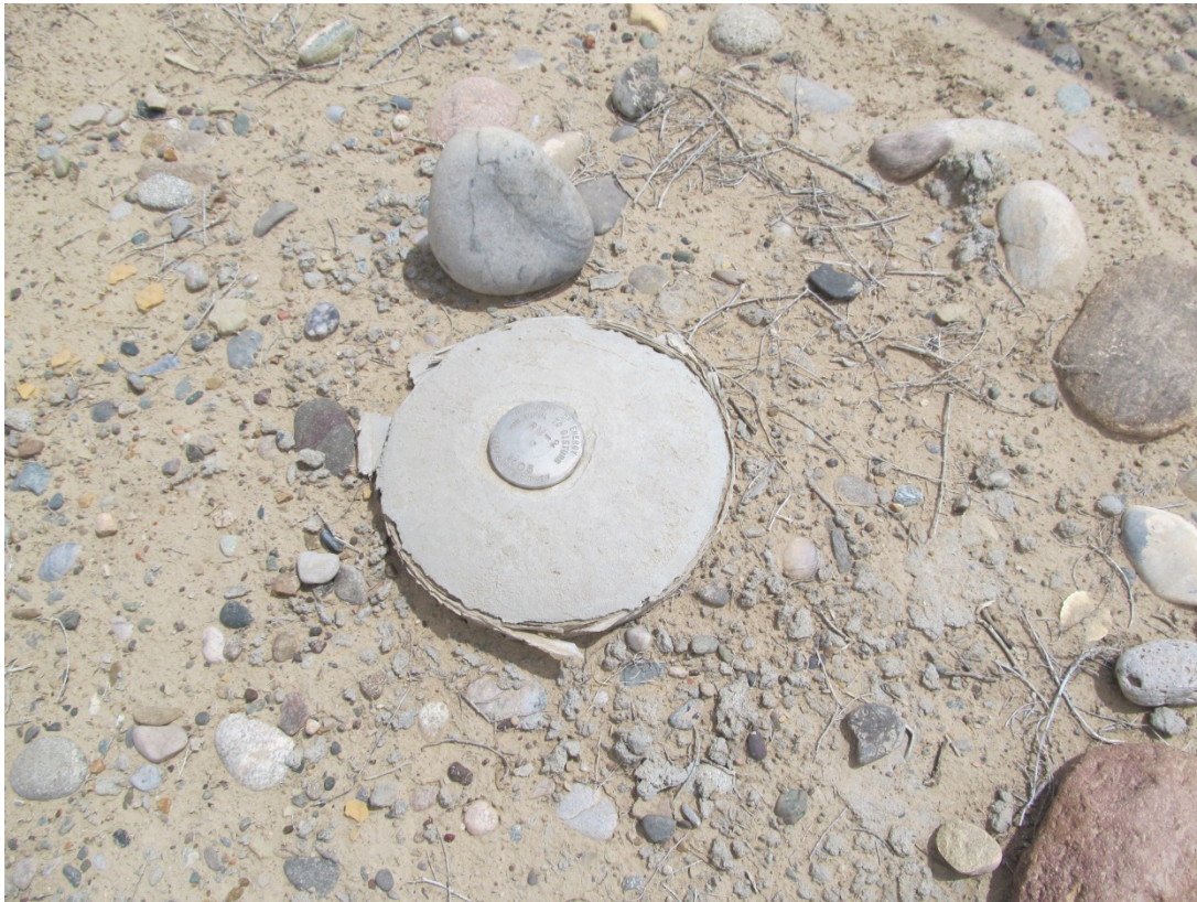
SHP 5/2013. PL-8. "Reference monument RM-2, installed in 2013.