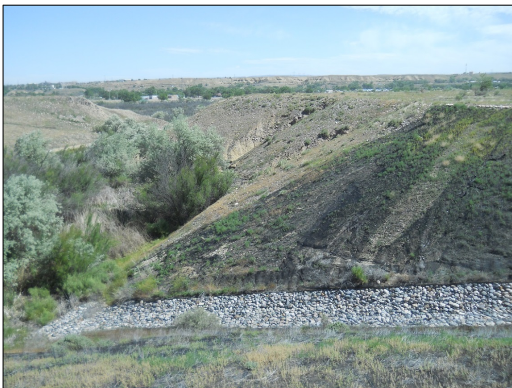
PL-14. Replaced Erosion Control Fabric with New Areas Needing Repair