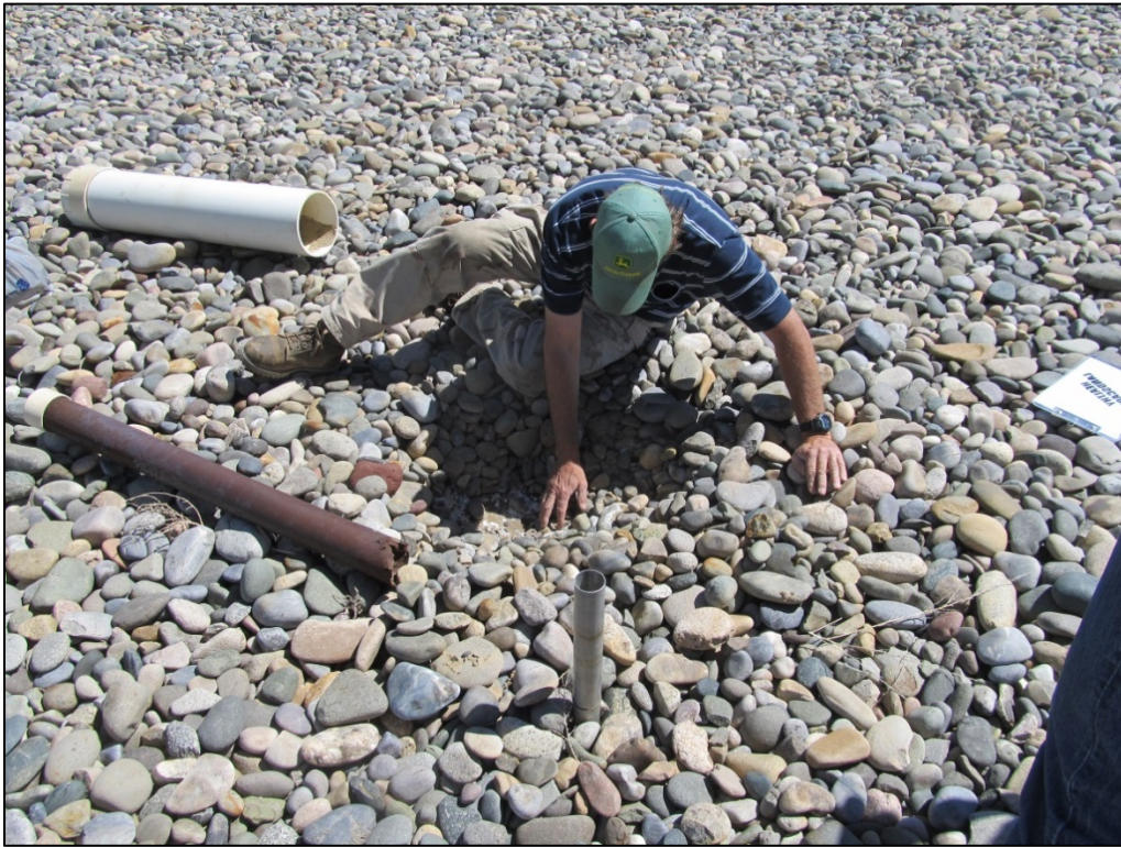
PL-11. Neutron Hydroprobe Port on Disposal Cell Top Slope Where Dug-Out Hole Previously Was Filled with Water