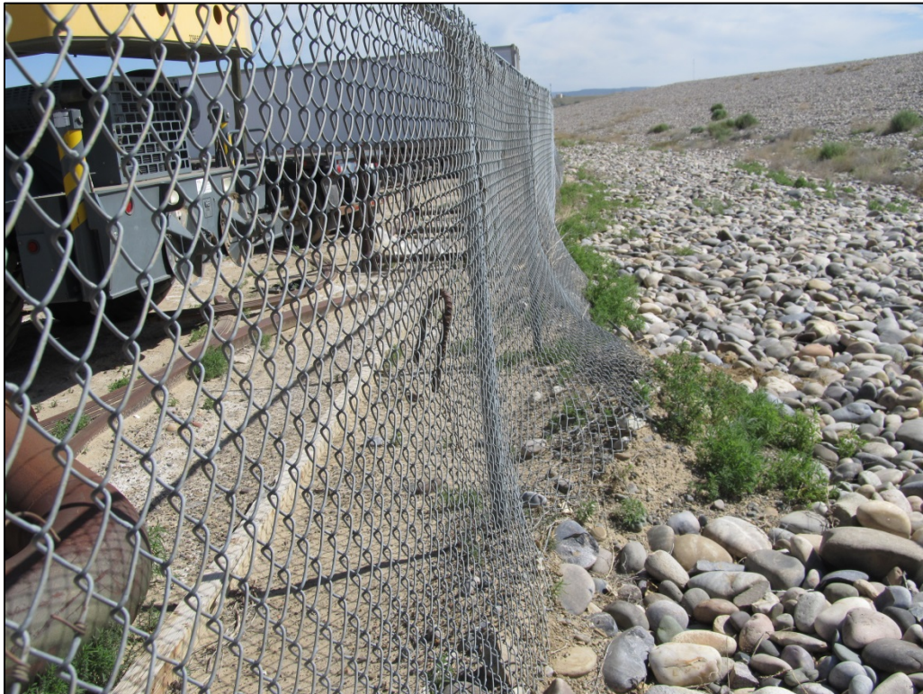
PL-5. Bent Fence Fabric on West Perimeter Fence Along NECA Yard Between Perimeter Signs P11 and P12