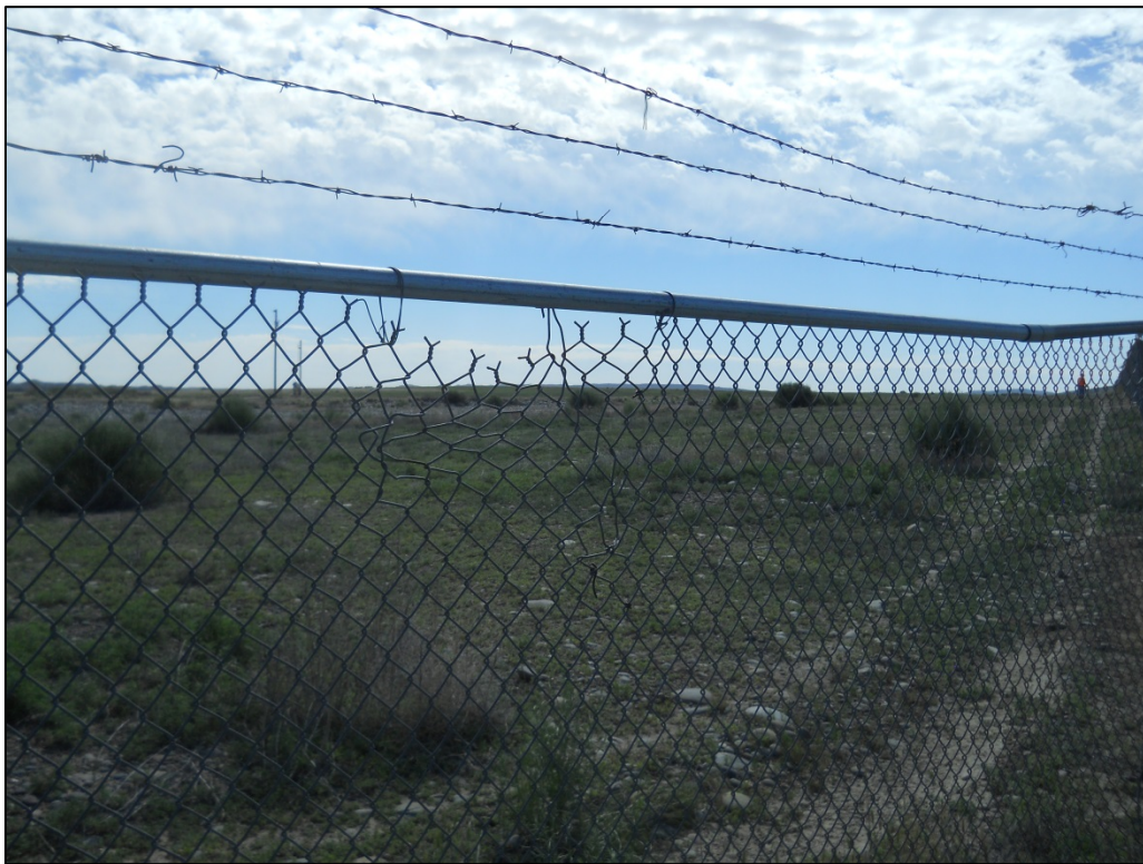
PL-4. North Perimeter Fence Along NECA Yard Near Perimeter Sign P15 with Gap on Top