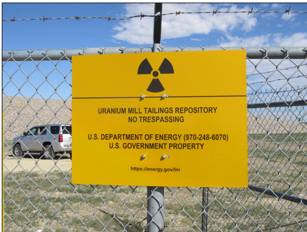
PL-1. Entrance Sign Showing New Legacy Management Website Address