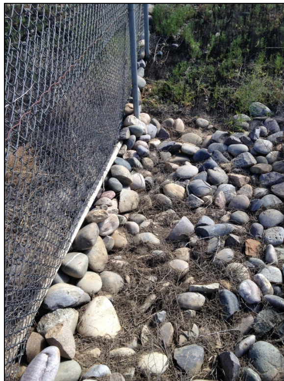
PL-12. Sediment Buildup and Low Spot in Outlet Channel Before Perimeter Fence