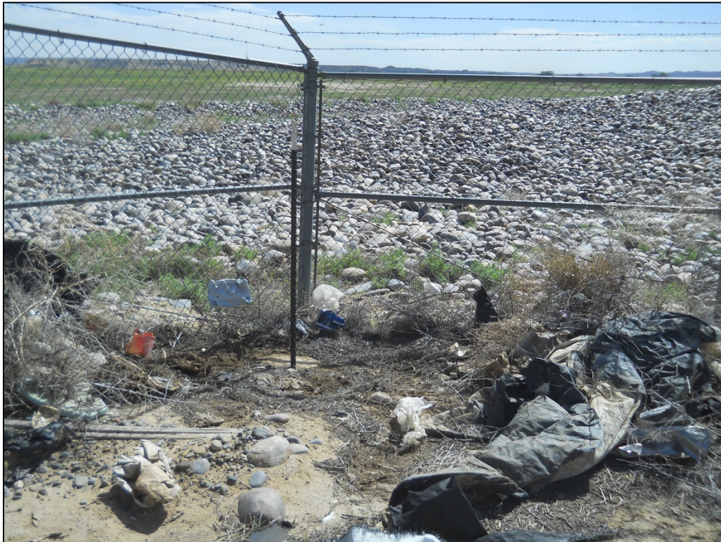
PL-7. Trash Buildup Along Northwest Perimeter Fence