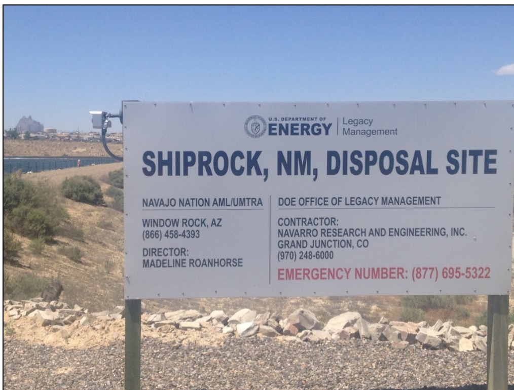
PL-13. New Evaporation Pond Entrance Sign