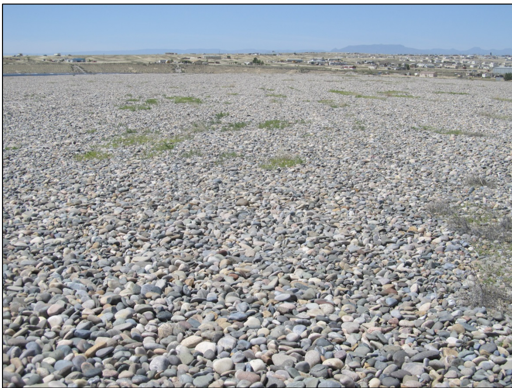
PL-10. Scattered Vegetation on Disposal Cell Top Slope