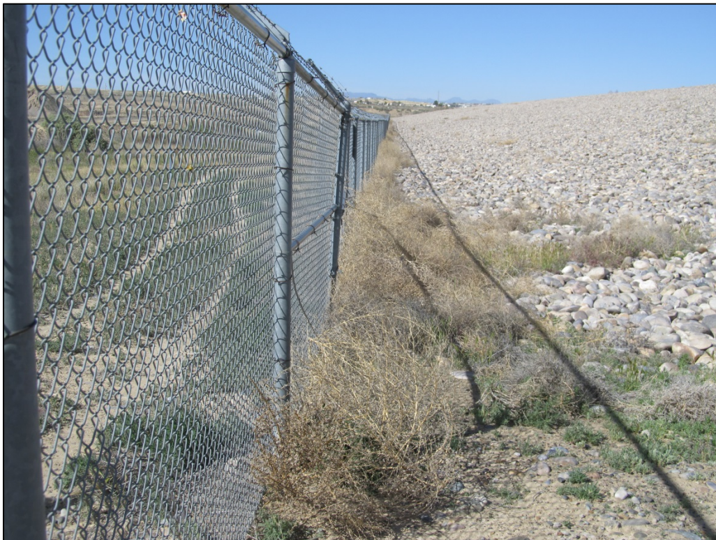
PL-6. Tumbleweed Buildup Along Southeast Perimeter Fence