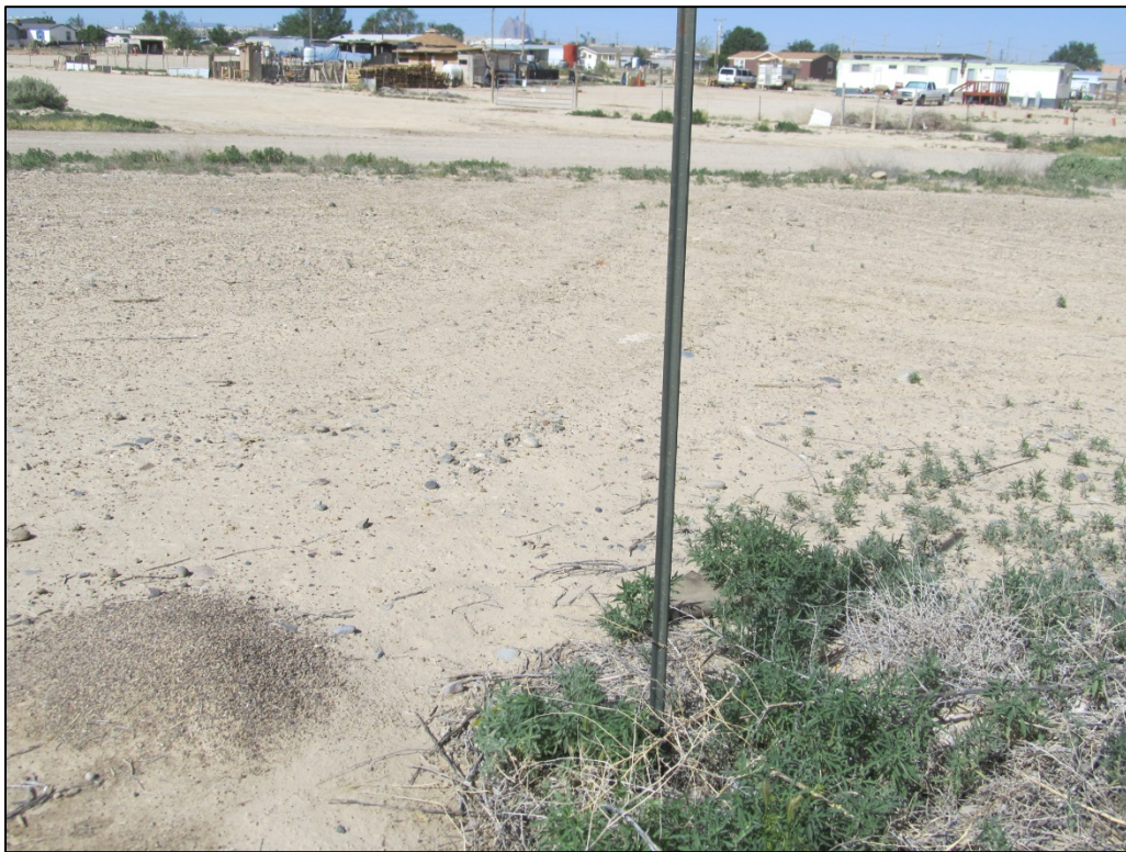
PL-8. Boundary Monument BM-4 Covered by Vegetation and Sediment (Later Uncovered)