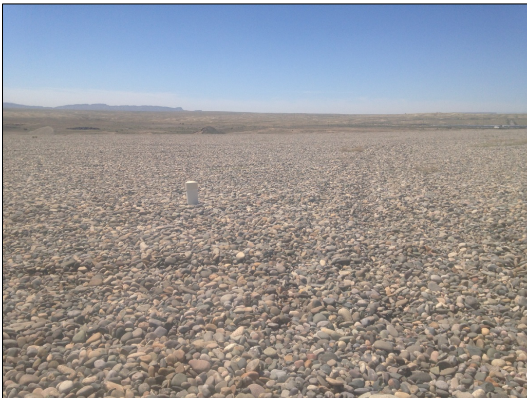
PL-9. Settlement Plate and Vehicle Tracks on Disposal Cell Top Slope