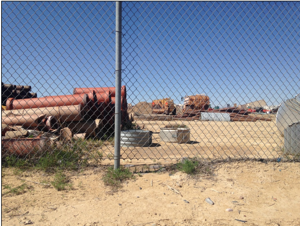
PL-3. North Perimeter Fence Along NECA Yard Near Perimeter Sign P15 with Gap Underneath