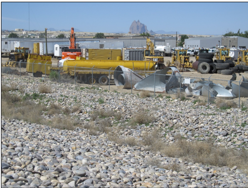
PL-2. Perimeter Fence Along NECA Yard