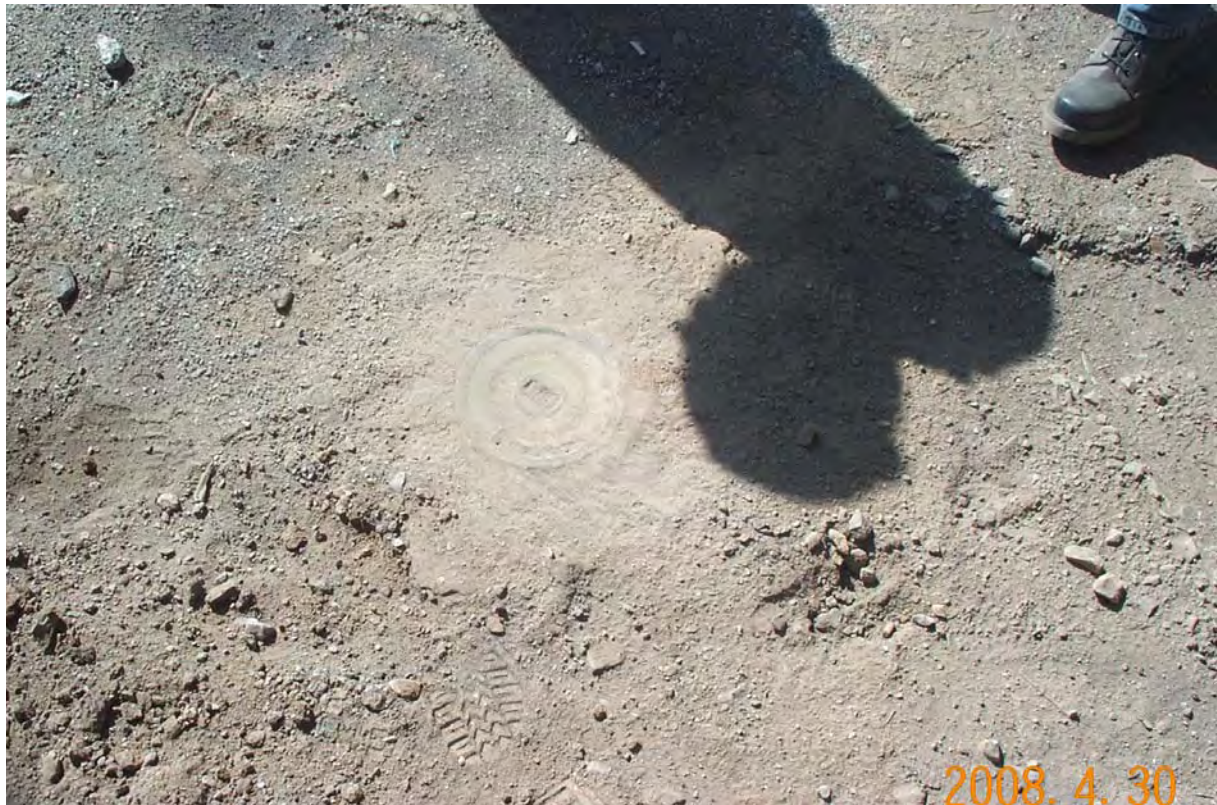
HAL 4/2008. PL-10. Monitor Well at OBS6 location.