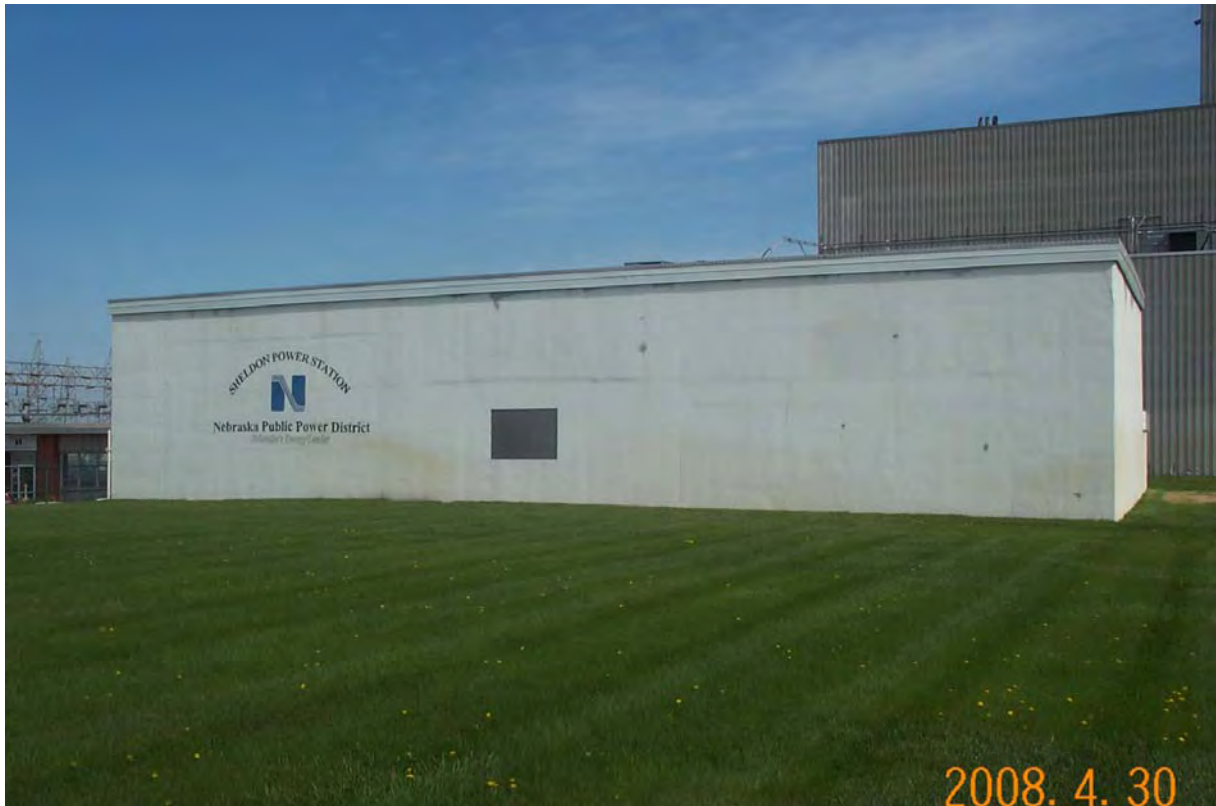
HAL 4/2008. PL-3. South side of IHX Building.