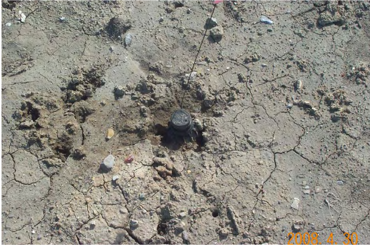
HAL 4/2008. PL-5. Exposed sprinkler head.