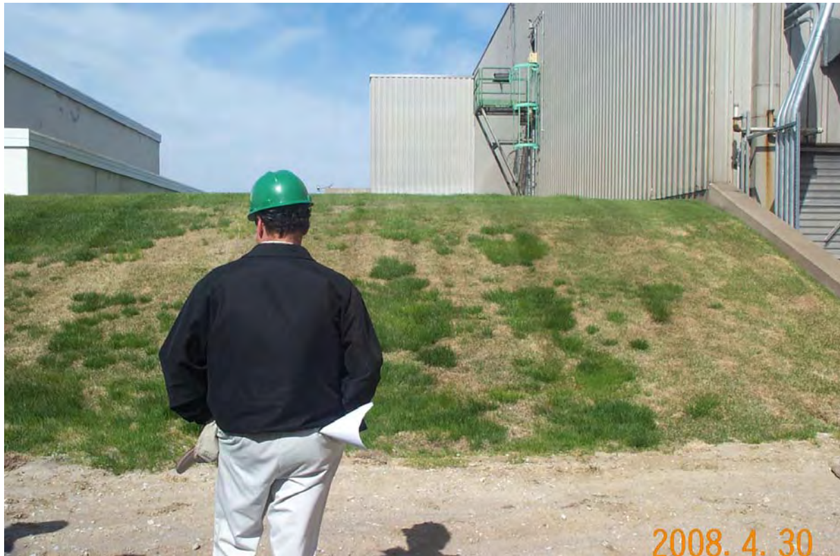
HAL 4/2008. PL-6. Bare grass areas in northeast corner of grass covered mound.