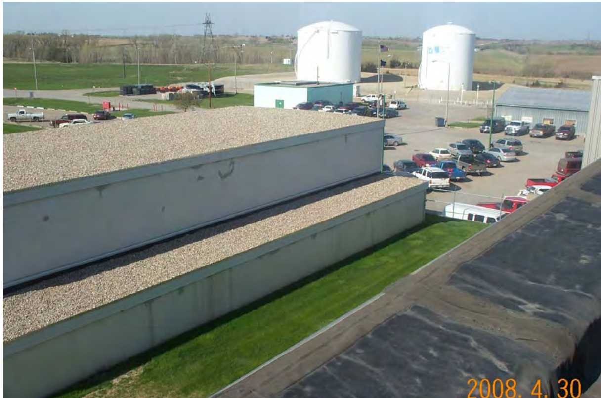
HAL 4/2008. PL-2. Roof of IHX Building.