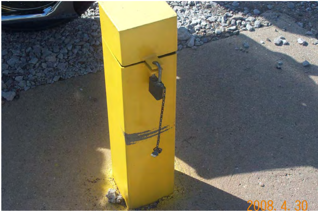
HAL 4/2008. PL-7. Monitor Well OBS-4, free hanging chain on lock.