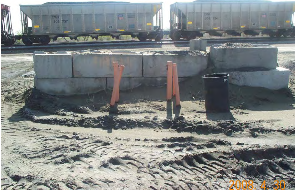
HAL 4/2008. PL-11. Monitor Wells OBS7B and OBS7C.