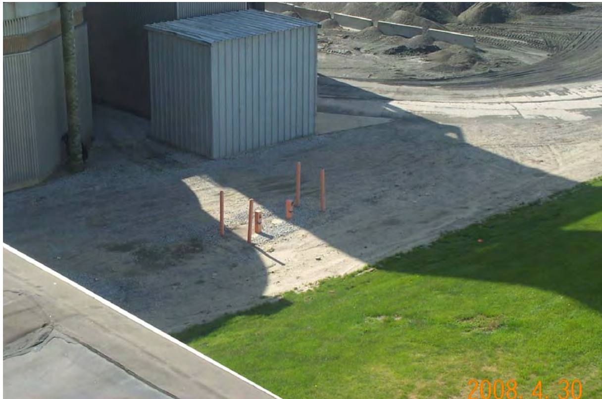
HAL 4/2008. PL-8. Monitor Wells OBS1A and OBS1B.