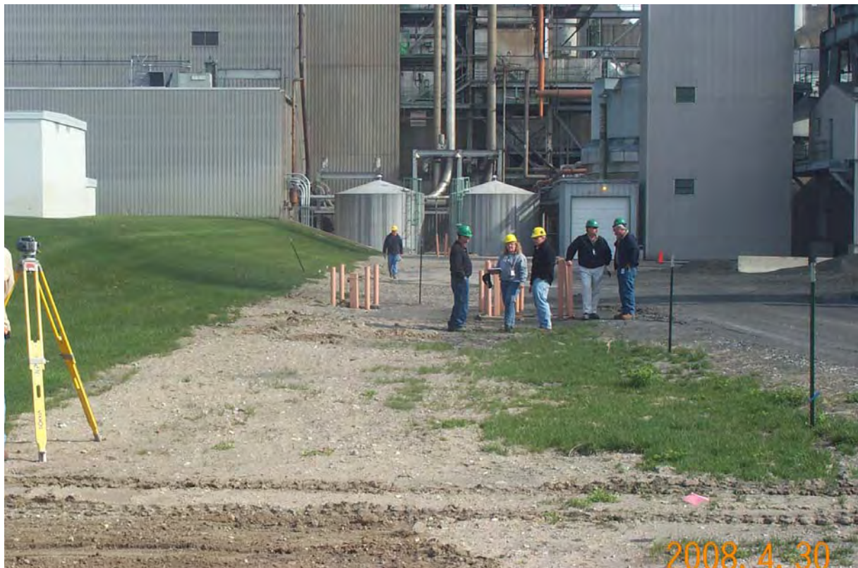
HAL 4/2008. PL-4. Looking north along east side of grass-covered mound.