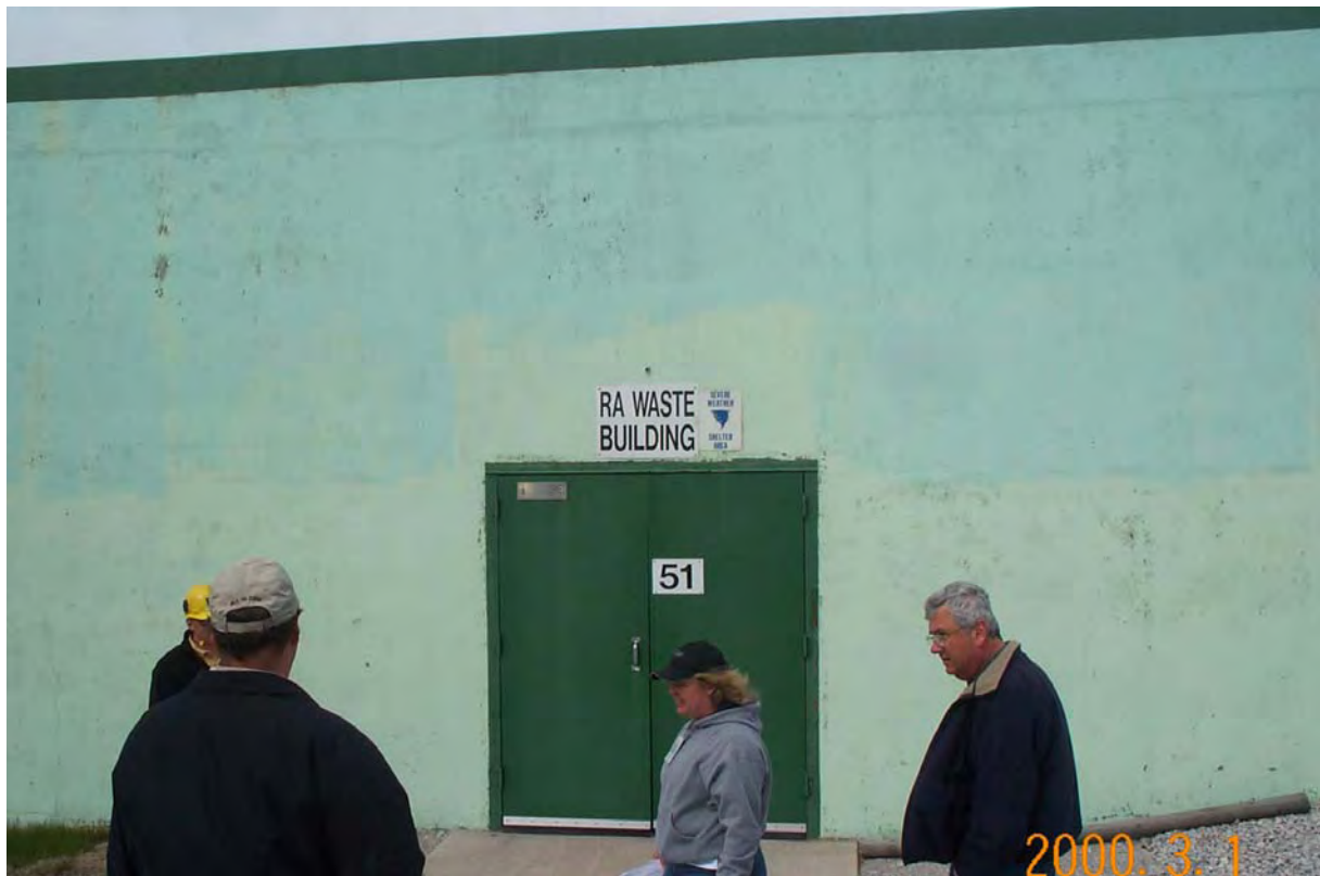
HAL 4/2008. PL-12. Entrance to RA Building.