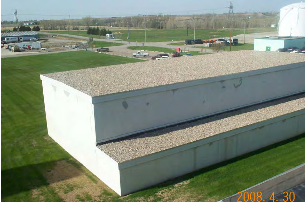
HAL 4/2008. PL-1. Roof of IHX Building.