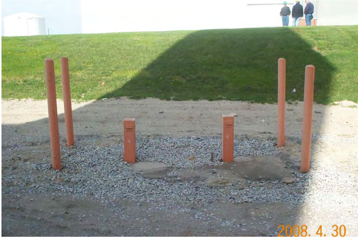
HAL 4/2008. PL-9. Monitor Wells OBS1A and OBS1B.