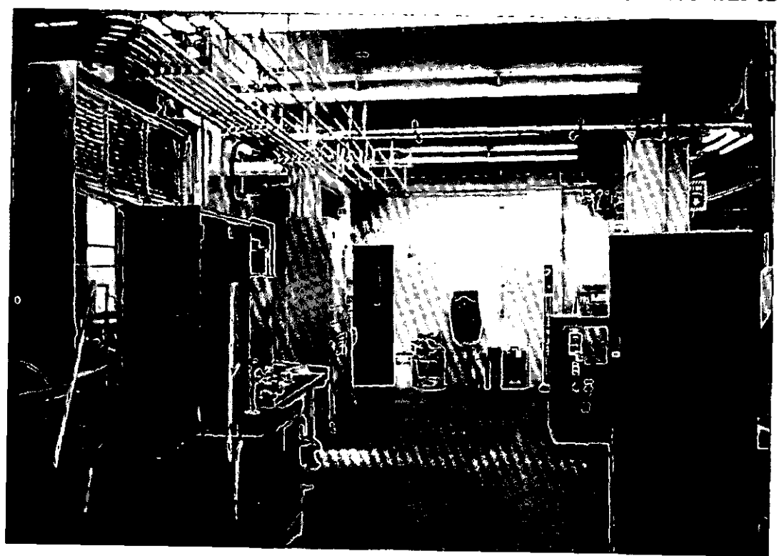
Fig. 4. View looking west in survey area at ALCOA Research Laboratory.