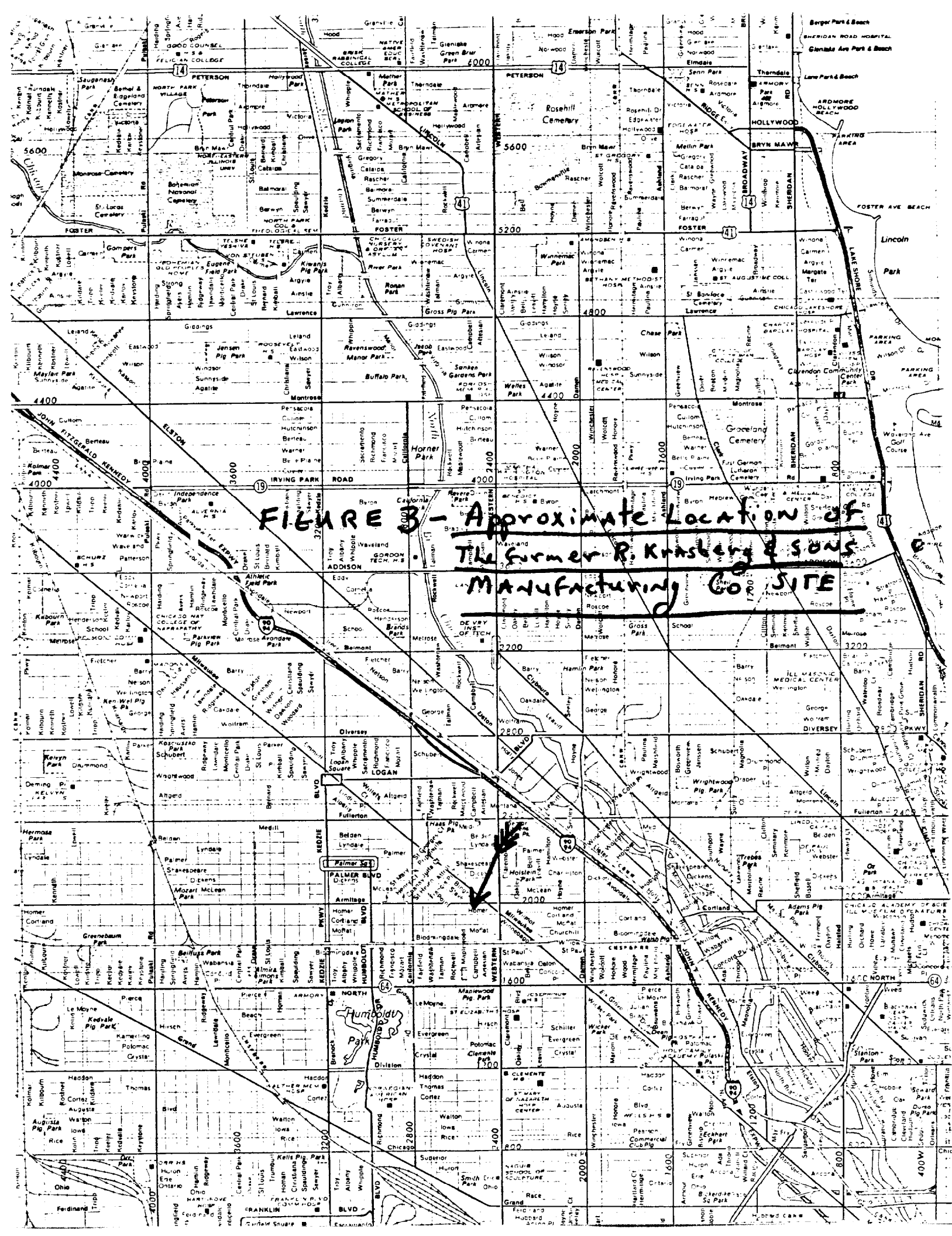
FIGURE B - Approximate Location of THE Former R. KRASBERG & SONS MANUFACTURING CO. SITE