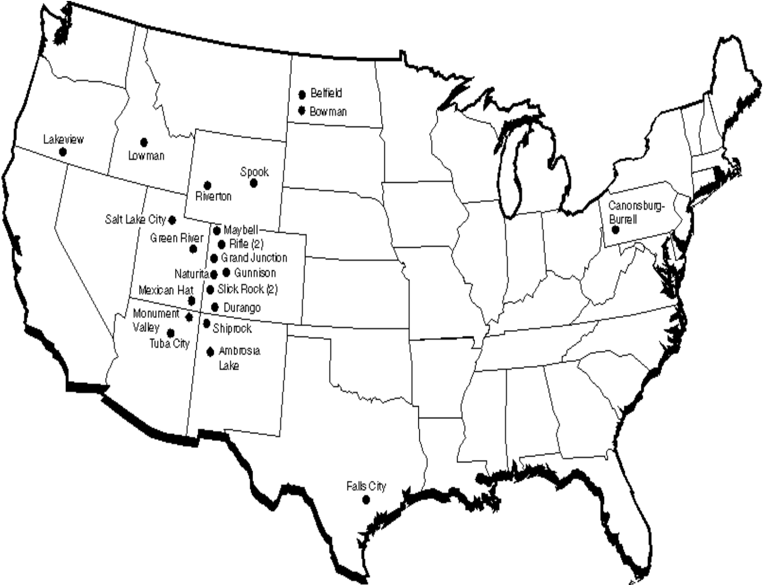
Figure 1. Locations of the Former Uranium-Ore Processing Sites