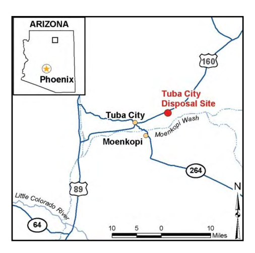
Location of the Tuba City Disposal Site

The Tuba City site is within the Navajo Nation and in close proximity to the Hopi Reservation. The site is approximately 5 miles east of Tuba City and 85 miles northeast of Flagstaff, Arizona. Land near the site is used for grazing; adjacent land was used for dry and irrigated farming, and historically, rural residential purposes. There is no known domestic, industrial, or agricultural groundwater use from the contaminated region of the aquifer within the site. Nearby residences receive water from the Navajo Tribal Utility Authority. This water comes from a well in the bedrock aquifer approximately 1.5 miles northwest (hydraulically upgradient) of the site.