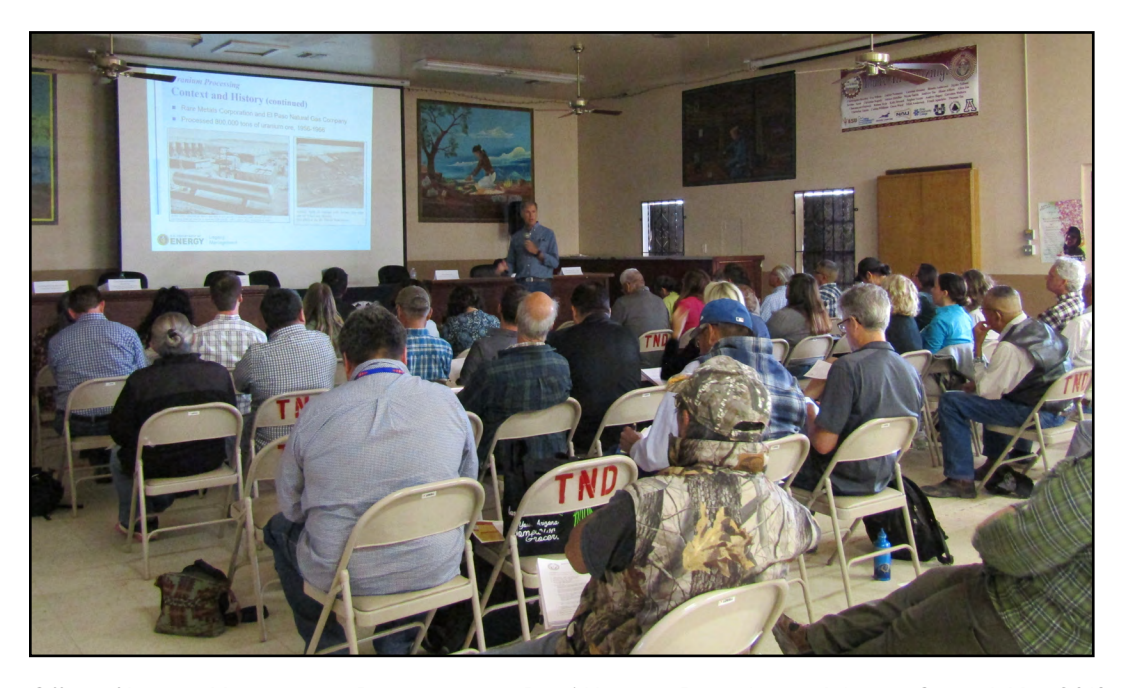
Office of Legacy Management Presentation to Dine' Uranium Remediation Advisory Council, May 2019

Multiple information sources were used to develop this plan, including community interviews, activities currently being performed at the site, site files, and community meeting records.