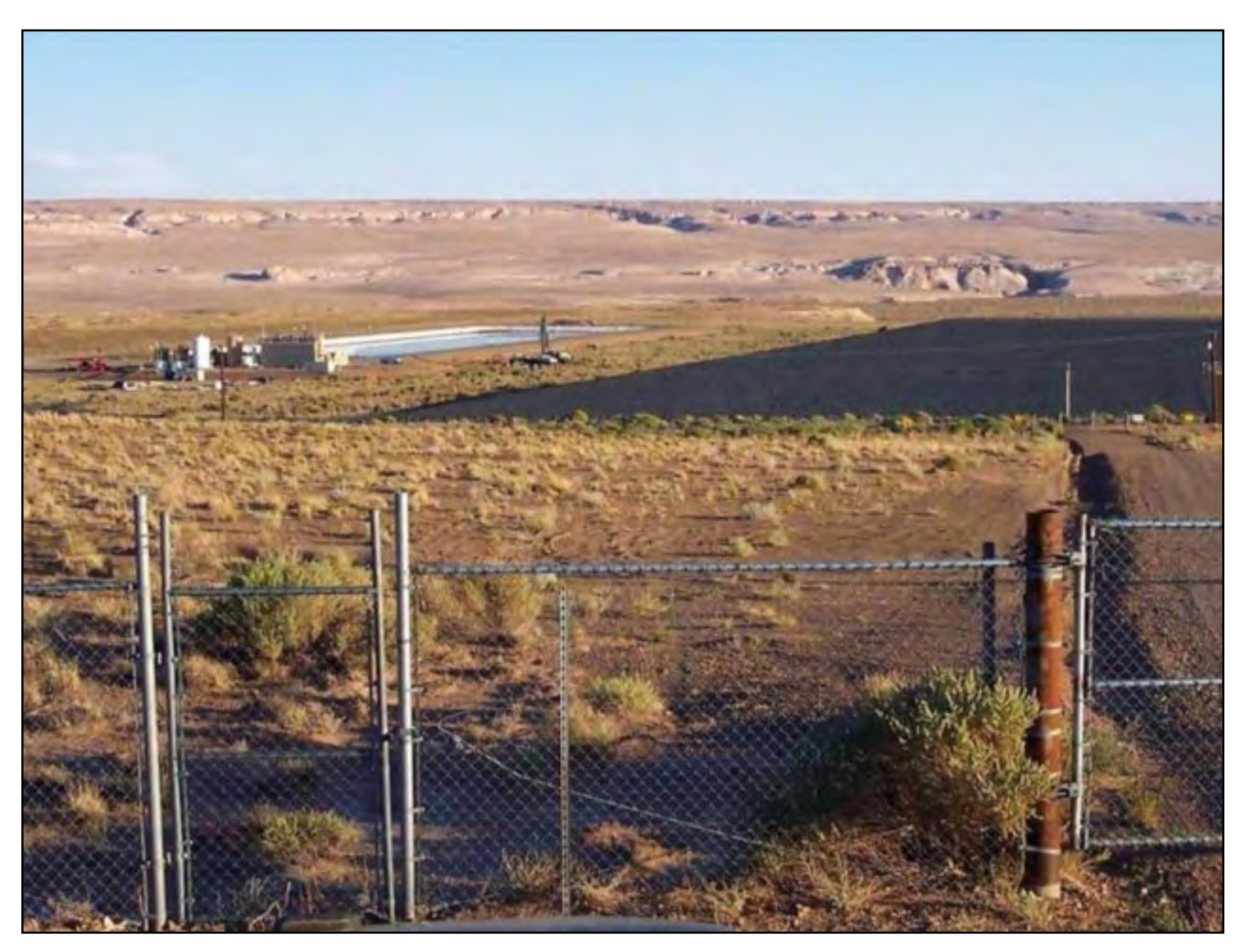
U.S. DEPARTMENT OF ENERGY OFFICE OF LEGACY MANAGEMENT