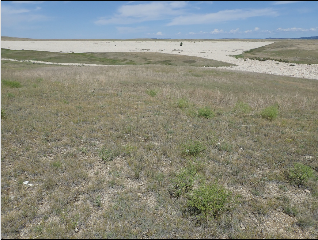
PL-5. Riprap-Armored Containment Dam and Outflow