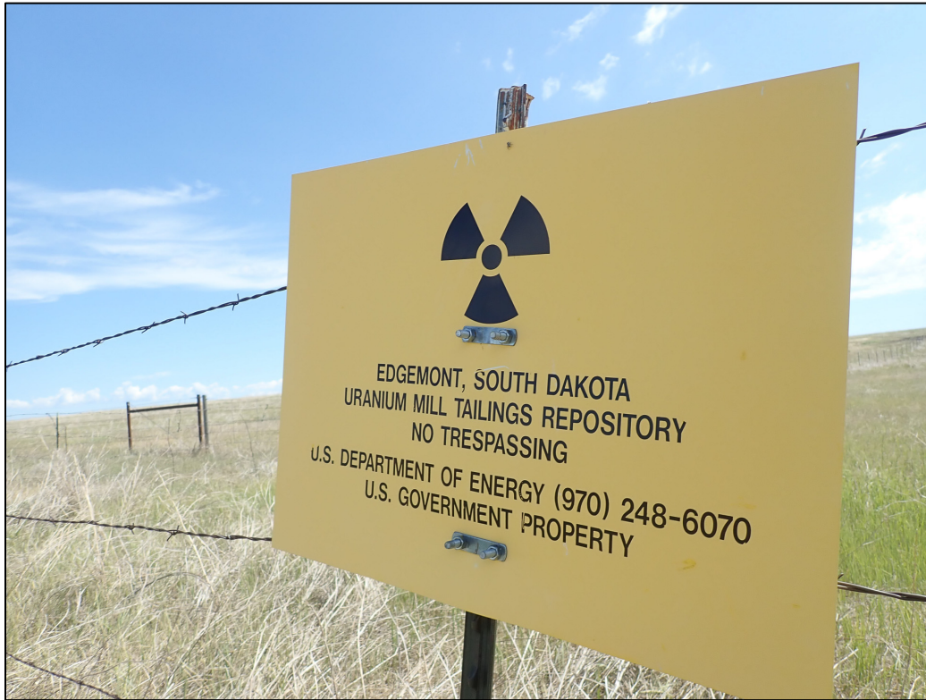
PL-1. Perimeter Sign P1