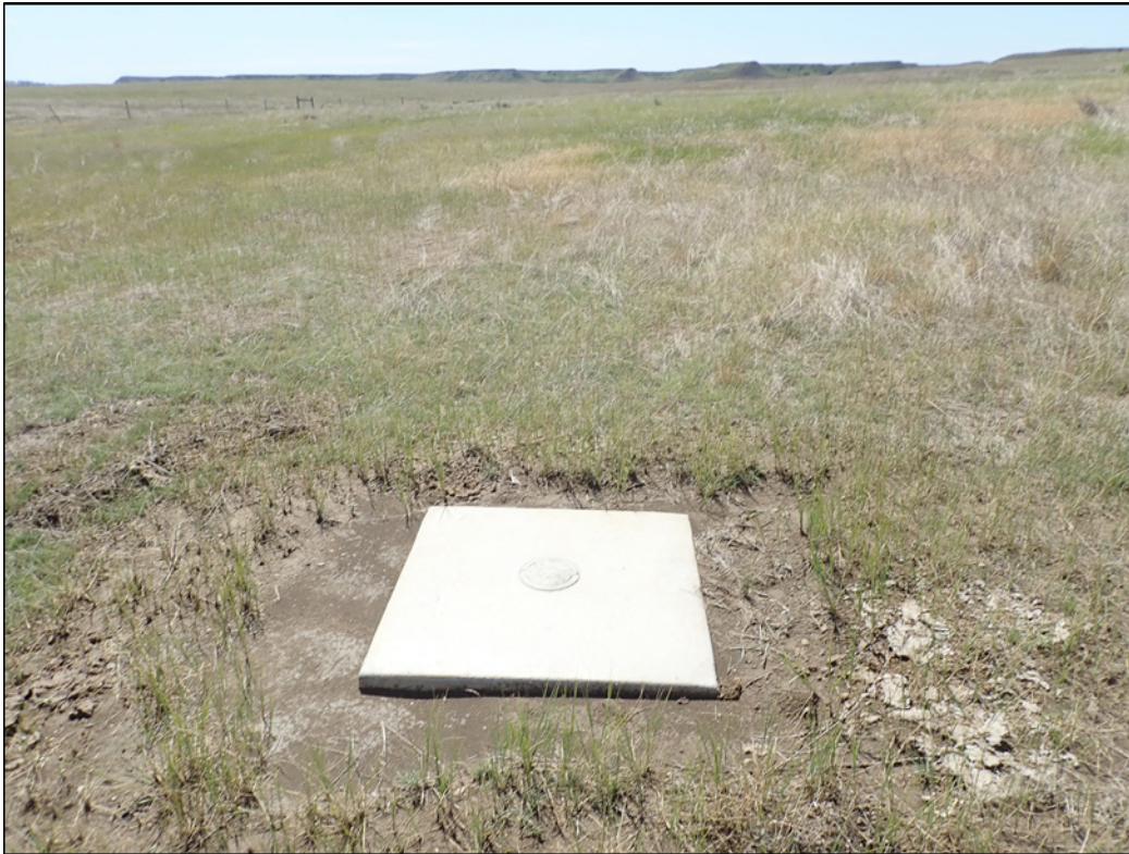
PL-3. Quality Control Monument QC4