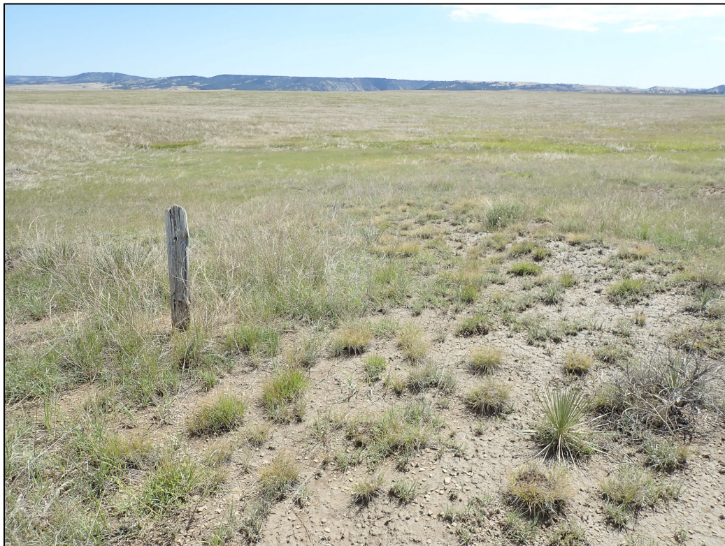
PL-4. Northeast View of Disposal Cell