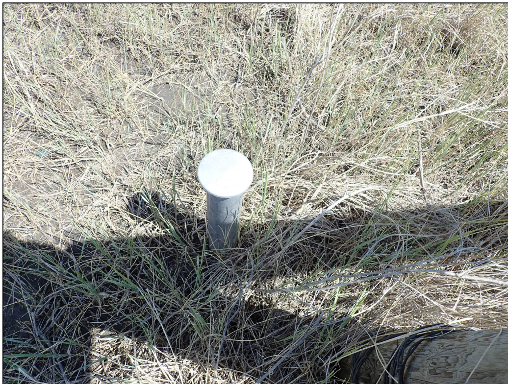
PL-2. Boundary Monument BM-1