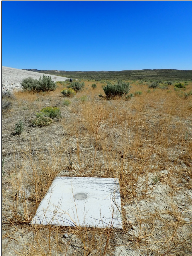
PL-7. Quality Control Monument QC5