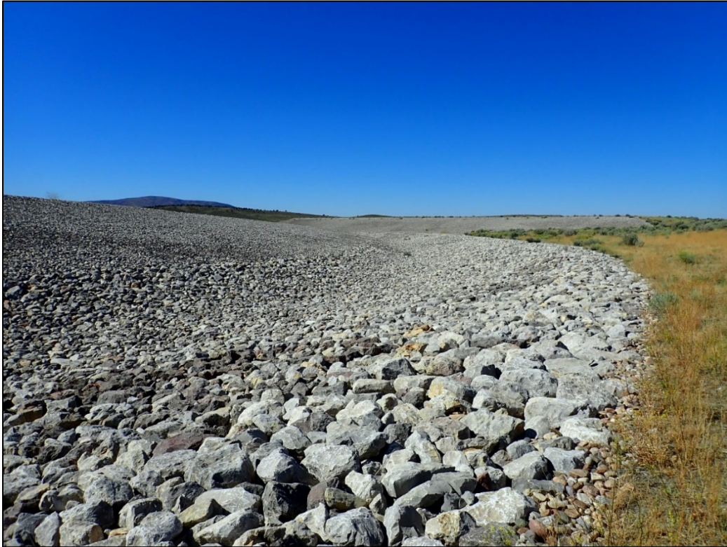
PL-11. Diversion Channel No. 1 and North Side Slope of Disposal Cell