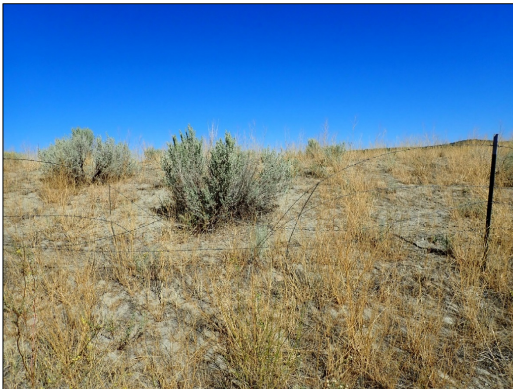
PL-2. Broken Fence Strands Along Northern Perimeter Fence