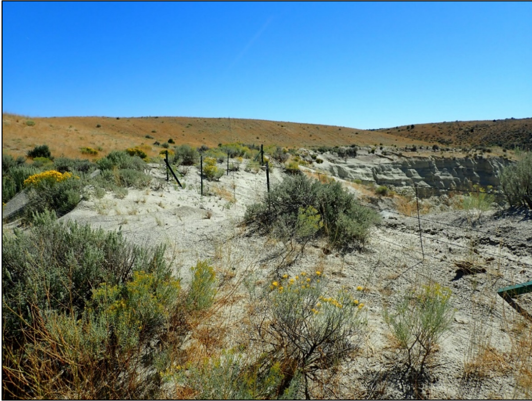
PL-15. Sand Accumulation Around Perimeter Fence near Johnson Pit