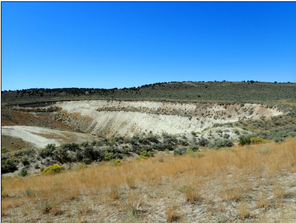
PL-14. Sand Accumulation Around Perimeter Fence with Johnson Pit in Background