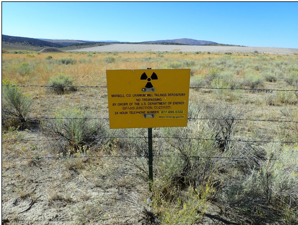
PL-1. Entrance Sign