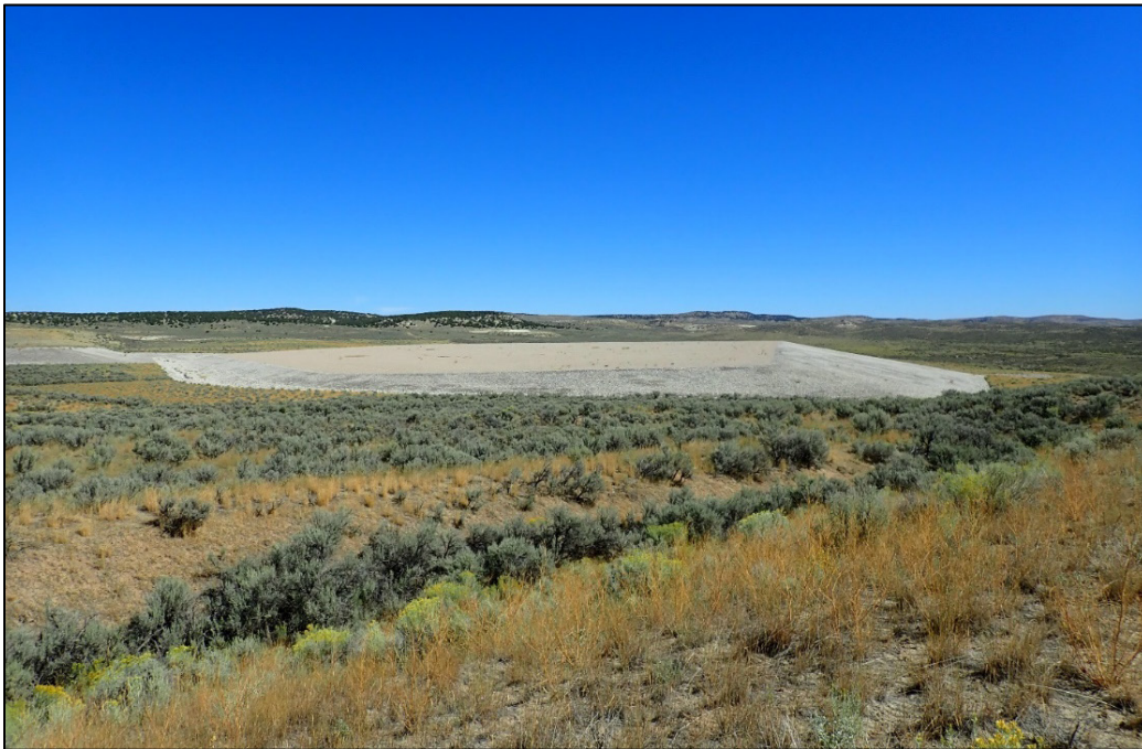
PL-8. Disposal Cell