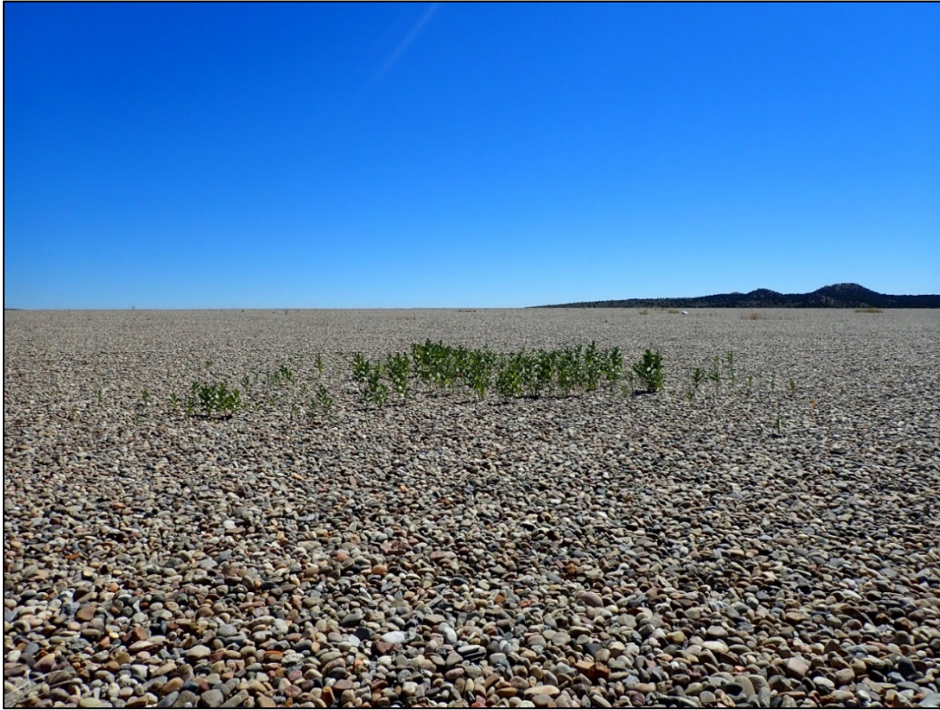
PL-9. Vegetation on Top Slope of Disposal Cell