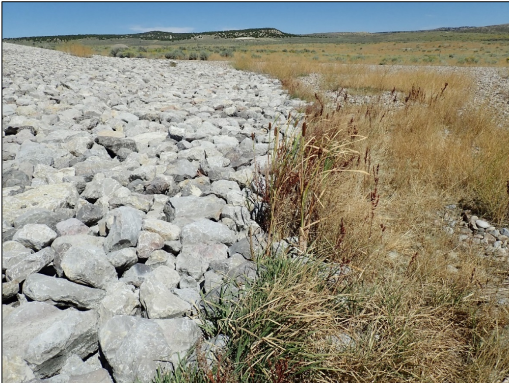
PL-10. Cattails Adjacent to Disposal Cell Toe Slope and Apron