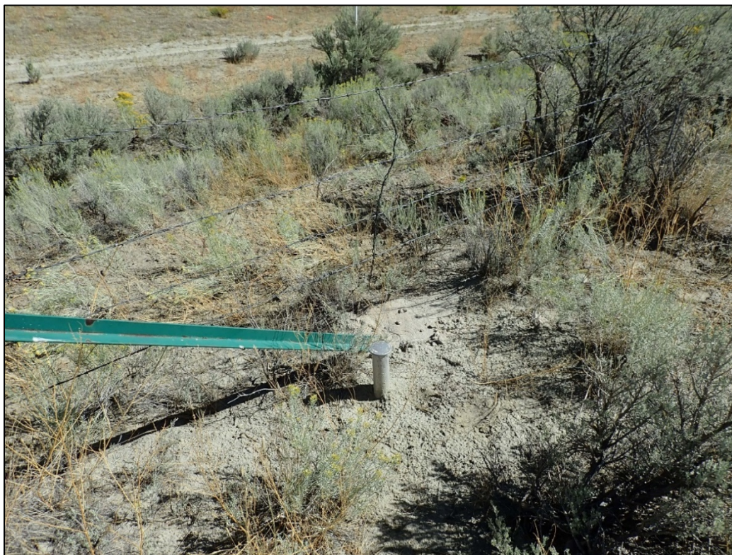
PL-6. Original Boundary Monument BM-1A