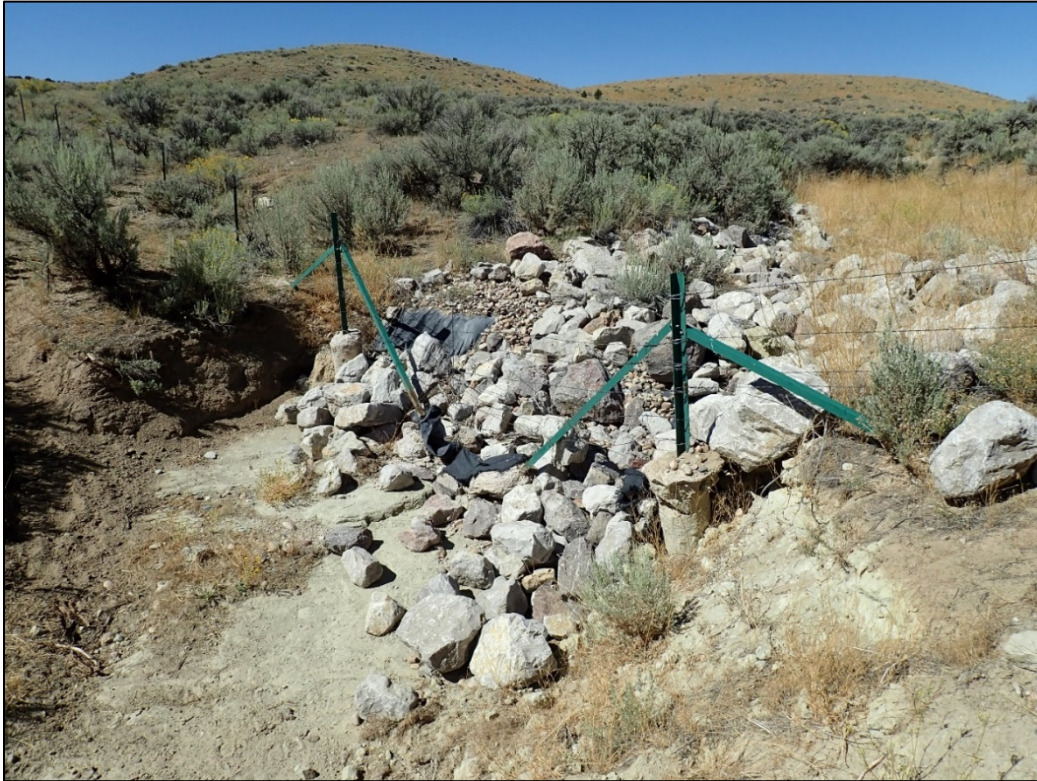
PL-13. Perimeter Fence near Outlet to Diversion Channel No.1