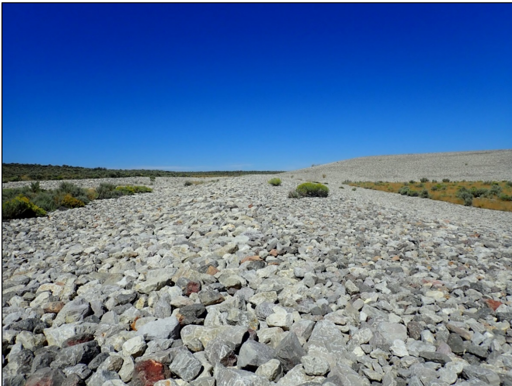
PL-12. Diversion Channel No. 1