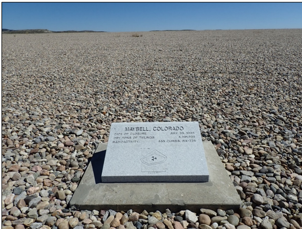
PL-5. Site Marker SMK-2