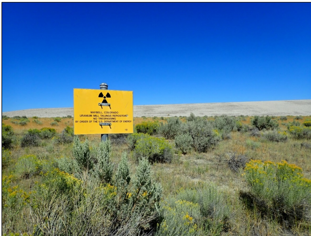
PL-3. Perimeter Sign P18