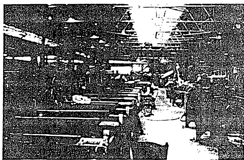
The building interior of the Bliss and Laughlin Steel Site.

In 1972, the facility was sold to Ramco Steel Incorporated; the current owner, Niagara Cold Drawn Corporation, purchased the site in March 1992.