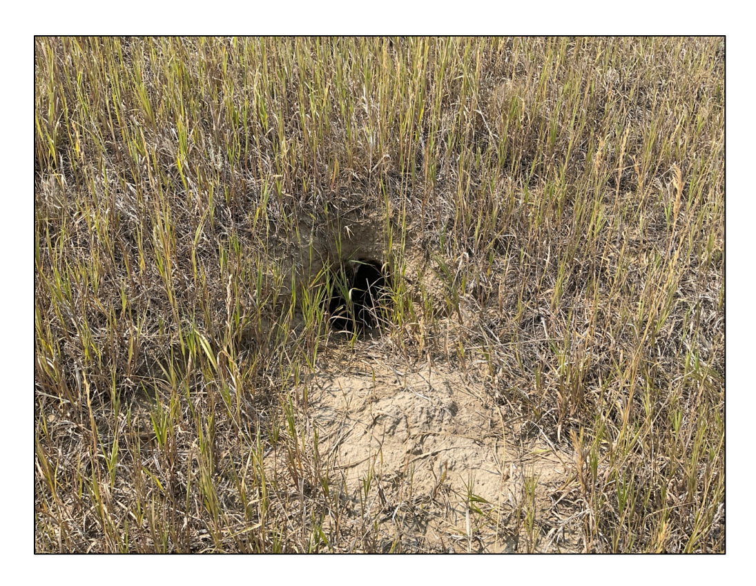
PL-6. Animal Burrow