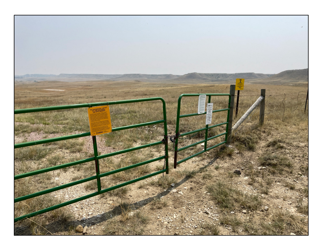
PL-1. Entrance Gate and Sign