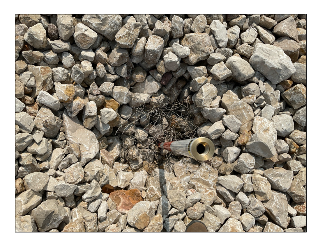
PL-5. Small Depression No. 1