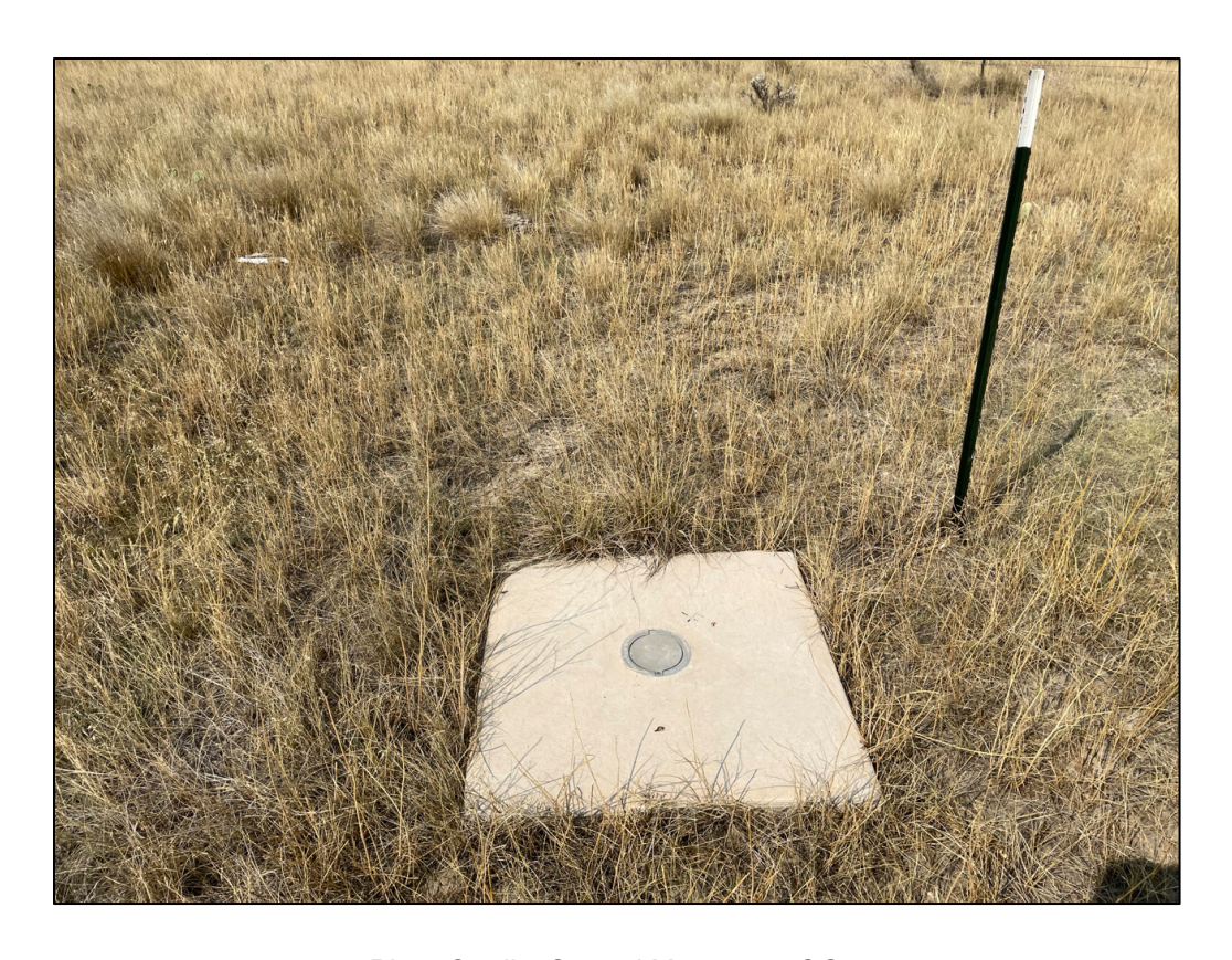
PL-4. Quality Control Monument QC-4