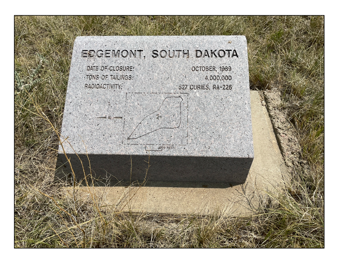
PL-3. Site Marker