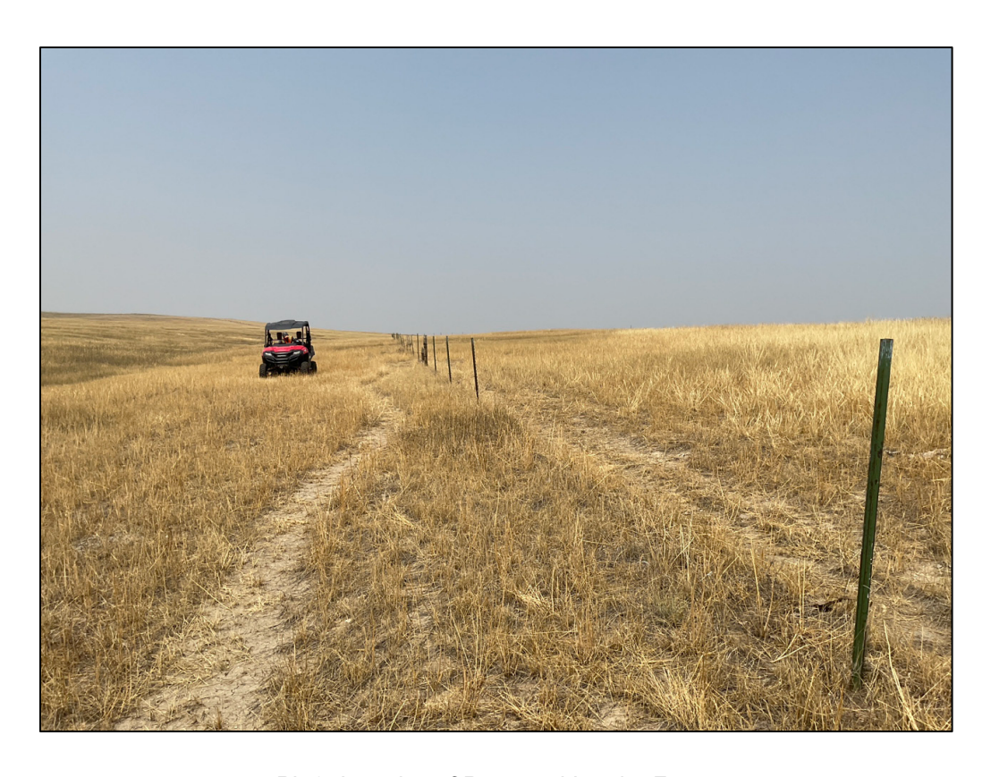
PL-2. Location of Removed Interior Fence