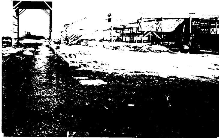
Fig. 2. Concrete pad on which uranium recovery plant was located (note gypsum pile on pad).